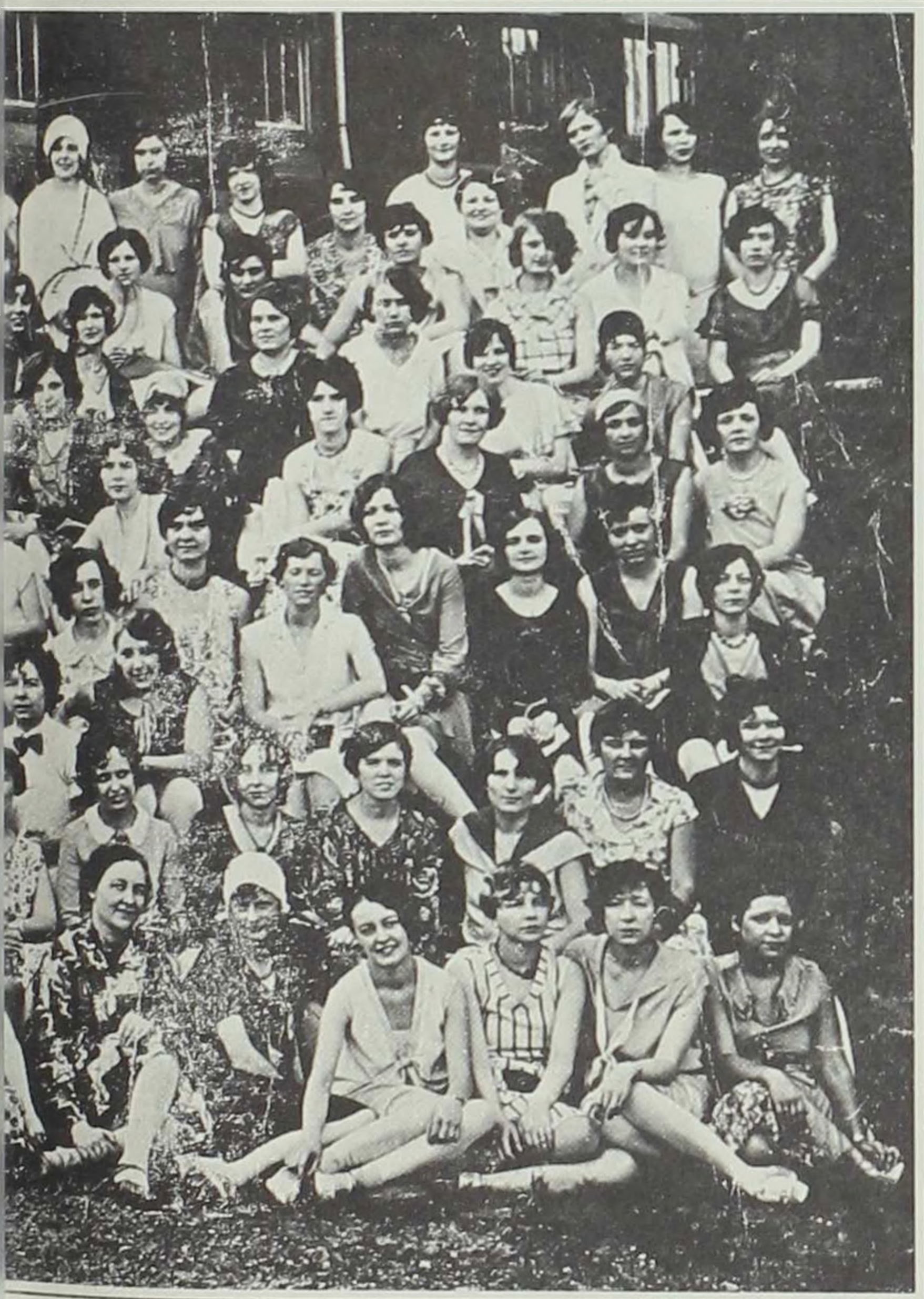
The Conference of Universal Coaches, August 1929 at the studios in Fairfield, Iowa