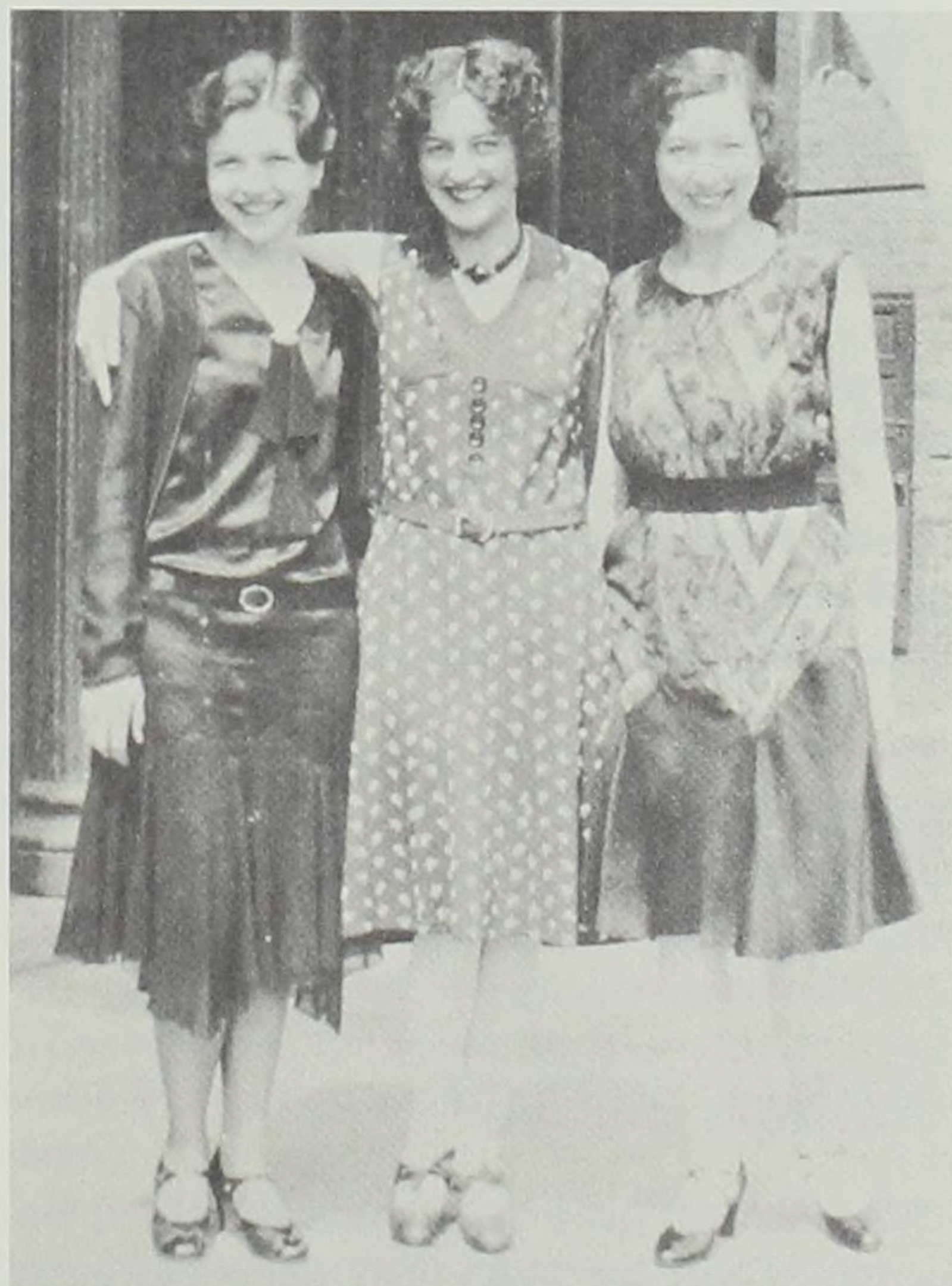
Three Universal coaches

They started the Universal Producing Company in Cedar Rapids around 1926, but they soon returned home to Fairfield, the small town that was to be their headquarters for more than 20 years. The company prospered through the worst years of the Depression, continuing to send out troops of young women, eventually expanding into the production of simulated radio amateur hours and motion picture exhibitions.