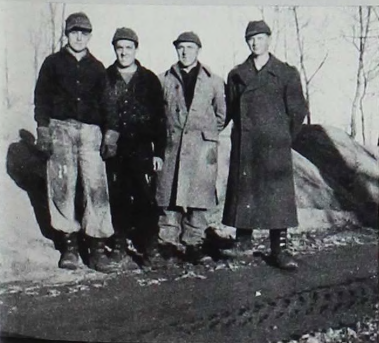
POWs pause during winter work.