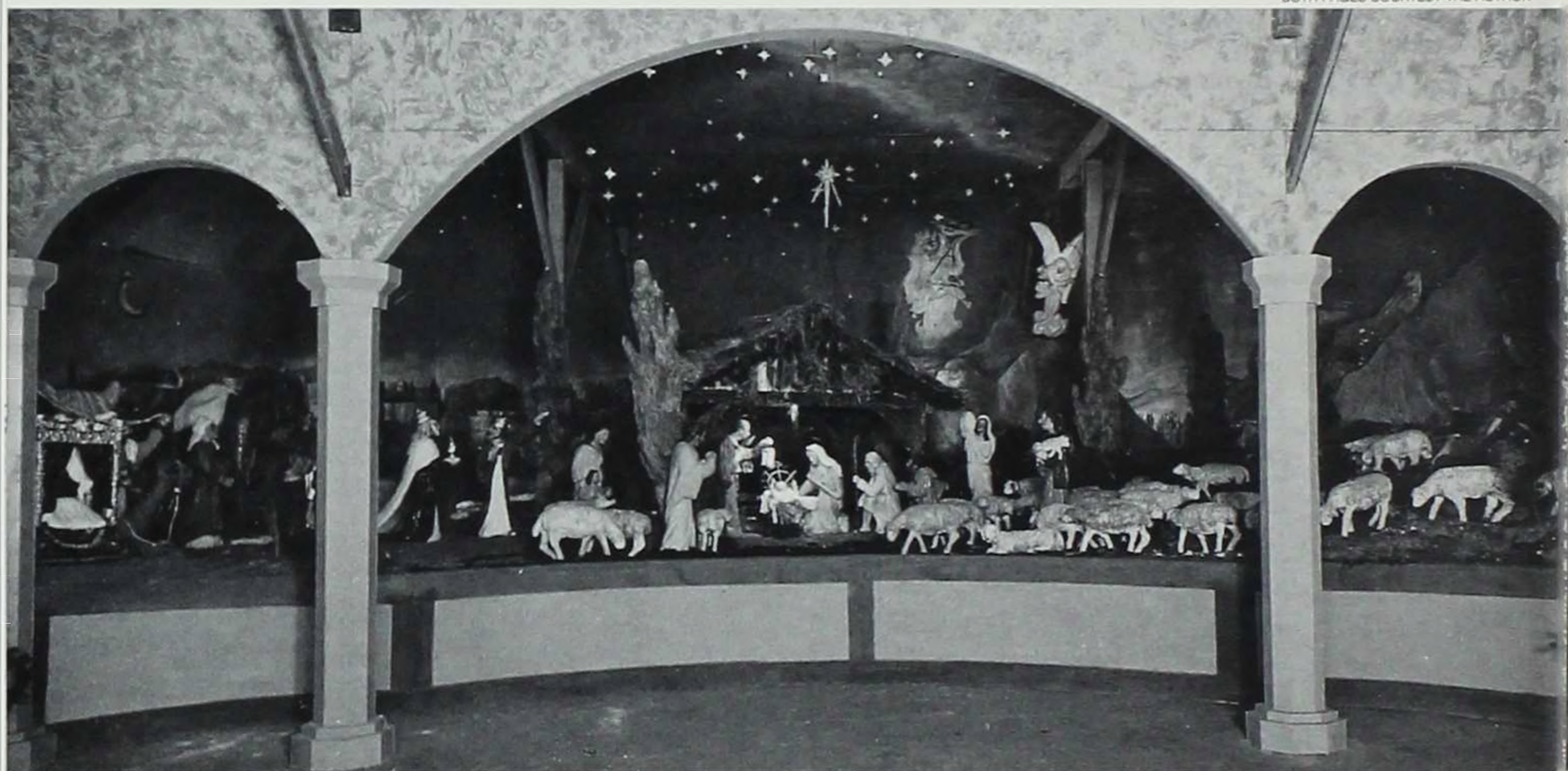
The nativity scene as it first appeared at Christmas 1945. The photo was part of a souvenir folder.

assistants were put on the honor system and allowed to work in the American garrison section. A storage building for sports equipment became Kaib's studio and storehouse.