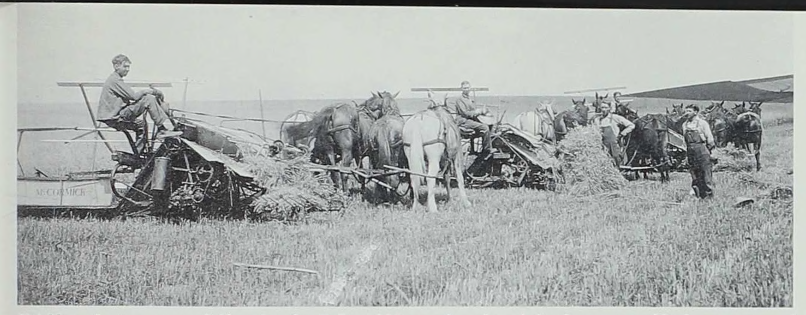
Neighbors sharing summer field work took relief in cold lemonade and ample lunches, prepared by farm women and carried down country roads and across fields by farm kids. Above, cutting and binding grain on the Wear farm, 1918.

canning jars for us and buckets given freely to the neighbors.