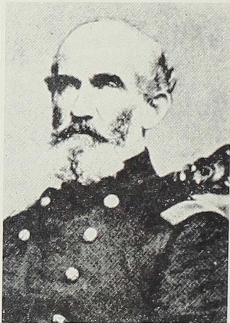
GEN. A. J. SMITH

At Nashville, Thomas had the cavalry under Wilson; the detachment of the Army of the Tennessee under Smith; the 4th Army Corps under General Thomas J. Wood; the 23rd Army Corps under Scofield; and a number of miscellaneous regiments. Hood had three corps commanded by Generals Benjamin F. Cheatham, Alexander P. Stewart, and Stephen D. Lee. Most of Forrest's cavalry had been sent to Murfreesboro to destroy the railroad there. In addition, Hood's army had