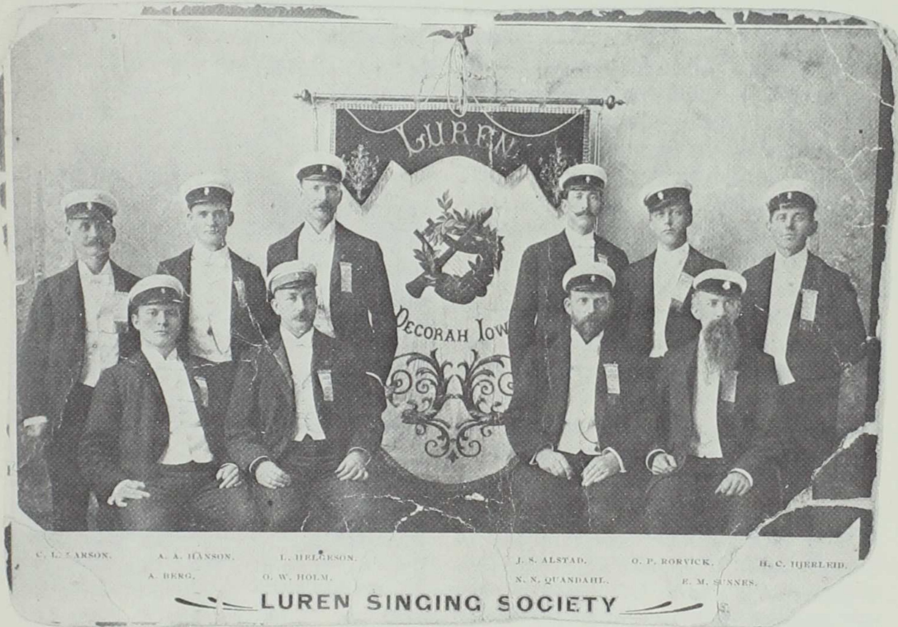
The Luren Singers as they appeared in an early twentieth-century photo. All of those pictured, save one, made the trip to Spring Grove in 1900.