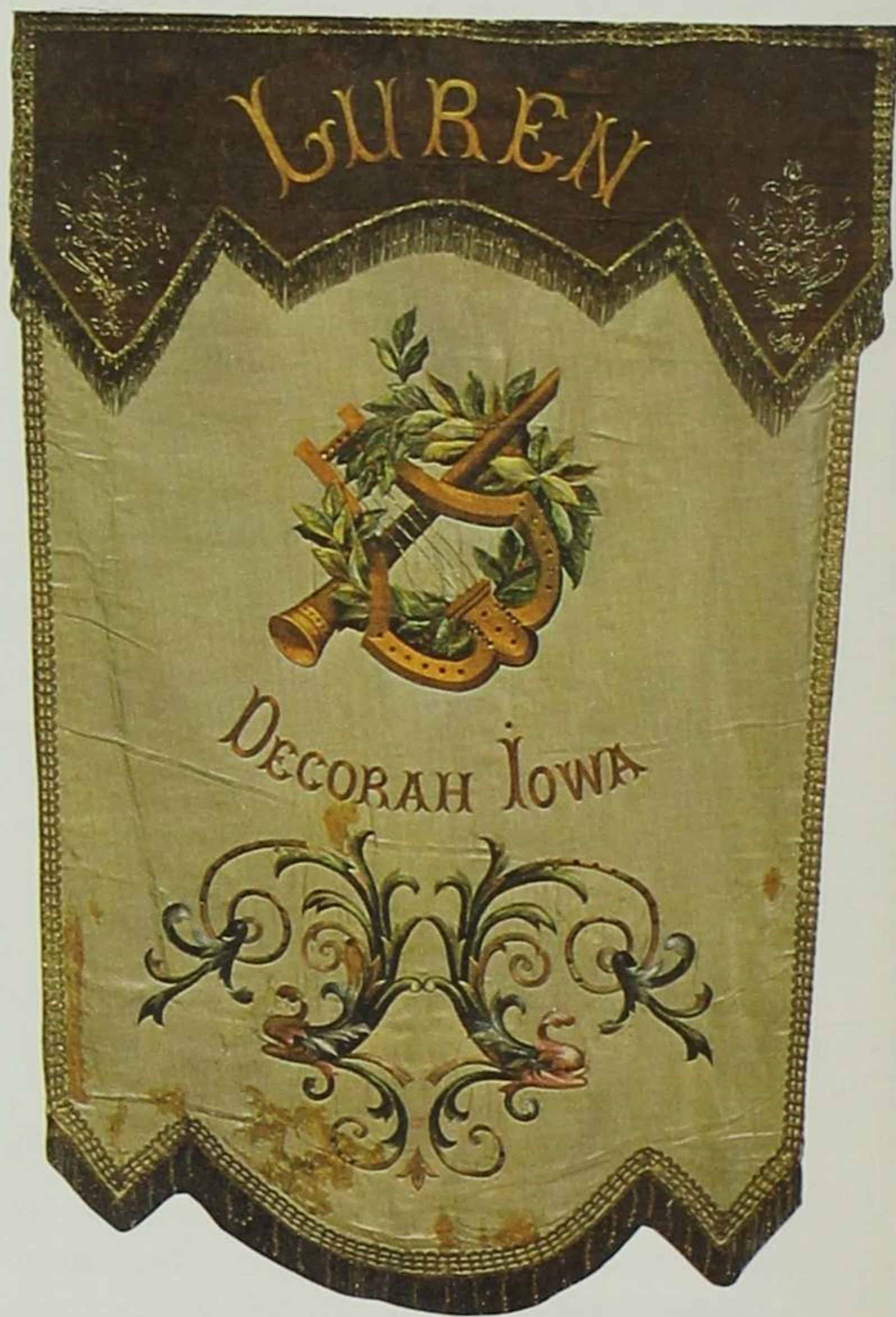
The banner of Luren made by the Fjelde sisters and first unfurled in 1902. The relic is now preserved among the collections of Vesterheim.

Along with the heavy, self-conscious spirit of Norwegian nationalism, a new