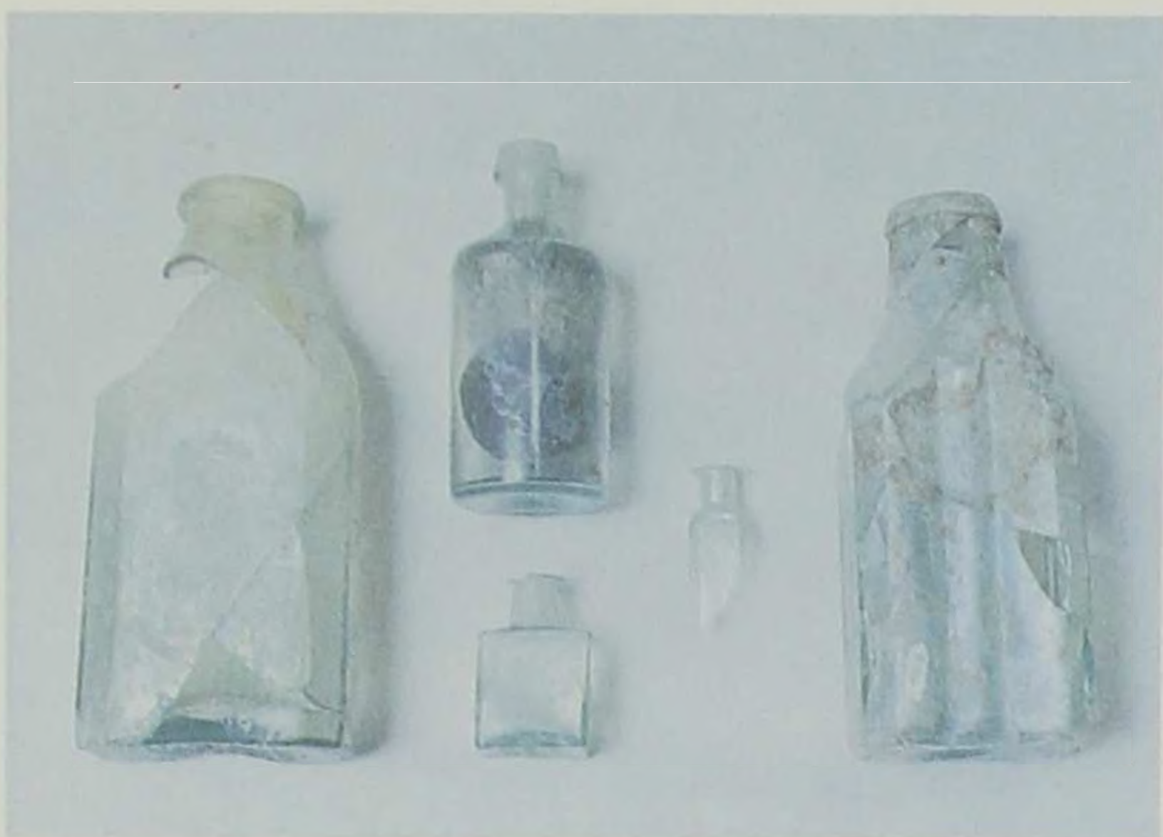
The two large bottles may have contained pickles; the small vial was for medicine. The two ink bottles had glass stoppers, and a large, hardened ball of dried ink is visible inside one.