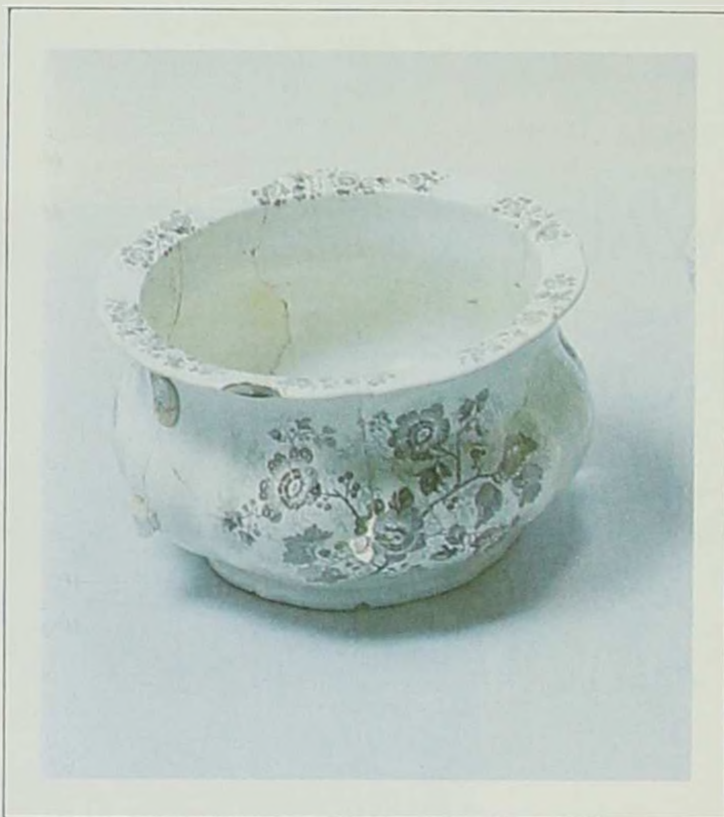
One of the necessities of life, a chamber pot, used to avoid a night journey to the privy.

An interesting contemporary collection of china, glassware, and other artifacts used at the Fort was obtained by excavating the officers' privies, where the officers and their wives routinely discarded broken household objects. Many of these items have now been restored and will be put on exhibit when the Conservation Commission remodels the Fort museum. The collection, including small fragmentary pieces, is of considerable historical