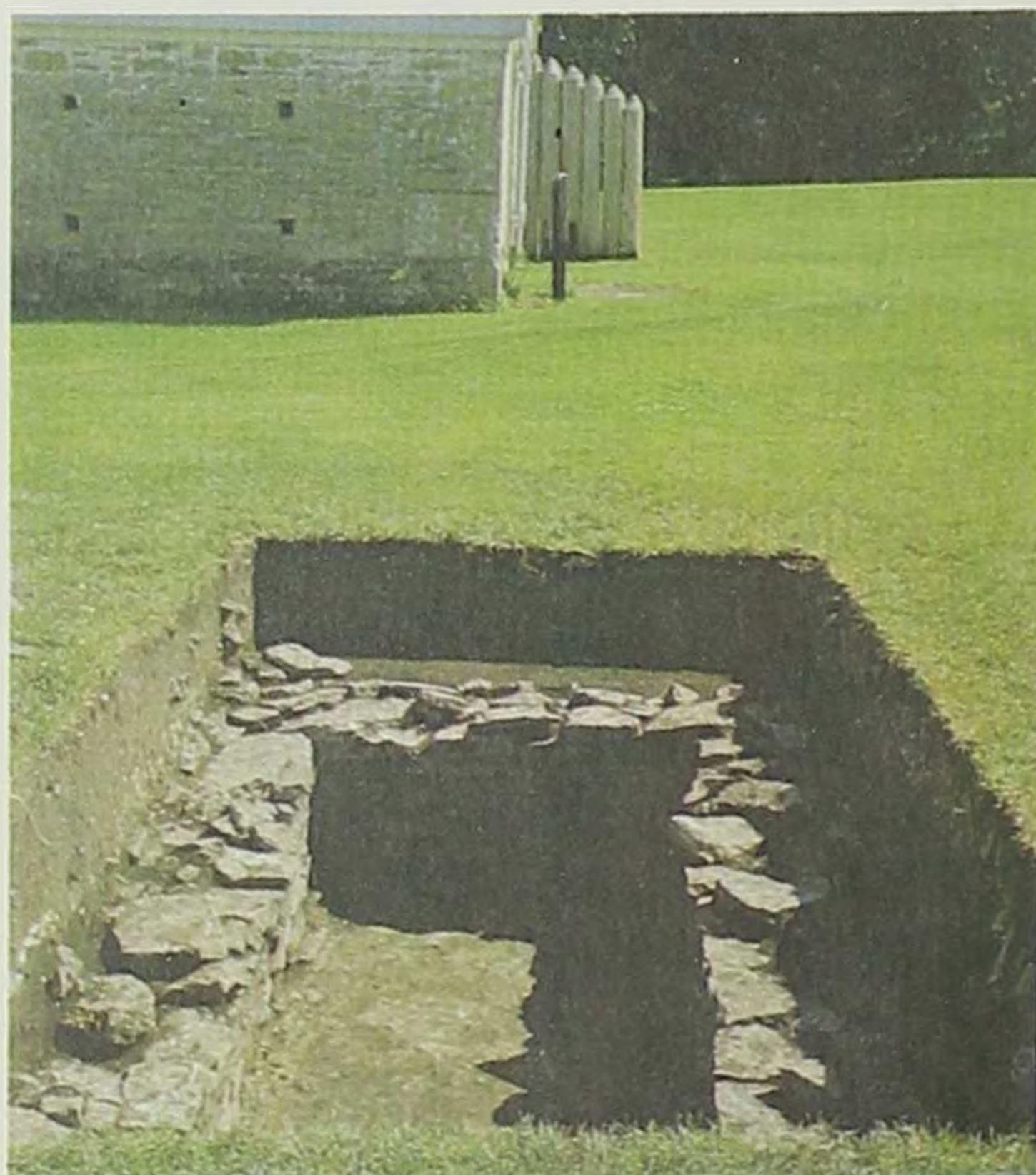
One of the officers' privies with the Fort's powder magazine in the background.

time that this would be a permanent military post. Masons and carpenters were employed to assist and direct the soldiers, so the stone and timber buildings had a much more elaborate appearance than the usual frontier fort. A military road began at the ferry landing on the west side of the Mississippi, below what is now Effigy Mounds National Monument, and traces of this road can still be seen. It usually took two days for supply wagons to reach Fort Atkinson, so a half-way house was built on the road. Just after the Fort was completed, the Mexican War began in 1846, and the regular U.S. Army troops at Fort Atkinson were withdrawn to join the conflict. They were replaced by volunteer Iowa troops which garrisoned the Fort until 1849. By the mid-1840s, the settlers in