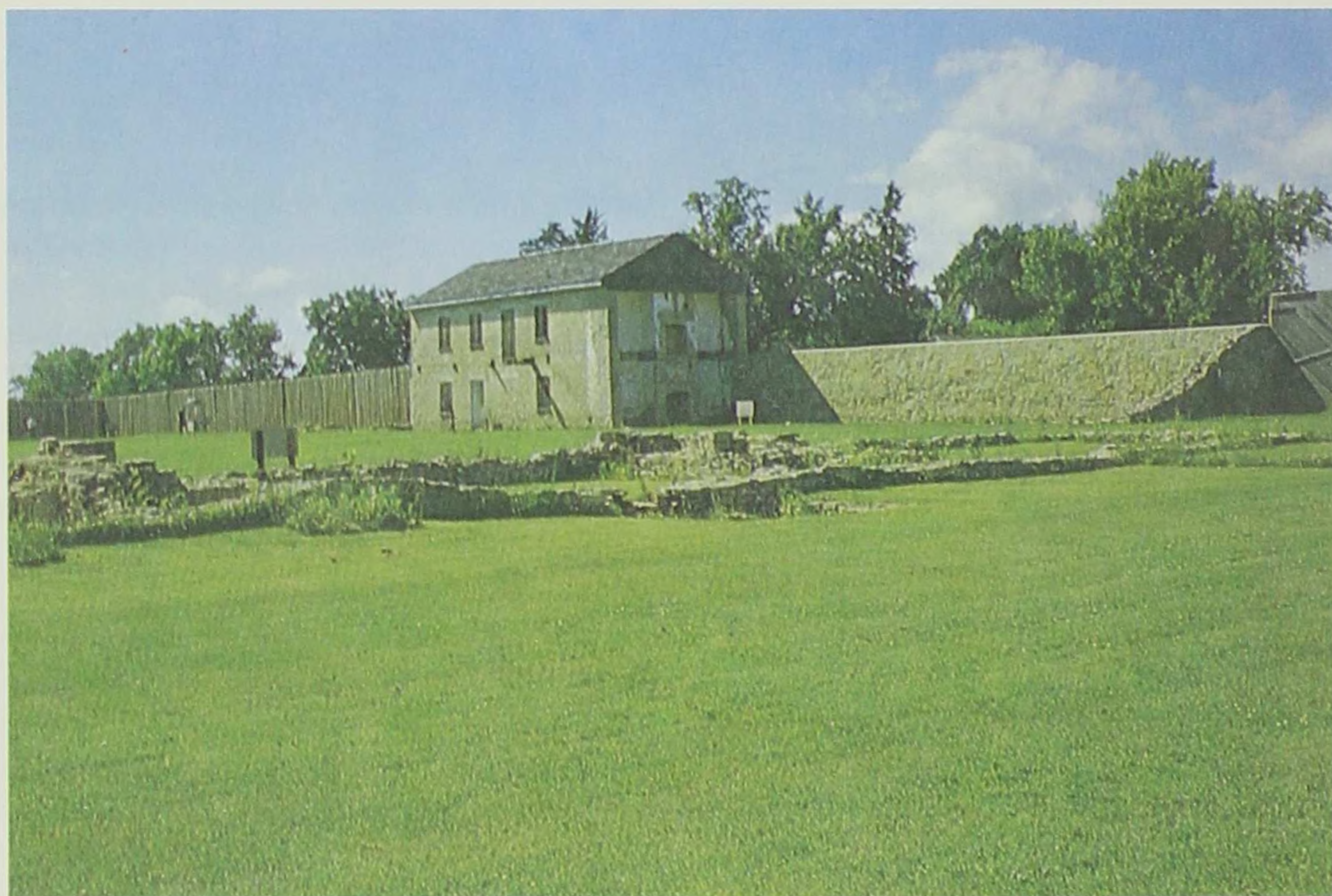
The surviving barracks building at Fort Atkinson, now a museum.

time that this would be a permanent military post. Masons and carpenters were employed to assist and direct the soldiers, so the stone and timber buildings had a much more elaborate appearance than the usual frontier fort. A military road began at the ferry landing on the west side of the Mississippi, below what is now Effigy Mounds National Monument, and traces of this road can still be seen. It usually took two days for supply wagons to reach Fort Atkinson, so a half-way house was built on the road. Just after the Fort was completed, the Mexican War began in 1846, and the regular U.S. Army troops at Fort Atkinson were withdrawn to join the conflict. They were replaced by volunteer Iowa troops which garrisoned the Fort until 1849. By the mid-1840s, the settlers in