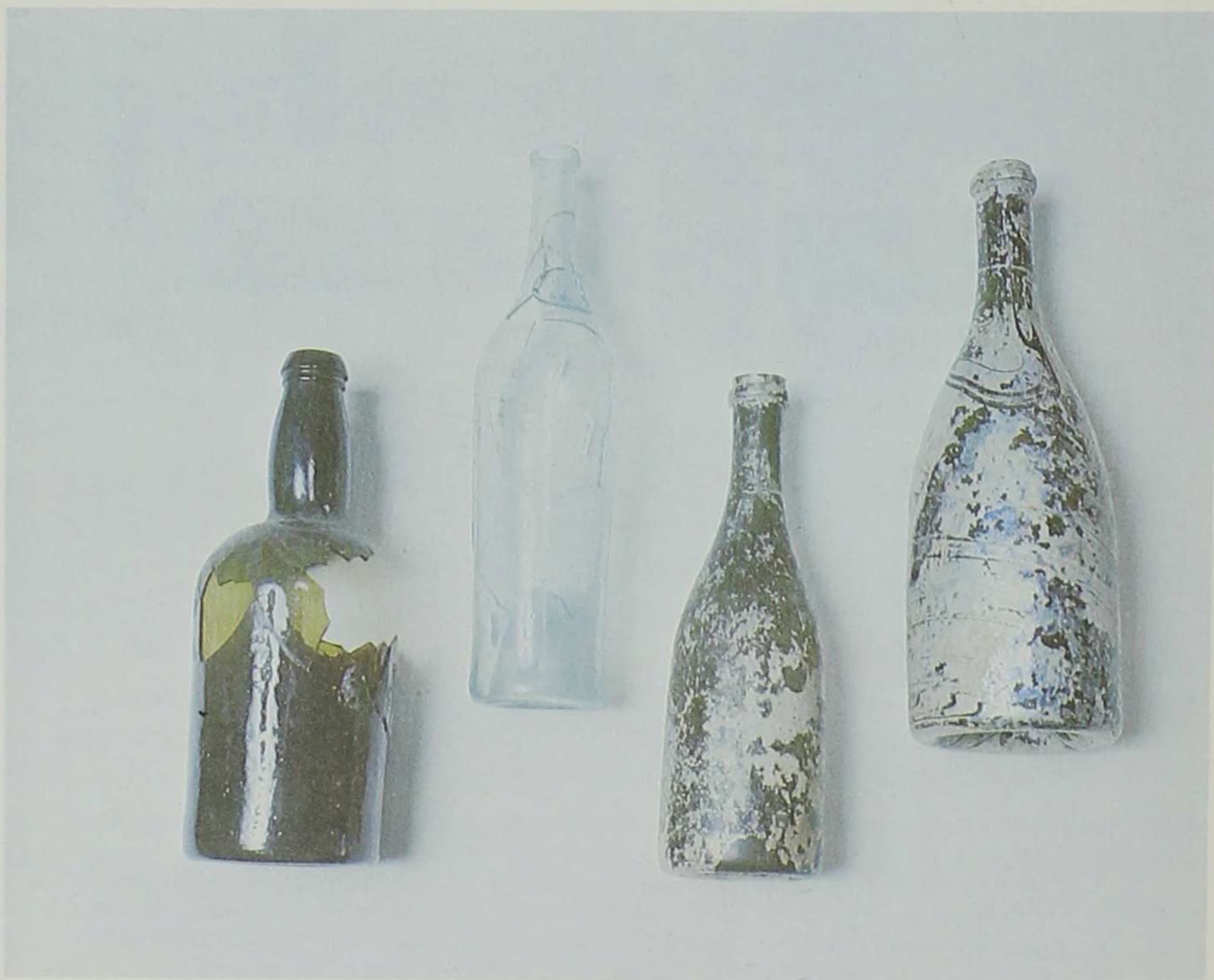
Bottles were standard throw-away items at Fort Atkinson. The variety shown here are typical. From left to right, contents were champagne, wine, olive oil, and brandy. Imported French wines were common at frontier forts, and the olive oil bottle has a glass seal proclaiming its French origin.