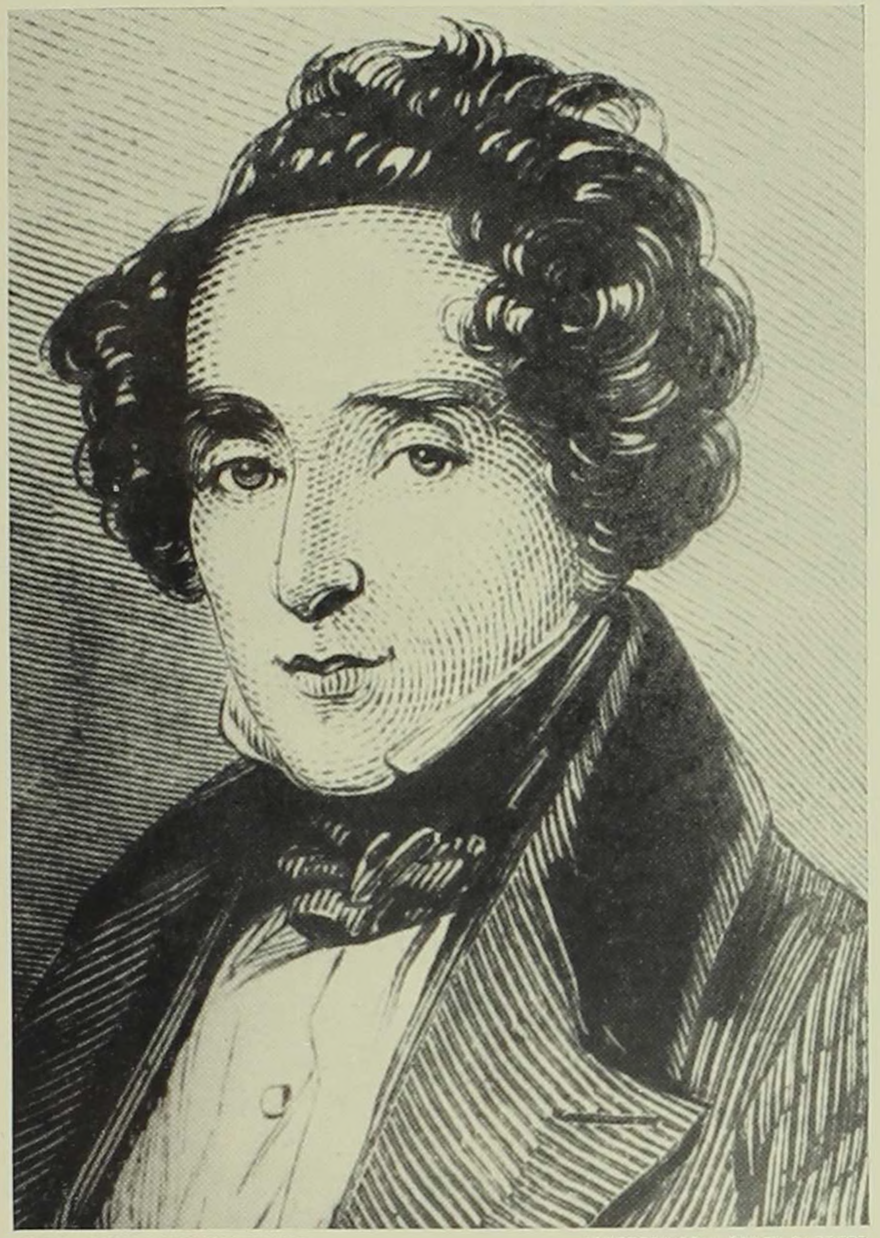
DRAWN FROM A DAGUERREOTYPE