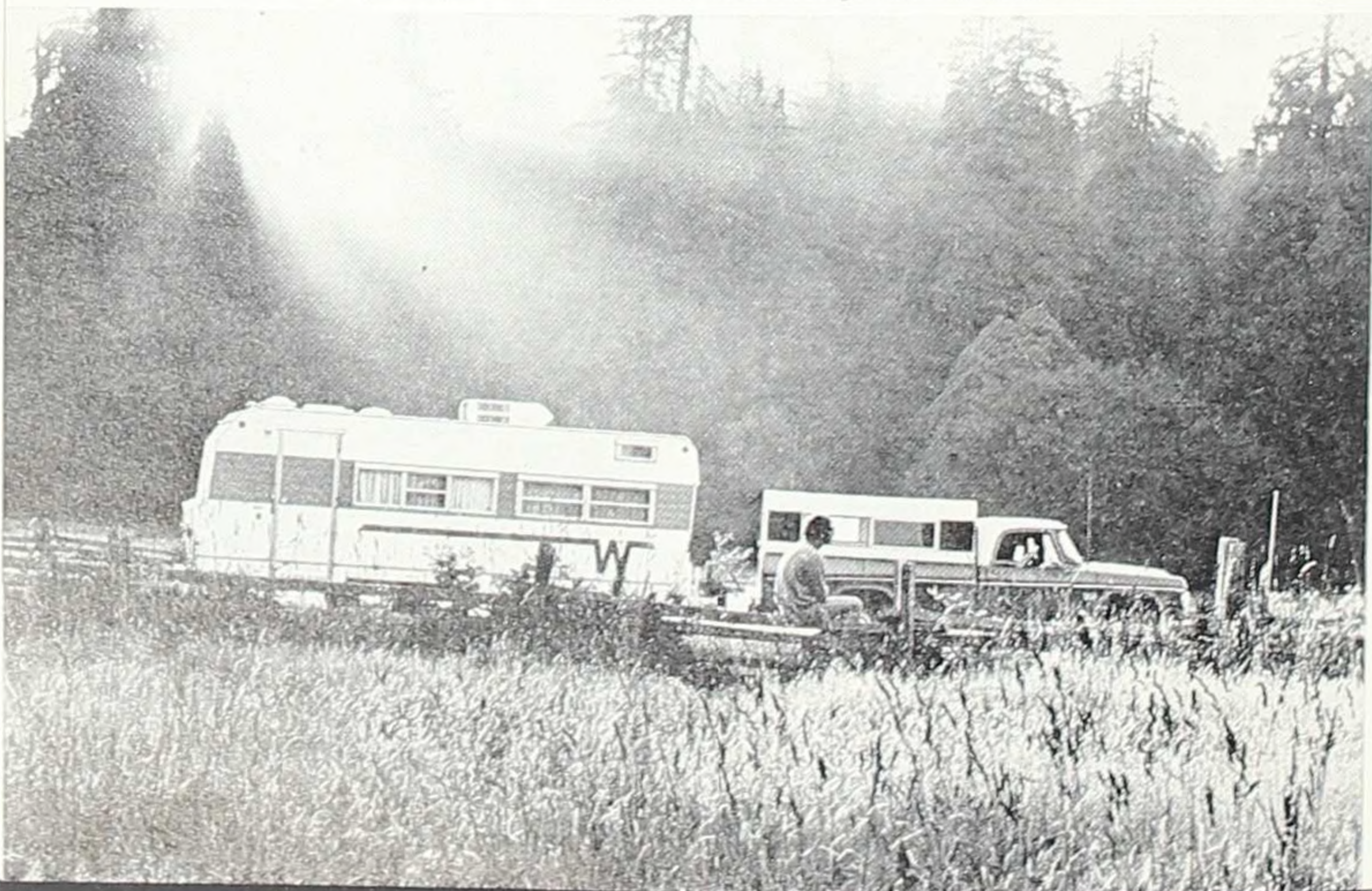
Watching the sun rise over the Pacific coast rain forests of California is a solitary figure whose family makes use of a pickup and a Kap pickup cover to pull a Winnebago travel trailer on a vacation trip.