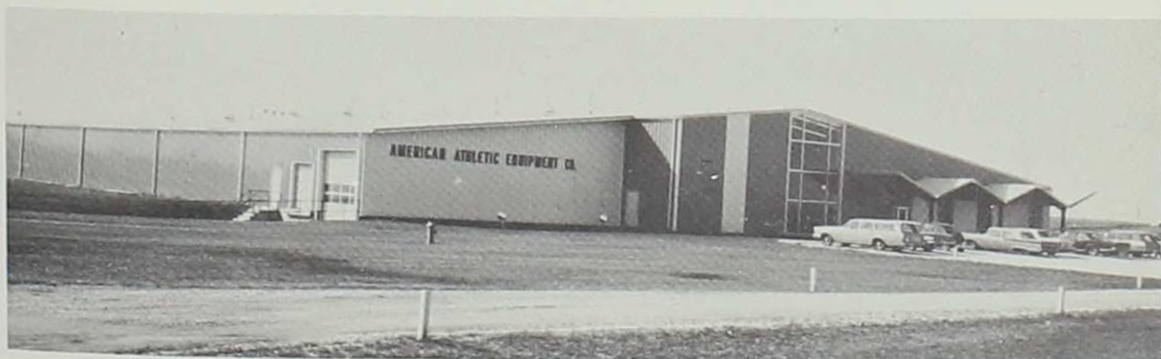
The American Athletic Equipment Division plant at Jefferson.