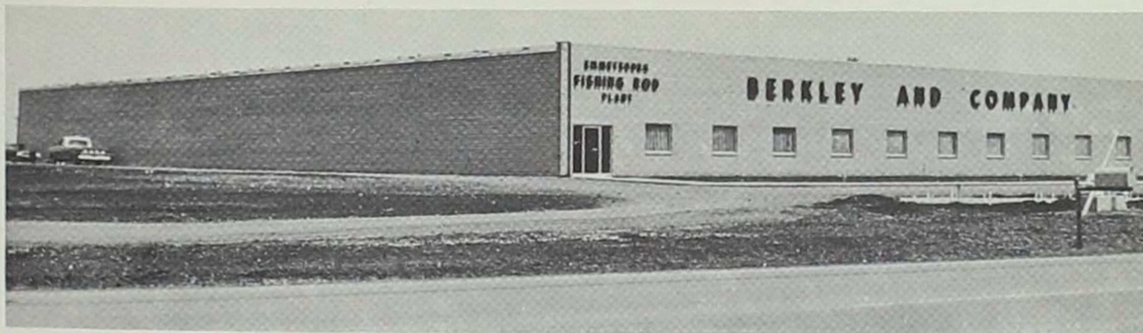
The Berkley plant at Emmetsburg is responsible for the manufacture of the company's fishing rods.