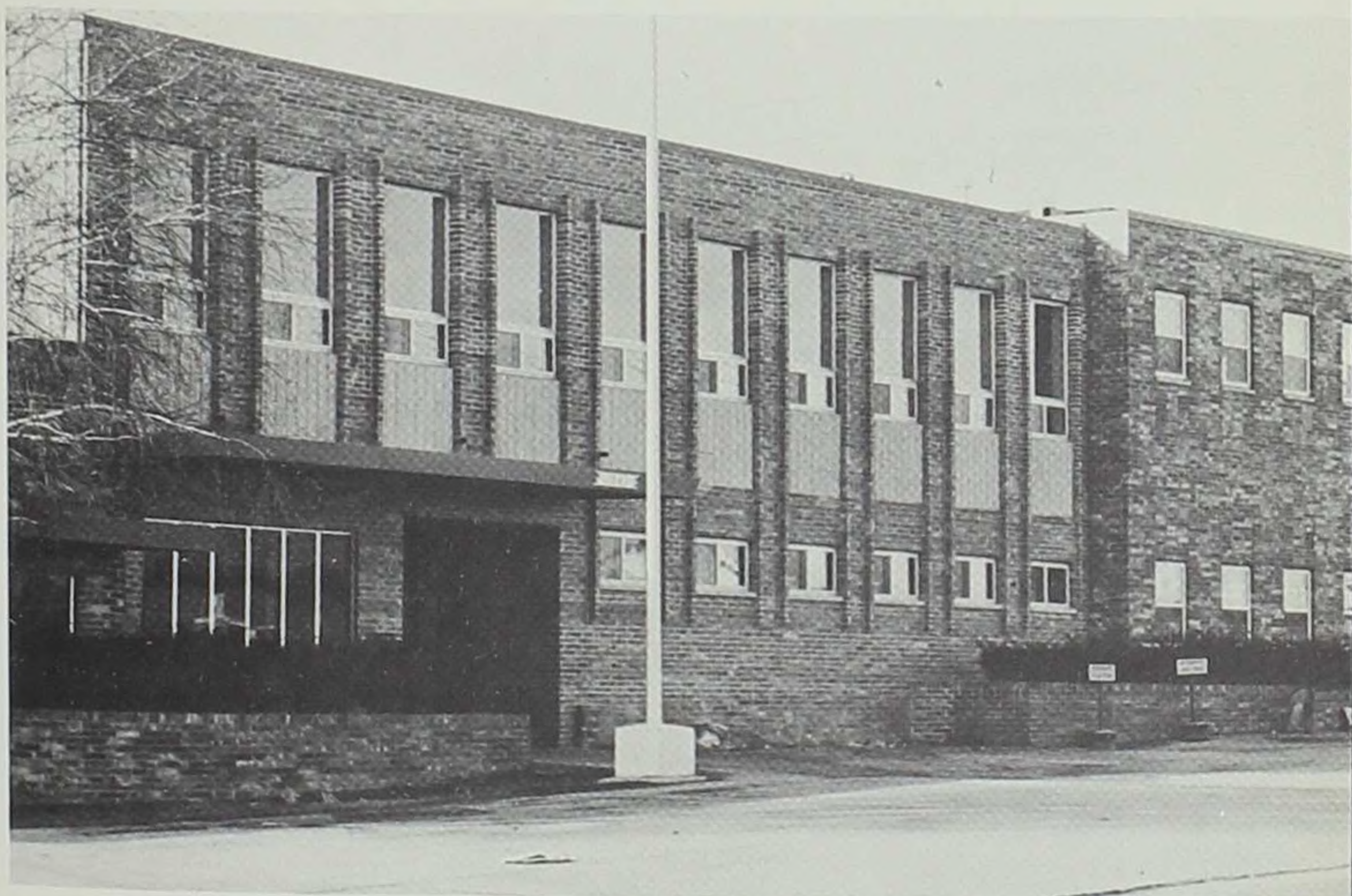
The Den-Tal-Ez plant at Des Moines.