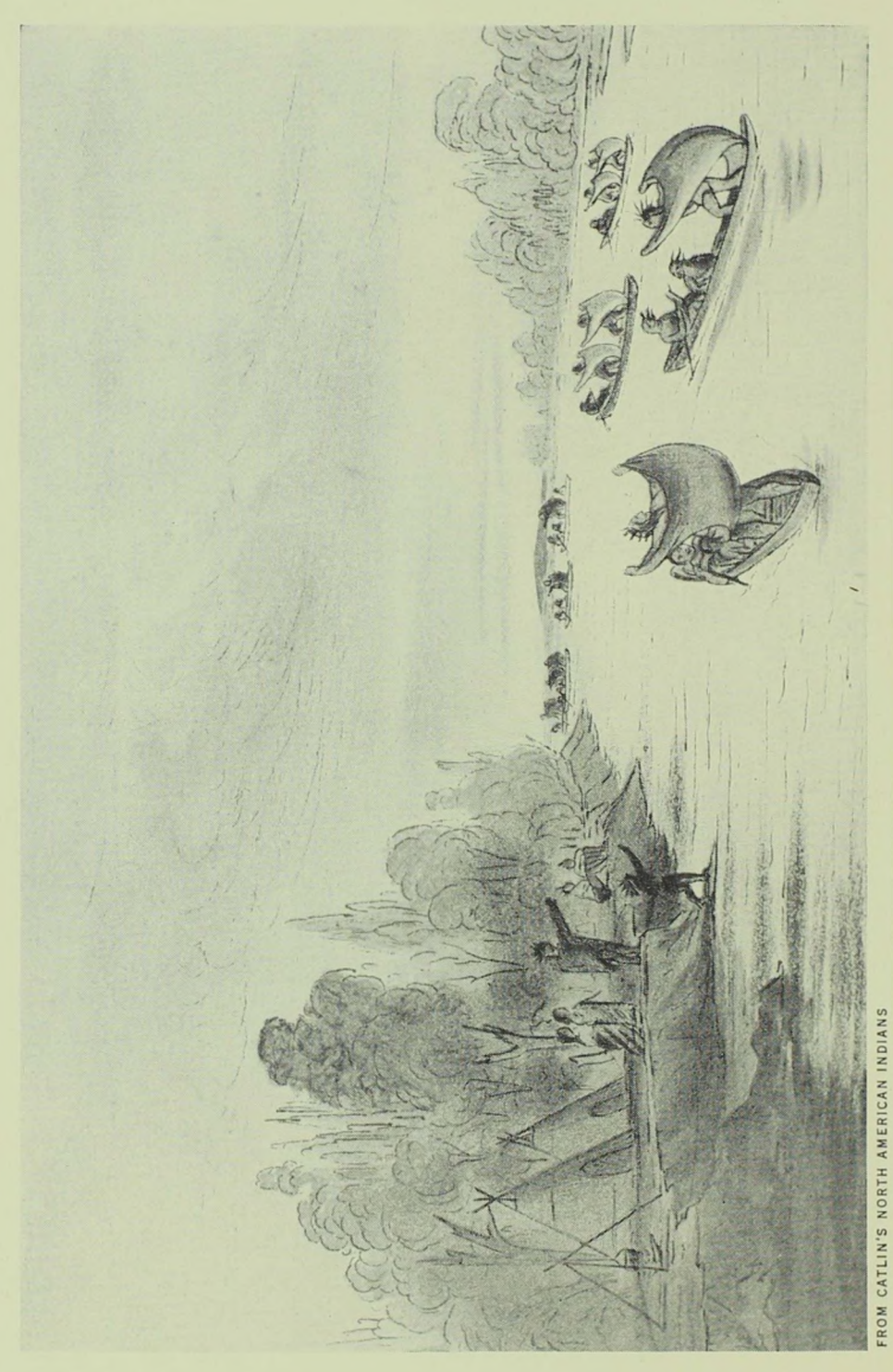
SACS AND FOXES SAILING THEIR DUGOUT CANOES