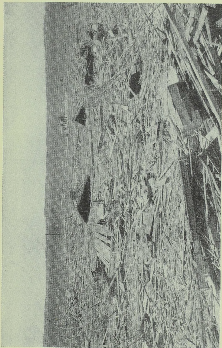
FROM THE STORY OF A STORM