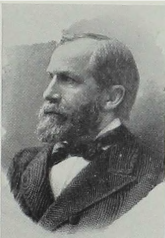
William Larrabee Governor