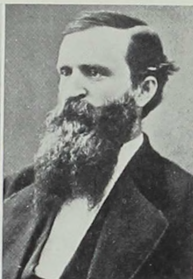
James B. Weaver Populist Leader