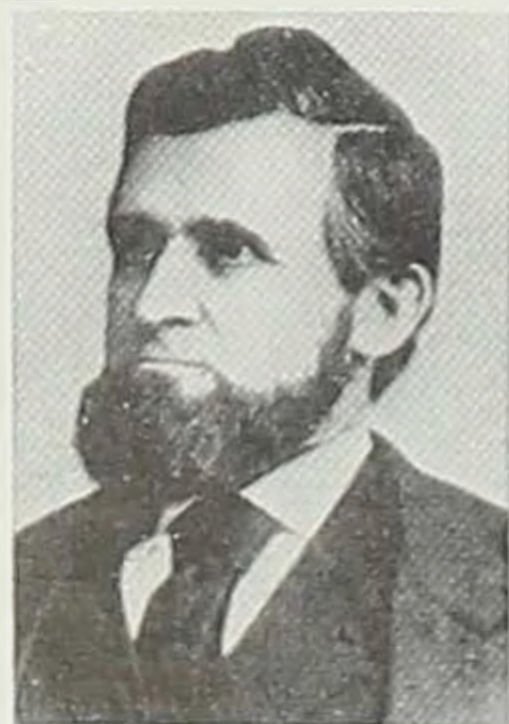
Oliver H. Kelley