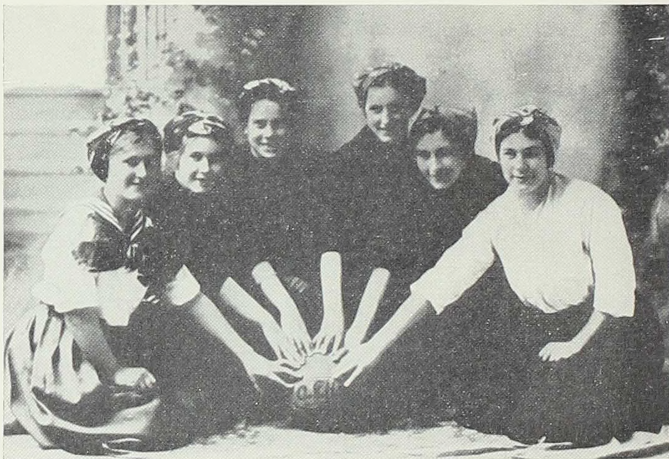
COON RAPIDS GIRLS' TEAM OF 1922