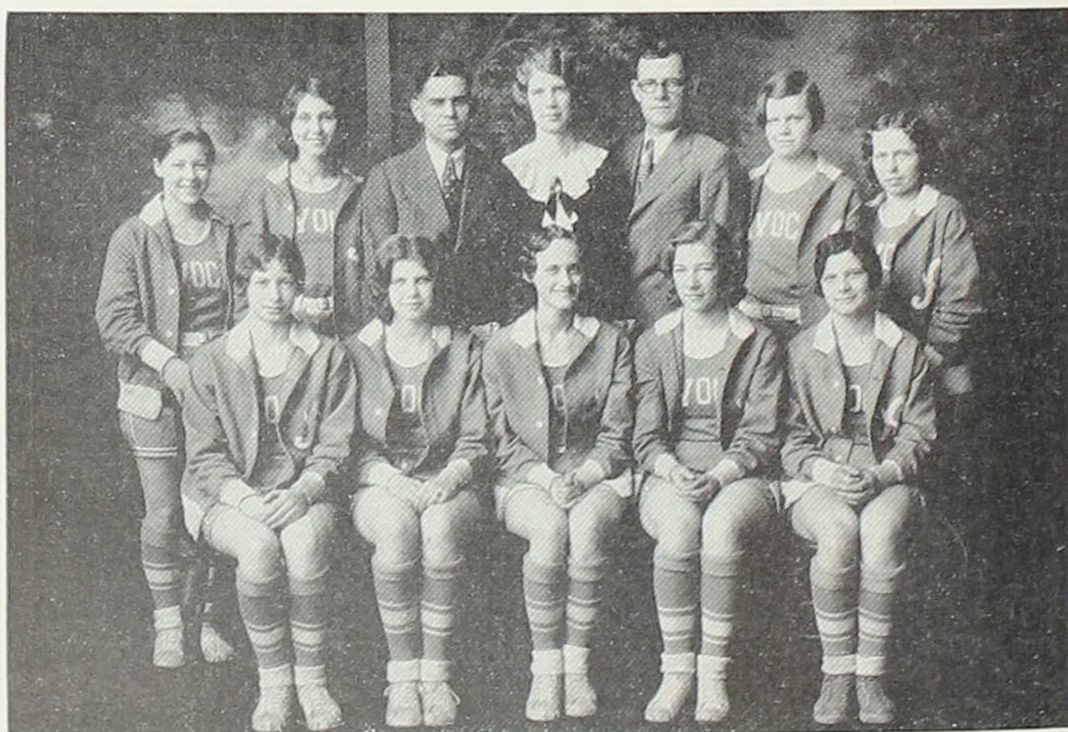
AVOCA STATE CHAMPIONS OF 1931