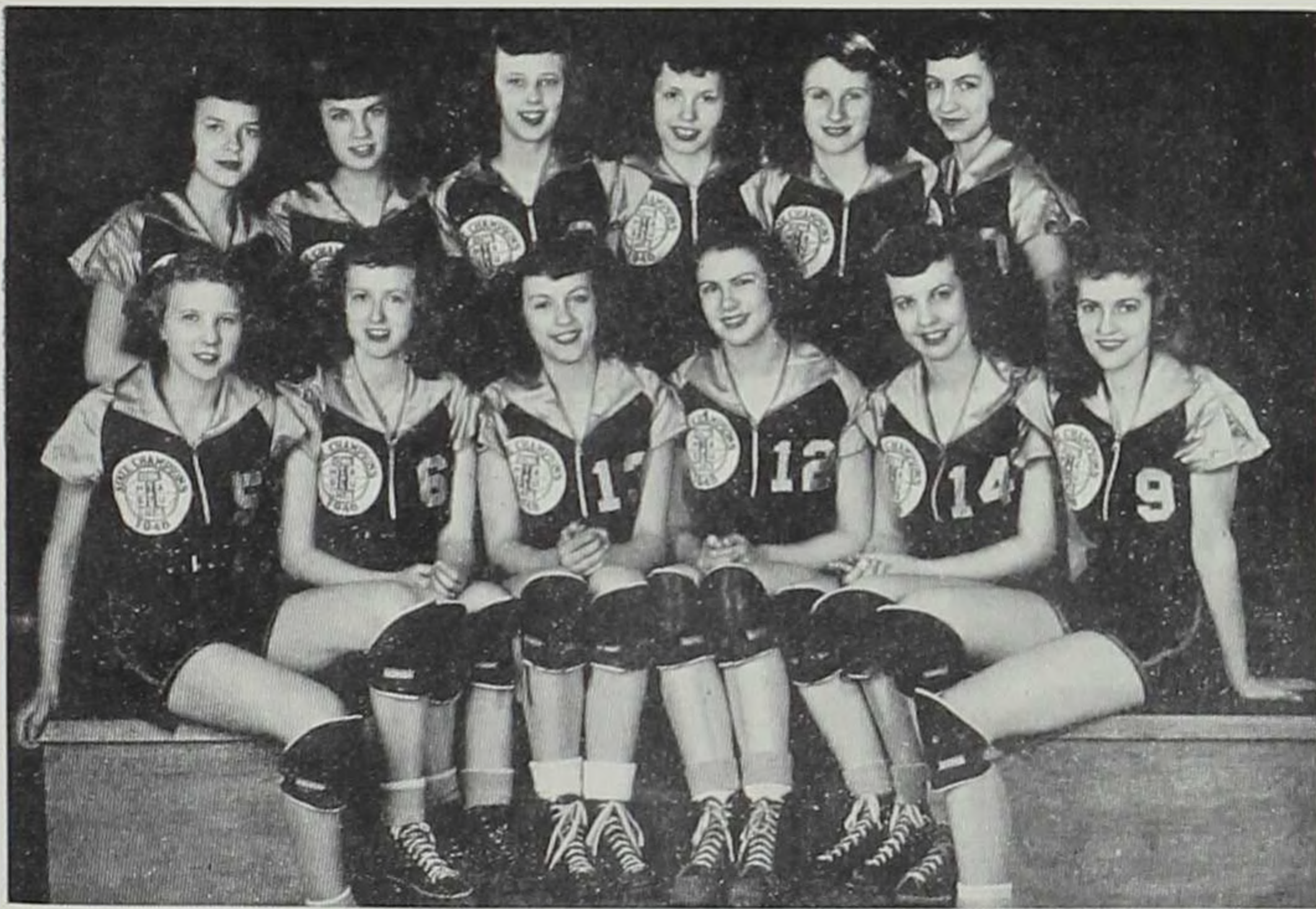
KAMRAR STATE CHAMPIONS OF 1948