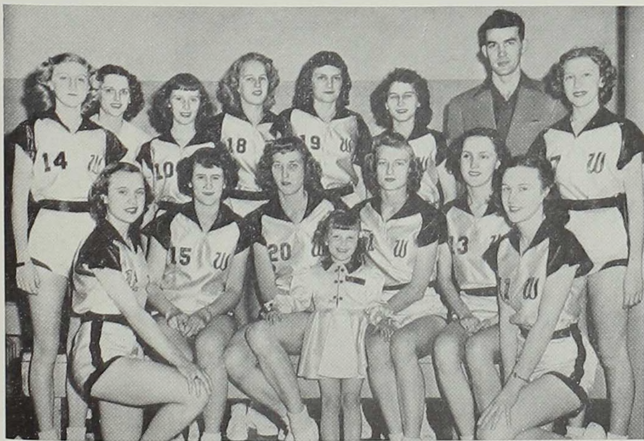
WELLSBURG STATE CHAMPIONS OF 1949