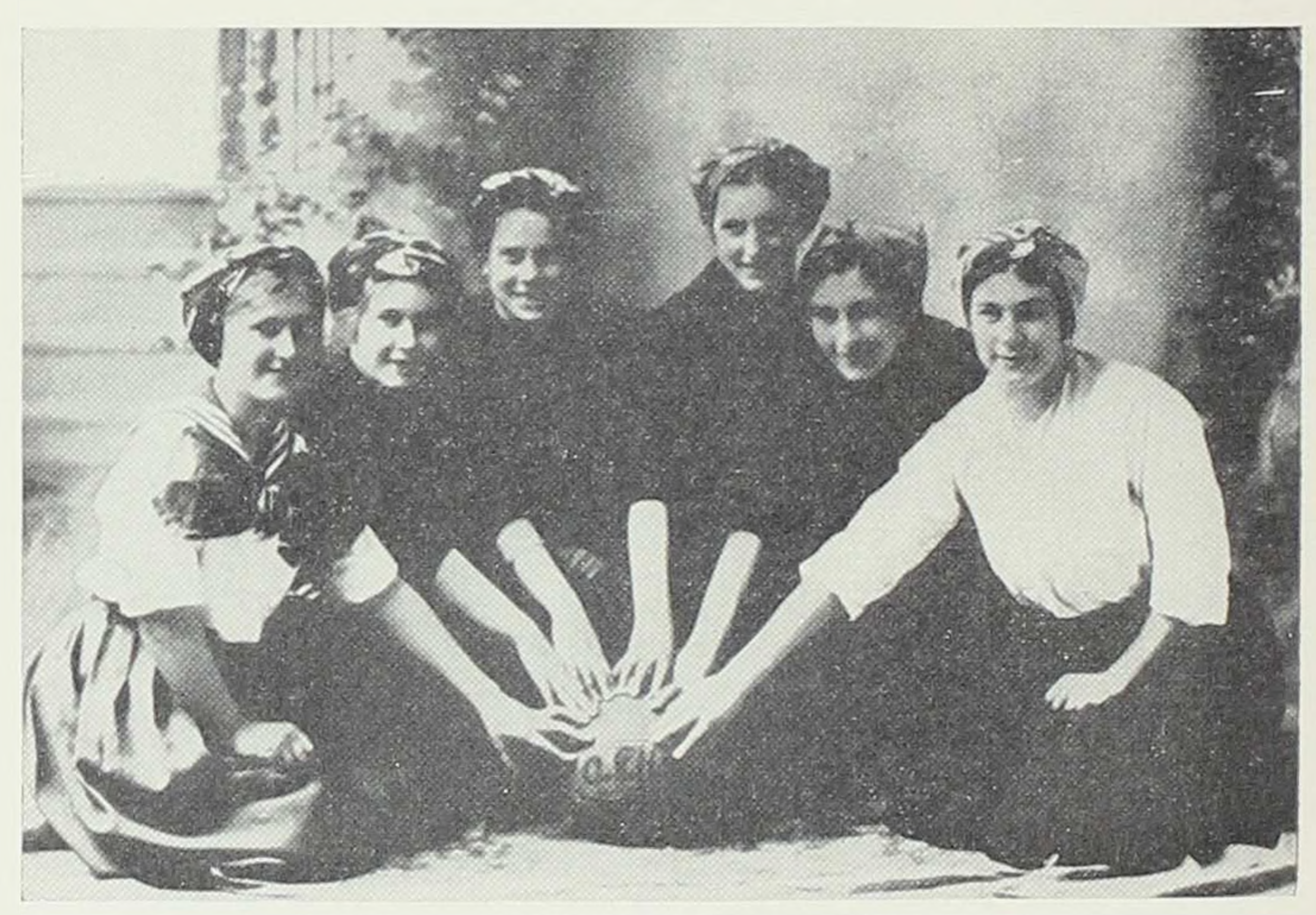
COON RAPIDS GIRLS' TEAM OF 1922