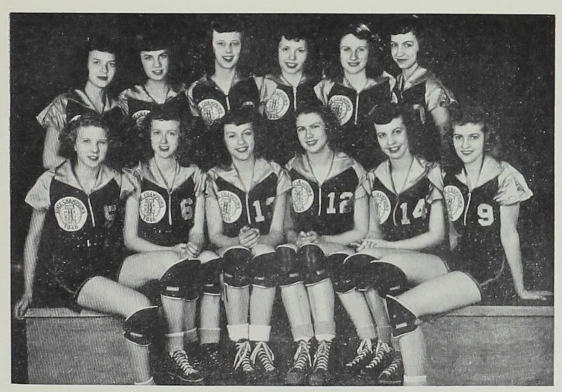
KAMRAR STATE CHAMPIONS OF 1948