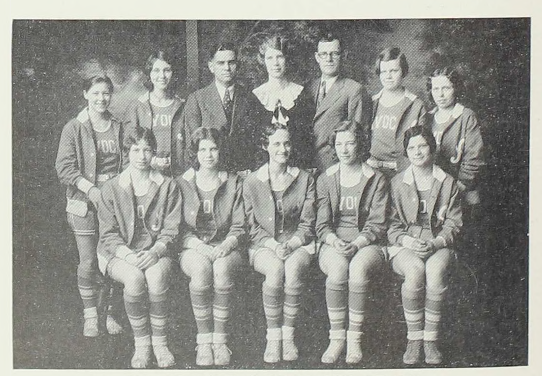
AVOCA STATE CHAMPIONS OF 1931