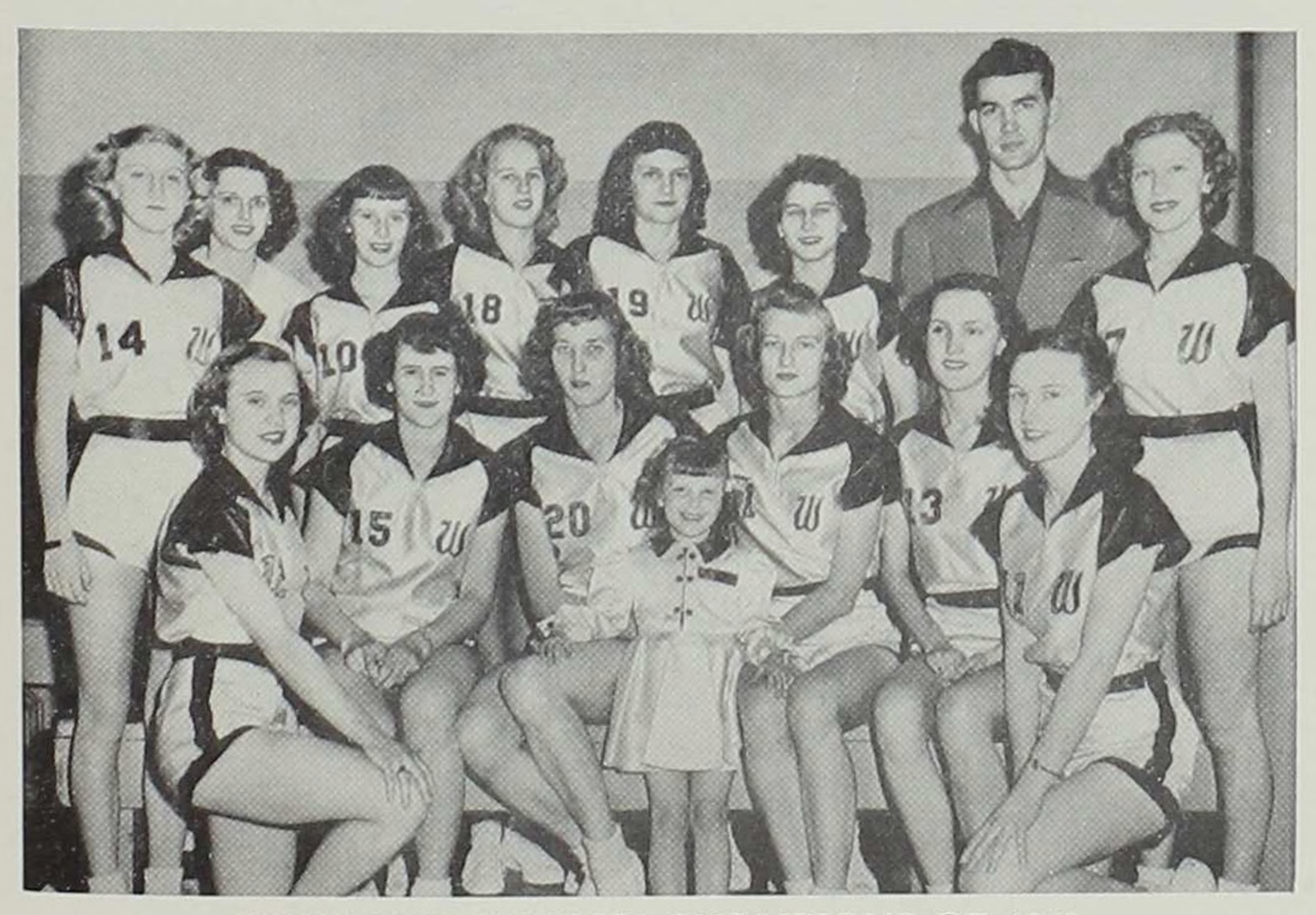
WELLSBURG STATE CHAMPIONS OF 1949