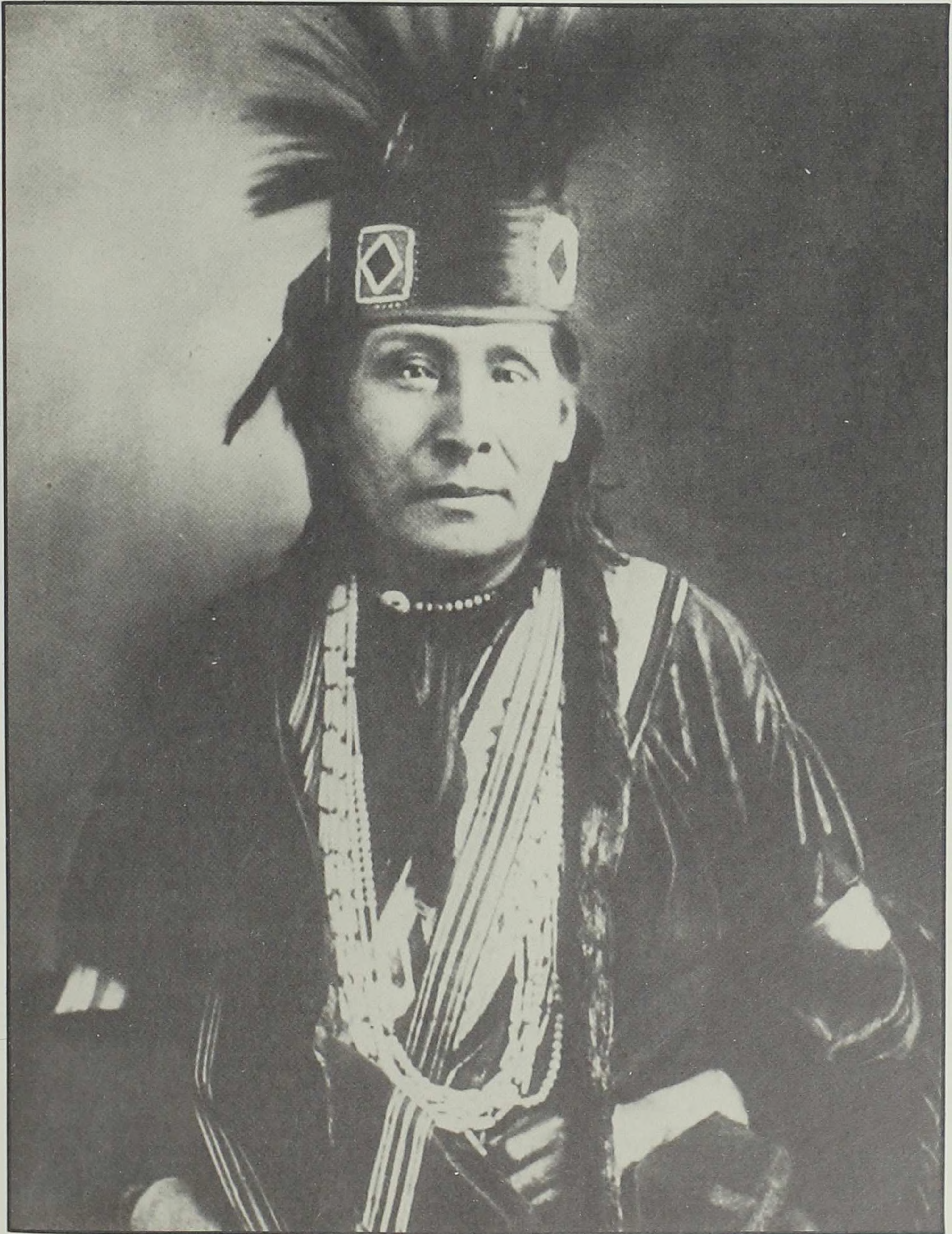
Ma-ka-ta-wa-kwa-twa (Black Cloud).