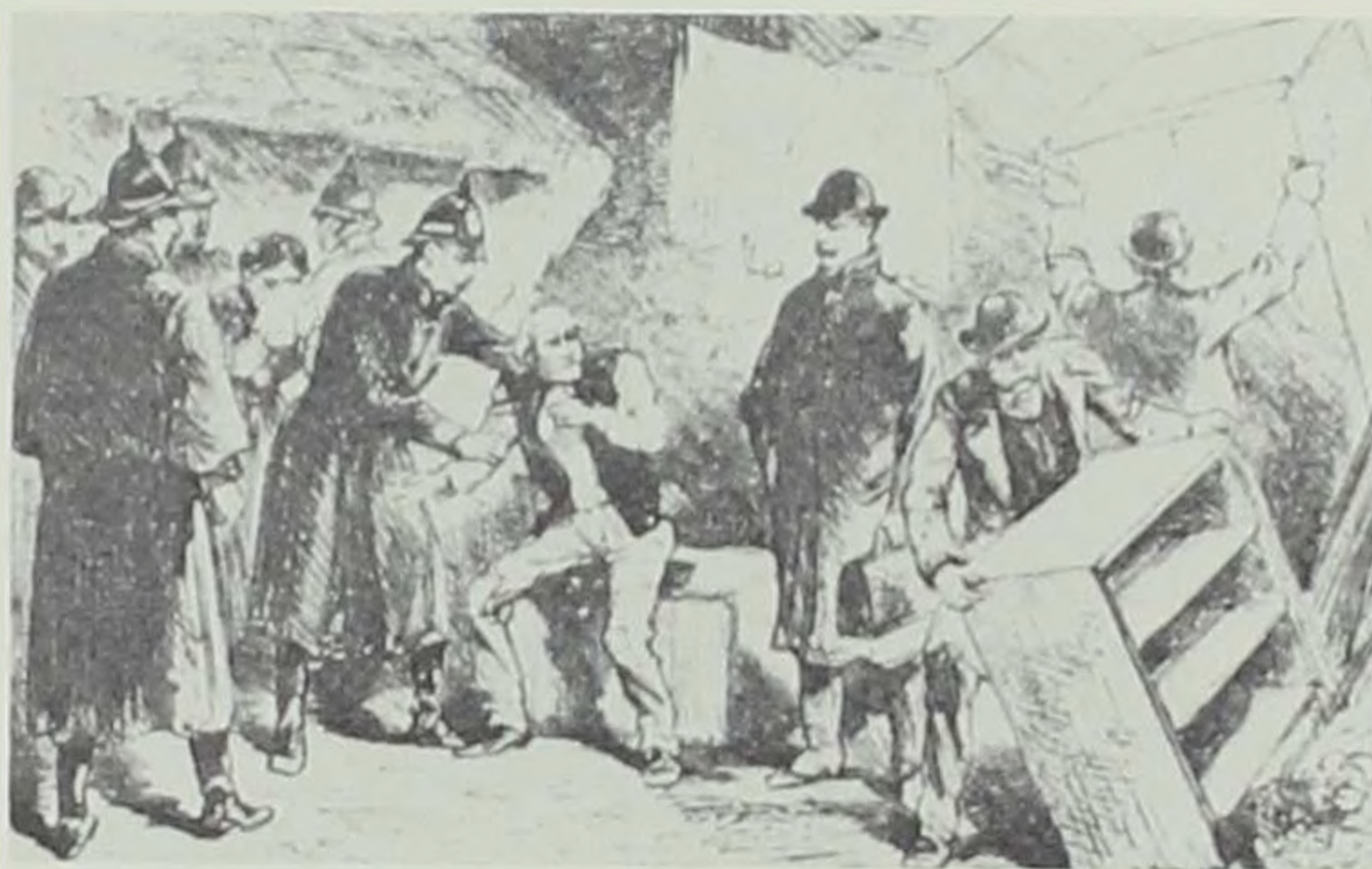
An eviction in County Kerry, from the Illustrated London News, January 29, 1887