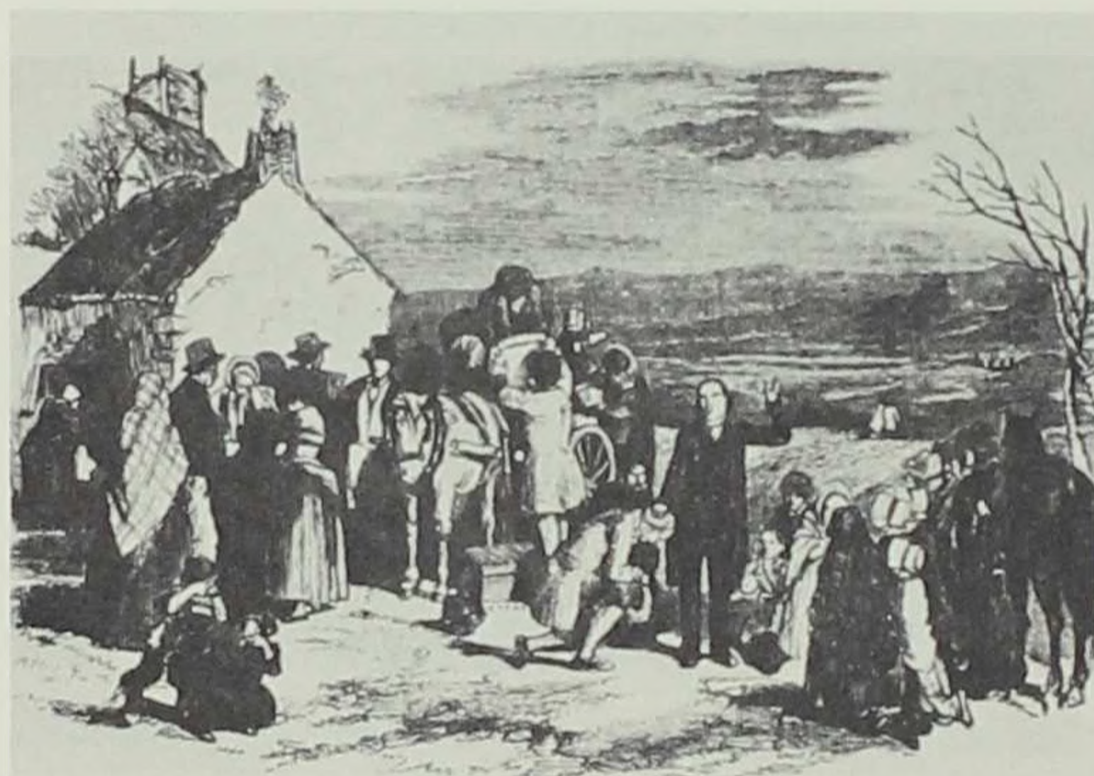
An Irish priest blesses parishioners bound for the New World, from the Illustrated London News, May 10, 1851