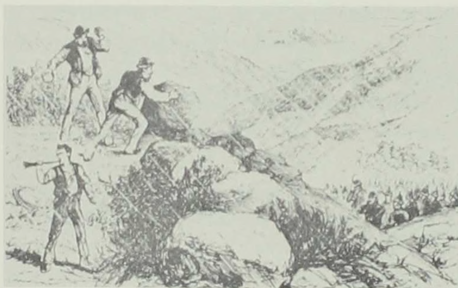
An Irish rent war, as depicted in the Illustrated London News, January 29, 1887

reported that the Canadian government, frightened by Fenian scares since January, had adopted tighter security measures along the border between the United States and Canada. As in the 1860s, the Canadians requested that the United States increase its vigilance along the border.