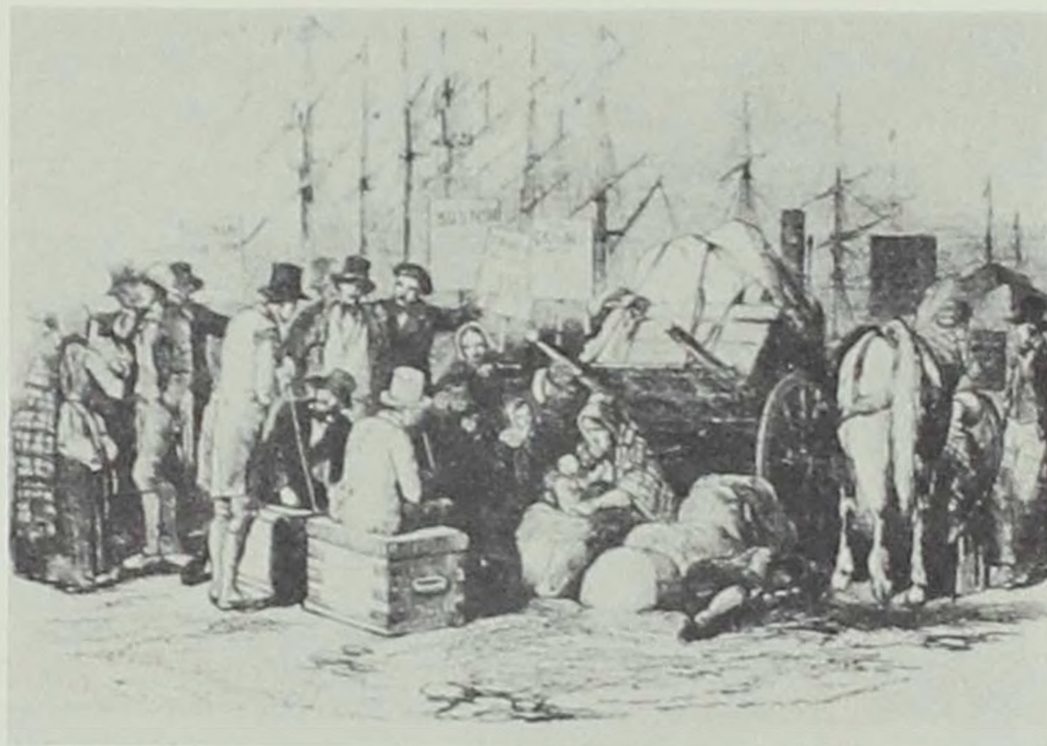
Emigrants about to set sail from Ireland to America, from the Illustrated London News, May 10, 1851