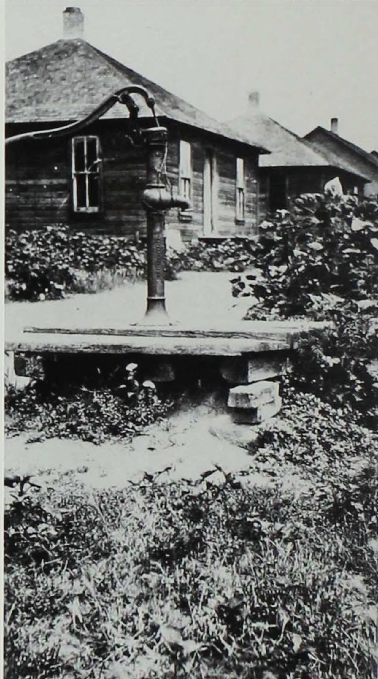
Miners' homes were four-room structures set on blocks, without electricity or plumbing. One well served many families. Miners' wives often took in boarders, to supplement husbands' and sons' seasonal wages.

But when I was around twelve years old I had a better understanding of the mine where he worked. One Sunday afternoon, the young men took the girls down into the mine and showed us how our fathers made a living for us. There was coal on all sides as we walked down a little narrow path. We saw wooden poles supporting the walls and ceiling. They took us to where our dad worked. With miners' picks in hand, they got down on their knees, as Dad