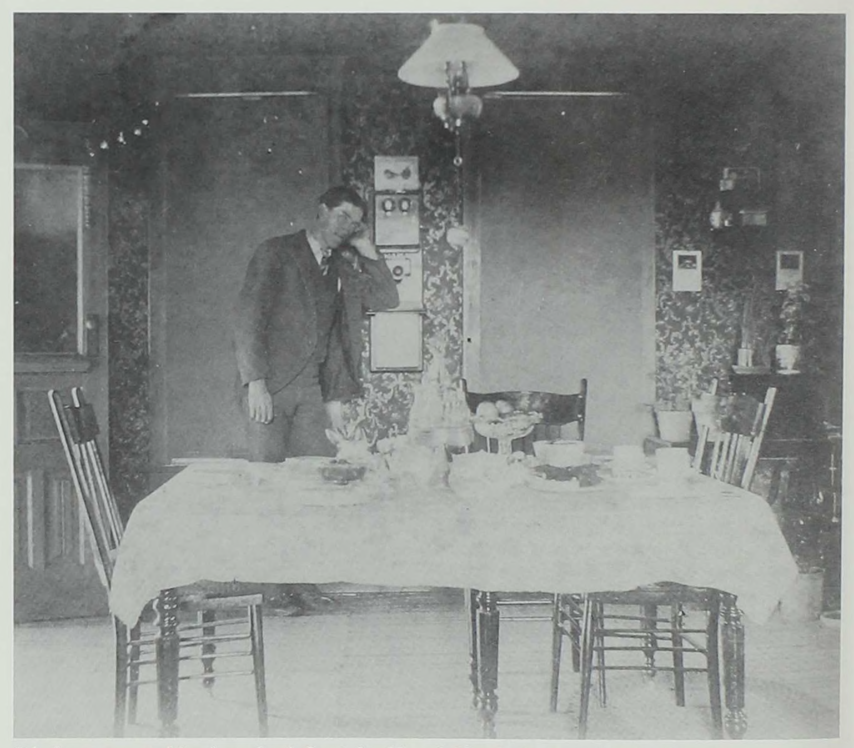
Telephones connected Iowa's rural and often isolated households to businesses and services in town.

usually responded favorably and hung up.