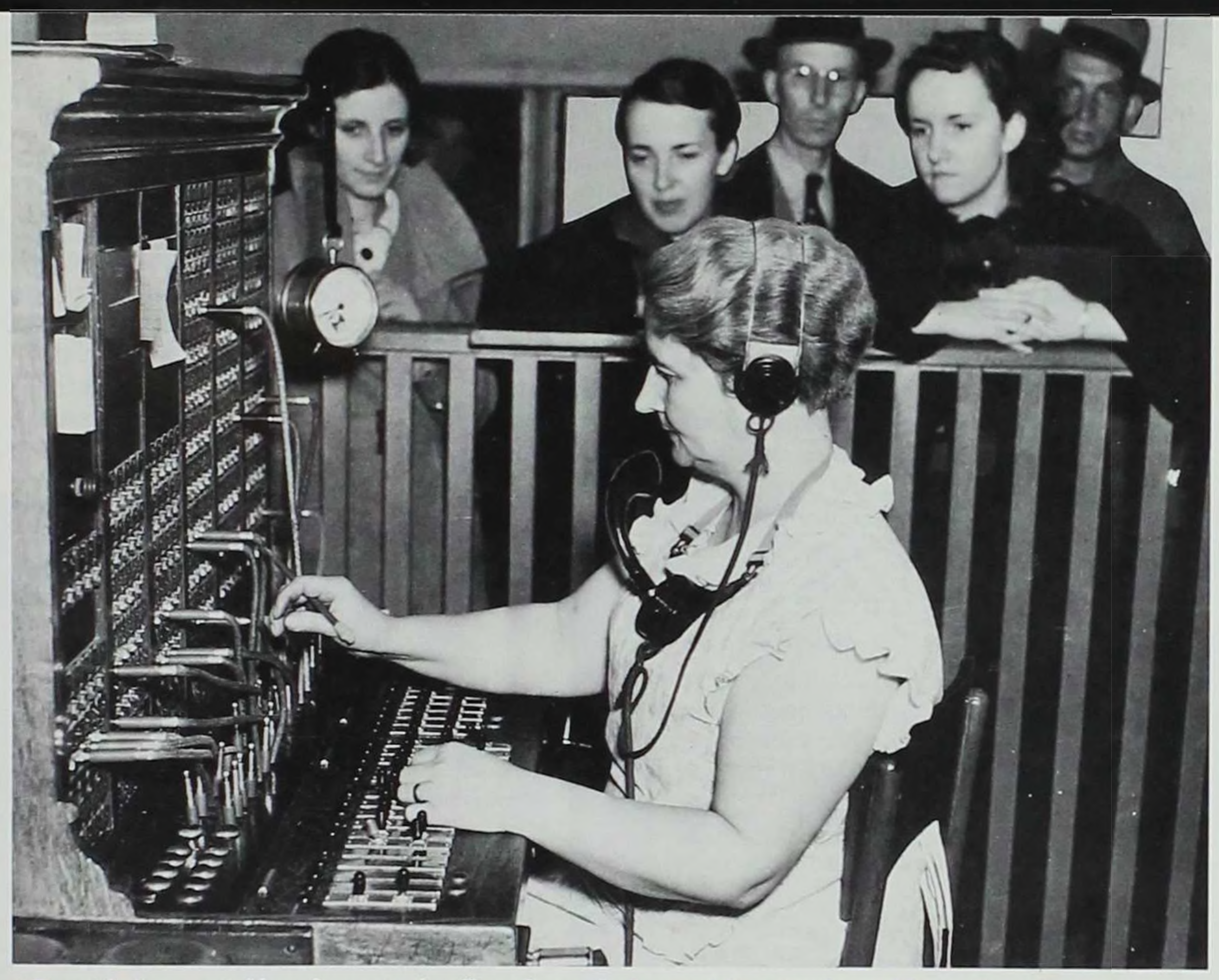
A Renwick, Iowa, switchboard operator handles calls as onlookers wait for news about a Mason City collision involving a bus and train. During emergencies, a local operator was a vital link in the community.

which usually lasted three to four weeks, operators had to undergo strict supervision once they officially started work at the switchboard. Mistakes were carefully recorded by a supervisor, who paced behind the operators, and a monitor, who could listen in on operators' lines undetected. This expectation of maintaining a constant level of perfection put extreme pressure on the operators, many of them young women ages sixteen to eighteen. A 1910 United States Senate investigation into the telephone industry declared switchboard operating "unsuitable" for the "nervous woman." Six years later, the Iowa Bureau of Labor Statistics report described operating as "a severely nervous strain occupation" because of the "strict surveillance and rigid adherence to rules laid down by the company, together with the impatience and fault-finding of unreasonable subscribers."