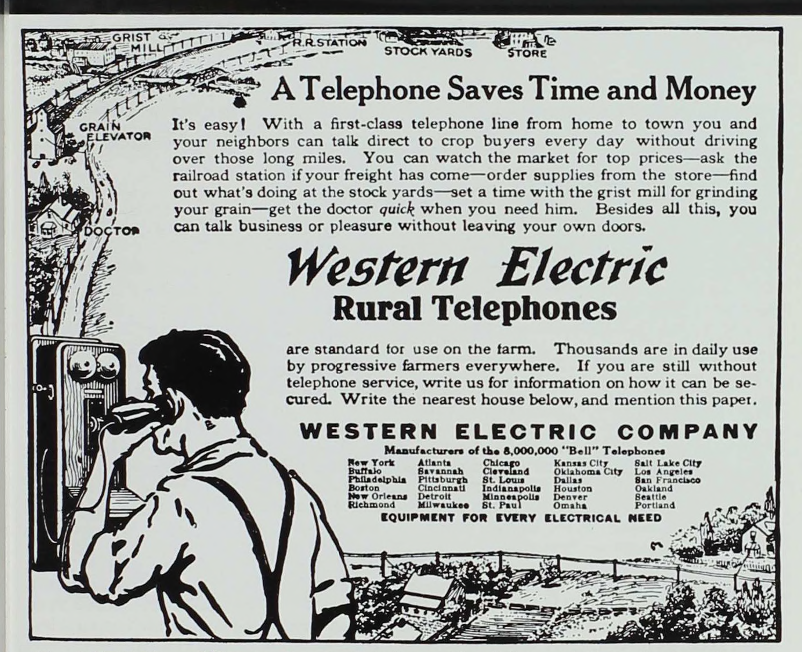
Although this 1914 Successful Farming ad promises that a farmer with a telephone can "talk direct" with crop buyers or "get the doctor quick," it fails to acknowledge the role of the local switchboard operator in connecting parties, handling emergencies, and sometimes even tracking down the town physician.

she was the one upon whom we all depended when an emergency arose."