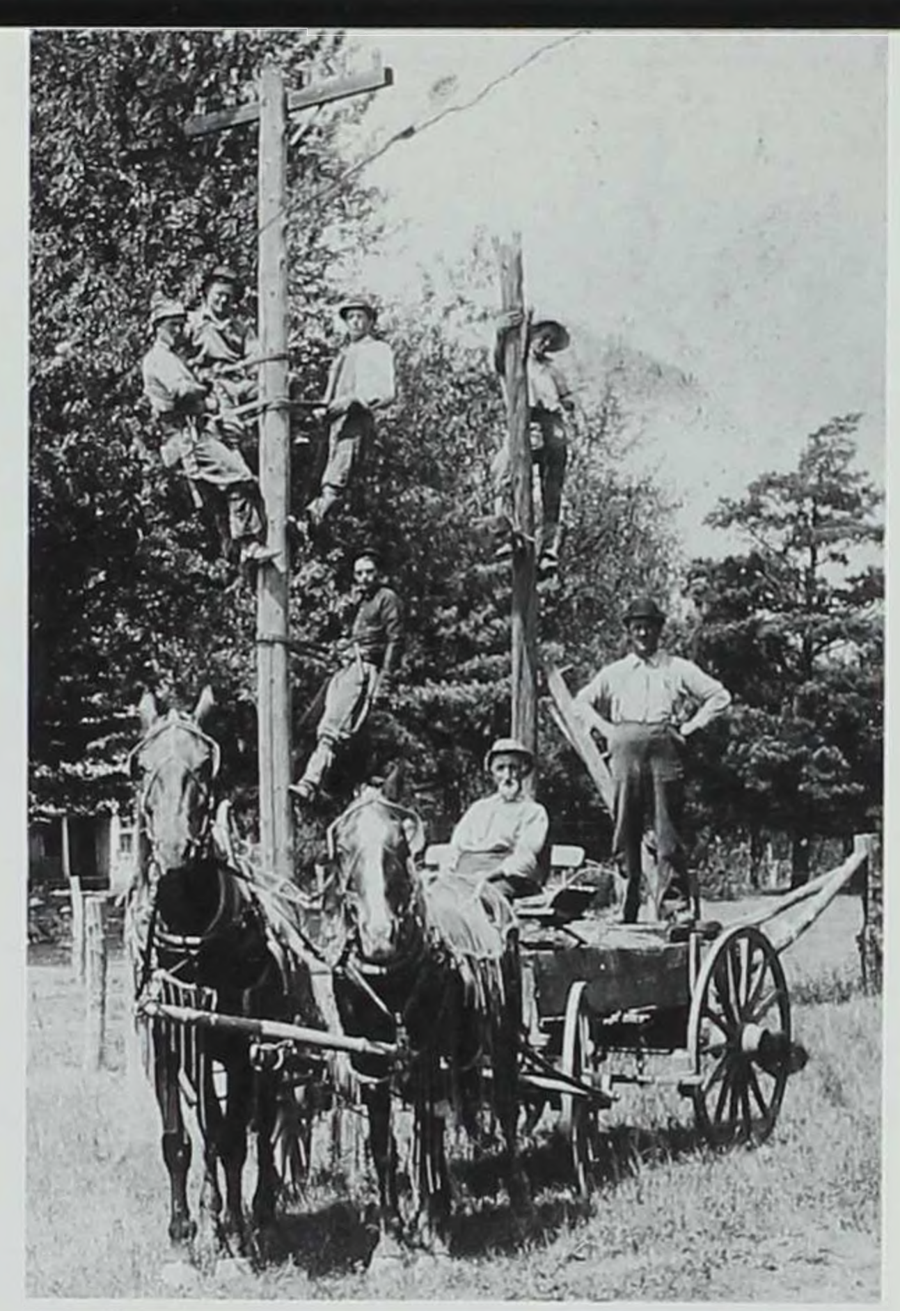
A Jackson County crew of troubleshooters checks telephone lines near Maquoketa. Rural lines were often fragile and needed frequent repair.

In the late nineteenth century, most switchboards were not set up in buildings designed specifically to be telephone exchanges. Rather, operators would be housed in the back rooms