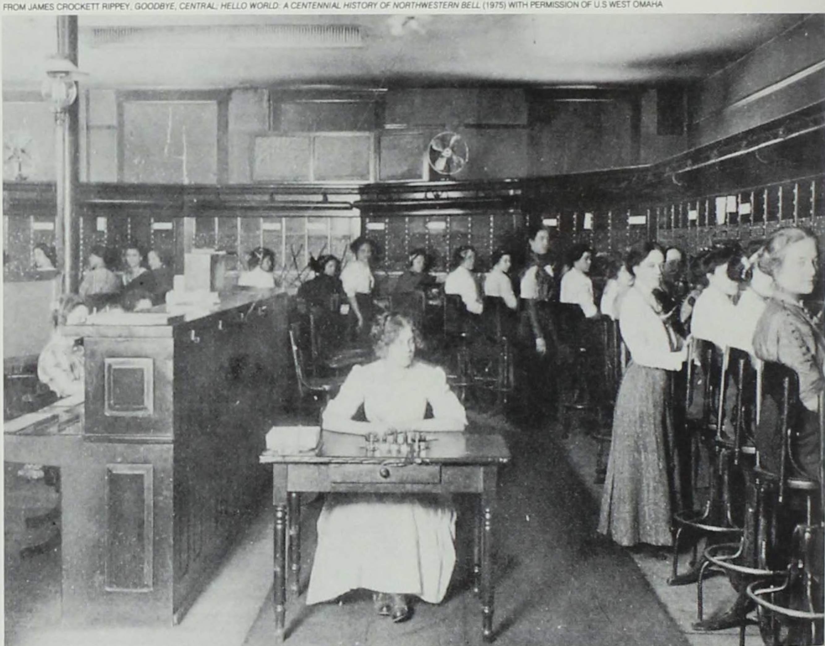
By 1902, when this photo in Davenport was taken, girls and young women predominated as switchboard operators. Boys had held these jobs in the early years, but the jobs soon fell to females, stereotyped as steady, courteous, and patient.

within Victorian society (or at least universal among the type of women who would be found suitable for the operator's job). In a centennial history of Northwestern Bell, a telephone official in Cleveland is cited as saying that "the service [of women] is very much superior to that of boys and men. They are steadier, do not drink beer and are always on hand."