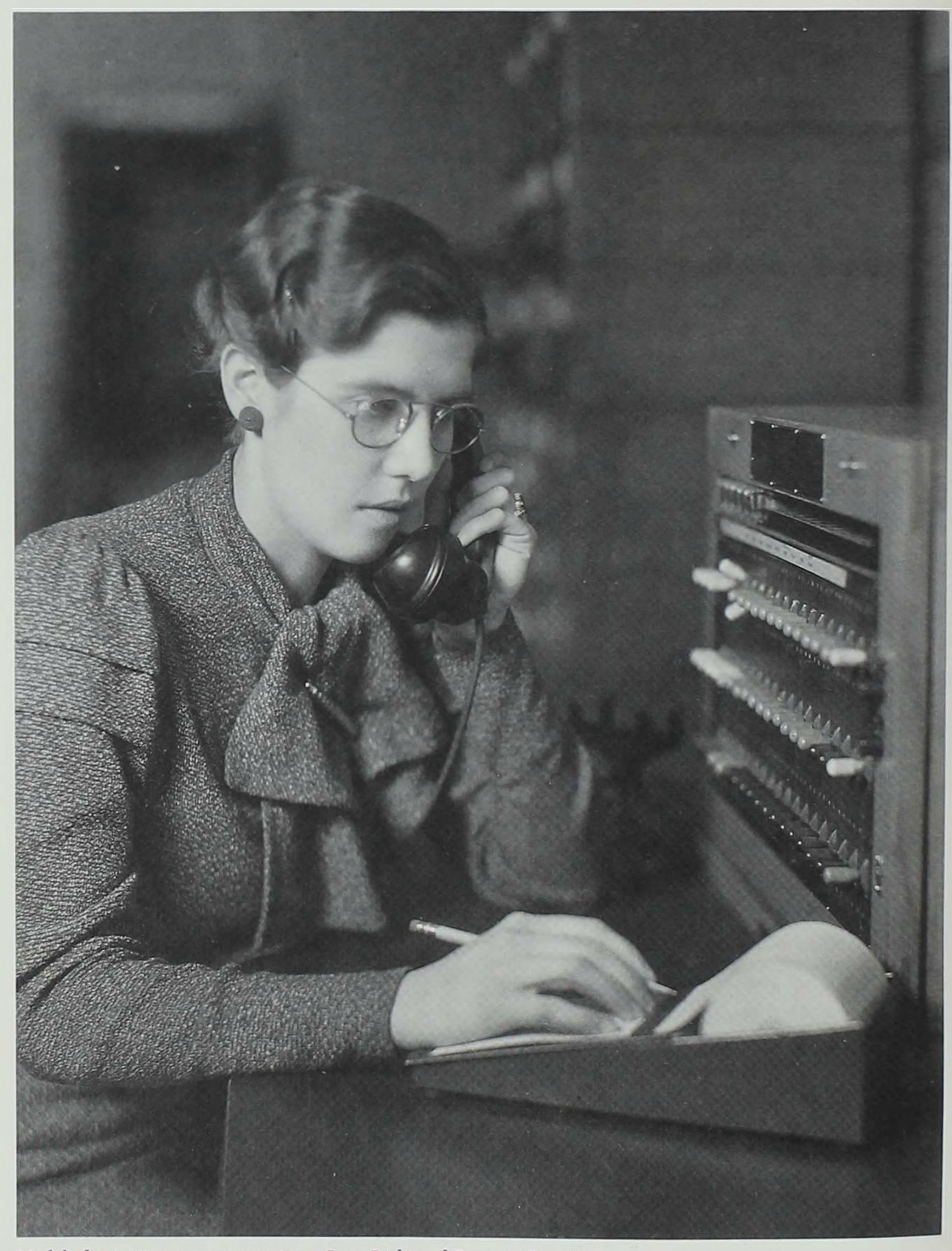
Model of attentiveness: an operator at Iowa Light and Power in Iowa City.