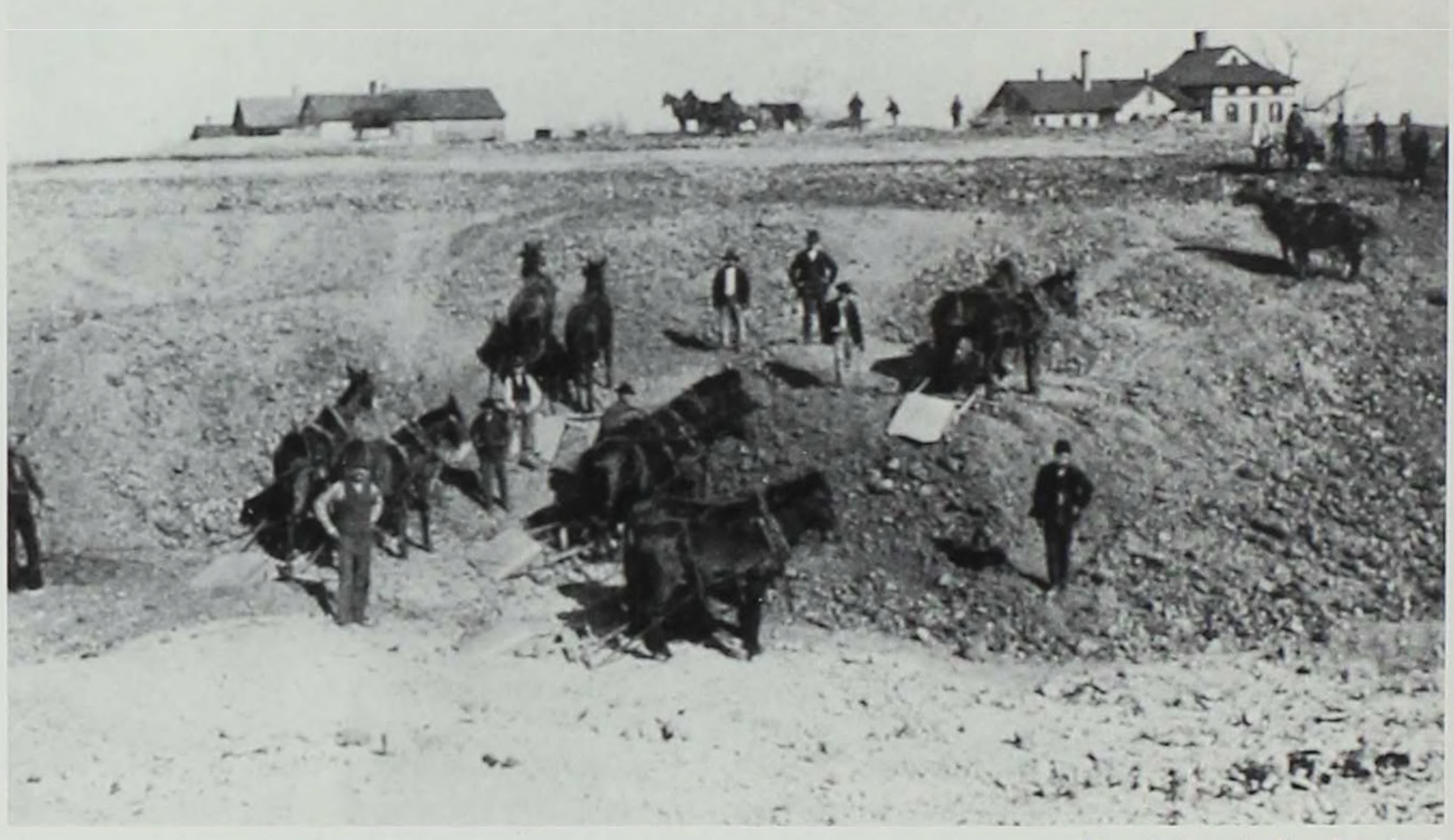
Construction began in July 1901 for Fort Des Moines, after a citizens committee raised funds, bought four hundred acres, and turned the land over to the federal government.

cavalry at the post short of 1903. When completed Des Moines will have the model cavalry post of the army."