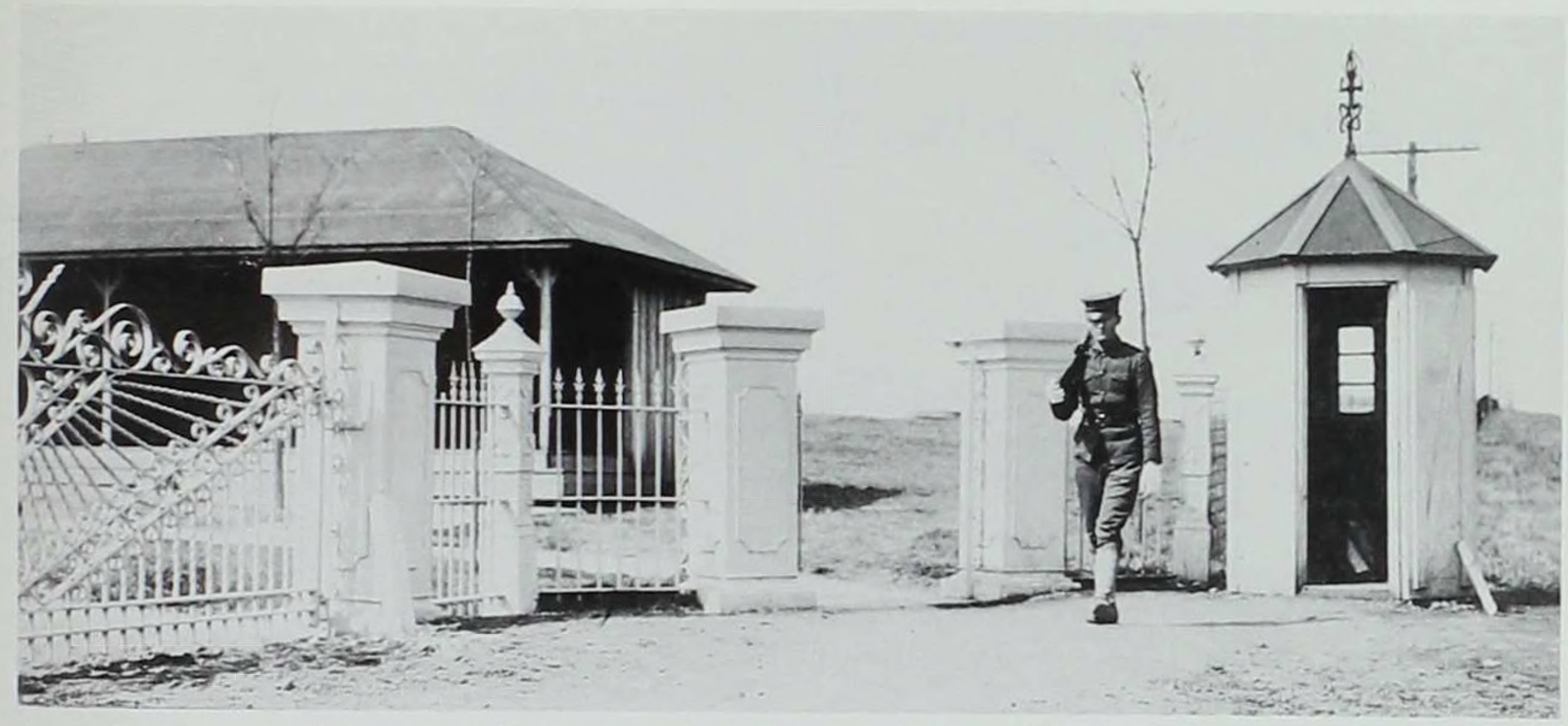
A guard paces across the entrance of Fort Des Moines, 1908. Few images of the fort in 1903 exist.

comparison, the white-oriented Register and Leader and Evening Tribune were characteristic of most newspapers in this period, in that their news coverage of African-Americans was sparse and often negative. Yet in fairness, these two papers occasionally lauded blacks, questioned prejudice, and often lambasted racism in the American South.