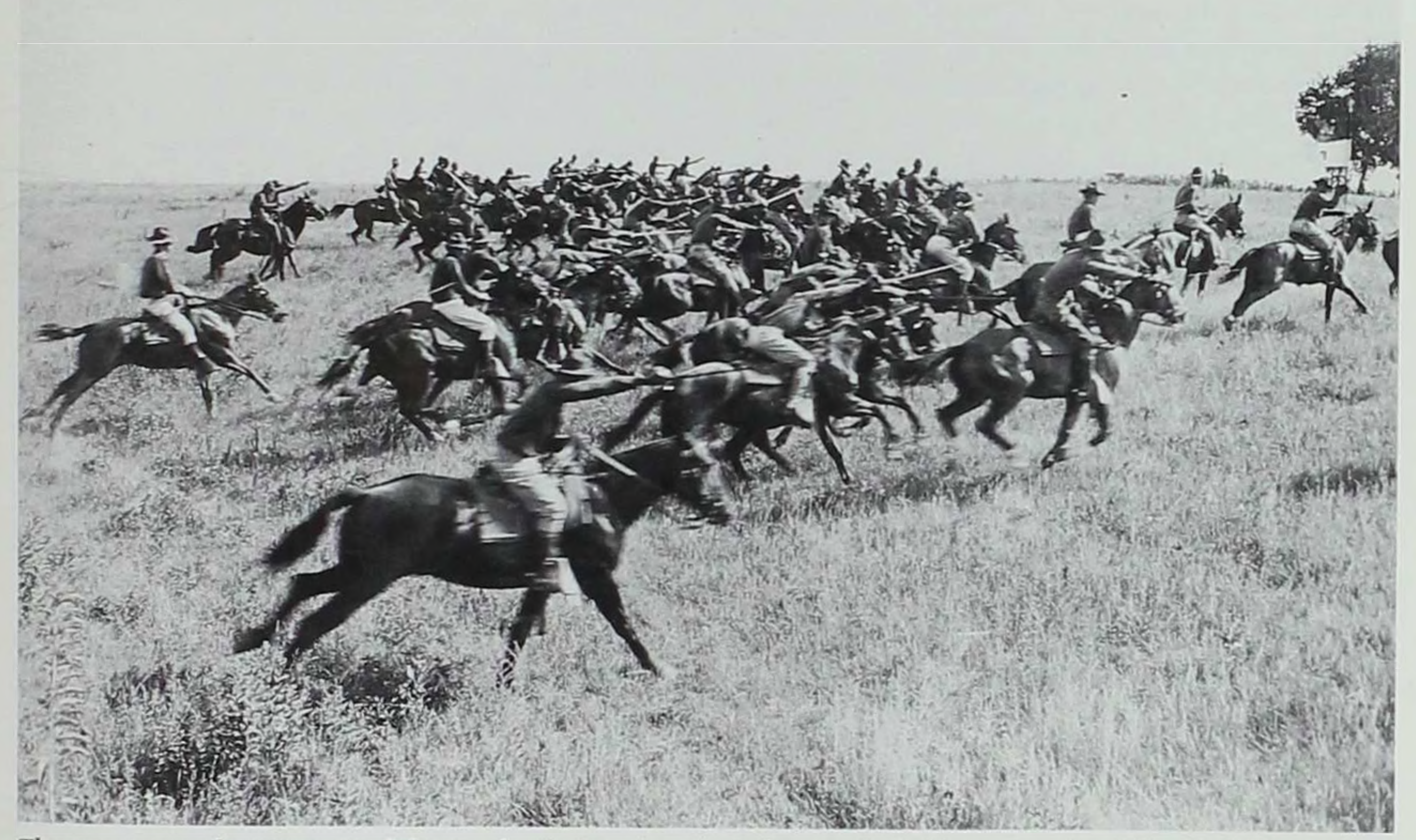
The romance and excitement of the cavalry in Americans' minds were fueled by memories of the Civil War and the Indian Wars. Here, a practice charge by the Fourteenth Cavalry at Fort Des Moines (ca. 1930).

tion. The first fort of regular soldiers within the confines of Iowa is to be dedicated and opened this week. Heretofore, Iowans have been forced to go to St. Louis, Omaha, Chicago, or St. Paul to see regular soldiers and regular army encampments and forts."