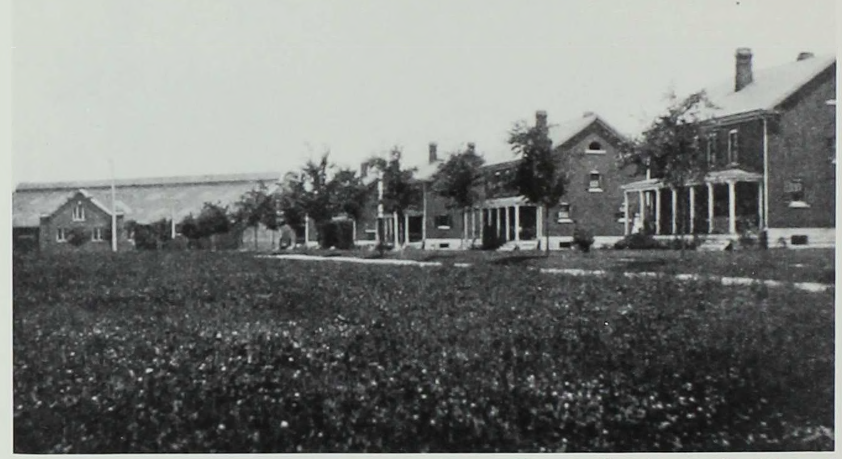
"No frowning, grim looking fort is this, but a place to delight the eye and the spirit of him who approaches." Photo and quotation from May 1908 The Midwestern, a Des Moines booster magazine.

little while until they got back in touch with humanity."