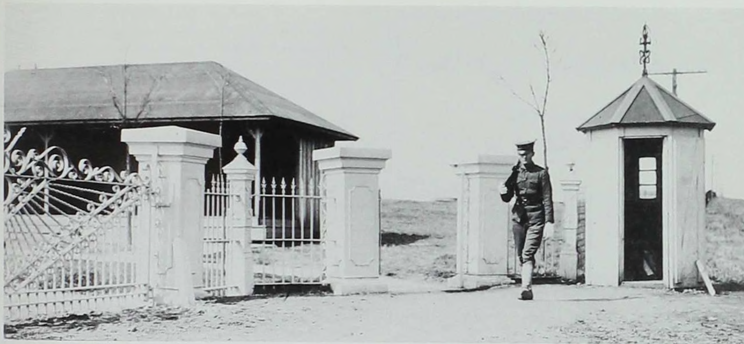
A guard paces across the entrance of Fort Des Moines, 1908. Few images of the fort in 1903 exist.

comparison, the white-oriented Register and Leader and Evening Tribune were characteristic of most newspapers in this period, in that their news coverage of African-Americans was sparse and often negative. Yet in fairness, these two papers occasionally lauded blacks, questioned prejudice, and often lambasted racism in the American South.