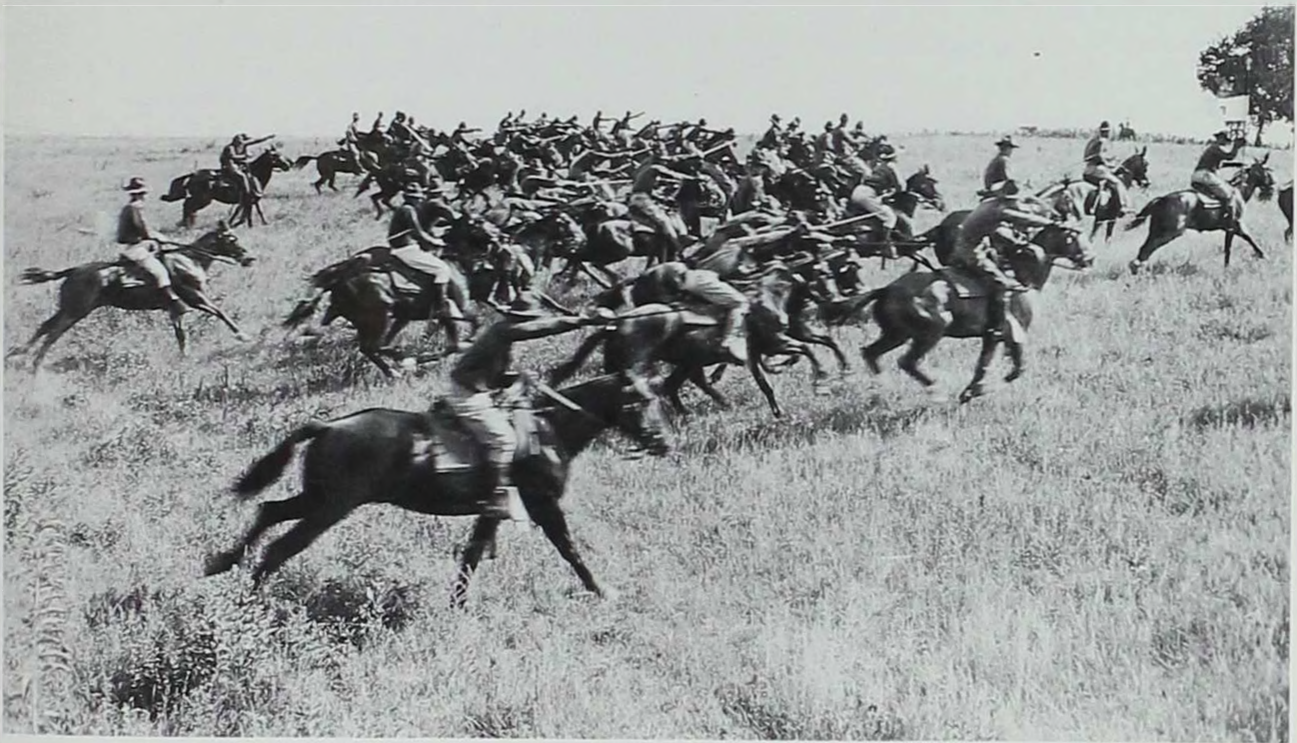
The romance and excitement of the cavalry in Americans' minds were fueled by memories of the Civil War and the Indian Wars. Here, a practice charge by the Fourteenth Cavalry at Fort Des Moines (ca. 1930).

tion. The first fort of regular soldiers within the confines of Iowa is to be dedicated and opened this week. Heretofore, Iowans have been forced to go to St. Louis, Omaha, Chicago, or St. Paul to see regular soldiers and regular army encampments and forts."