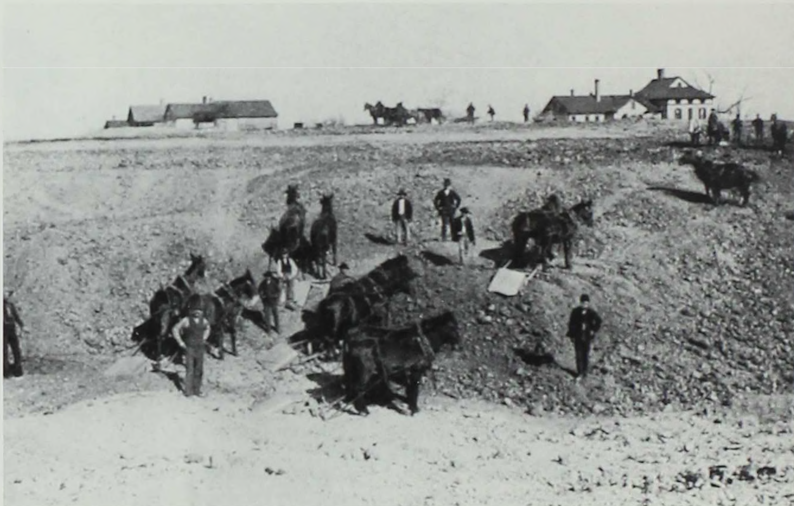
Construction began in July 1901 for Fort Des Moines, after a citizens committee raised funds, bought four hundred acres, and turned the land over to the federal government.

cavalry at the post short of 1903. When completed Des Moines will have the model cavalry post of the army.”