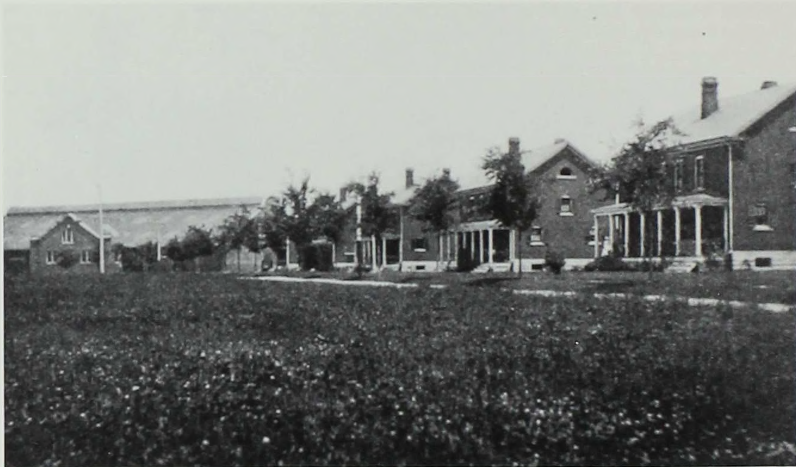
"No frowning, grim looking fort is this, but a place to delight the eye and the spirit of him who approaches." Photo and quotation from May 1908 The Midwestern , a Des Moines booster magazine.

little while until they got back in touch with humanity."