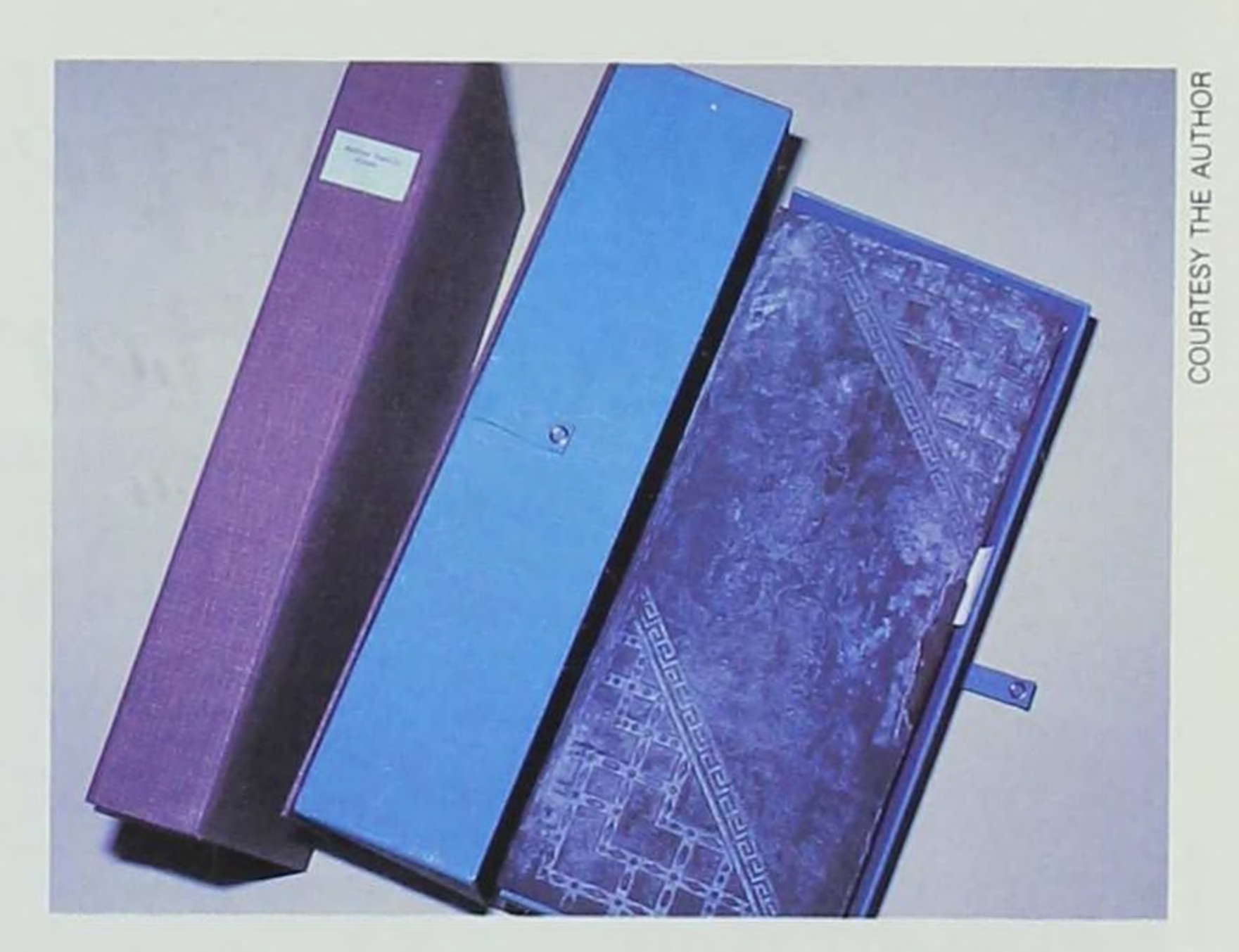
Custom-fit boxes of archival materials will safely house fragile albums. Store them in a cool, dry environment.

Two sources for archival supplies: Light Impressions (439 Monroe Avenue, Rochester, NY 14607) and Hollinger Corporation (PO Box 6185, Arlington, VA 22206).