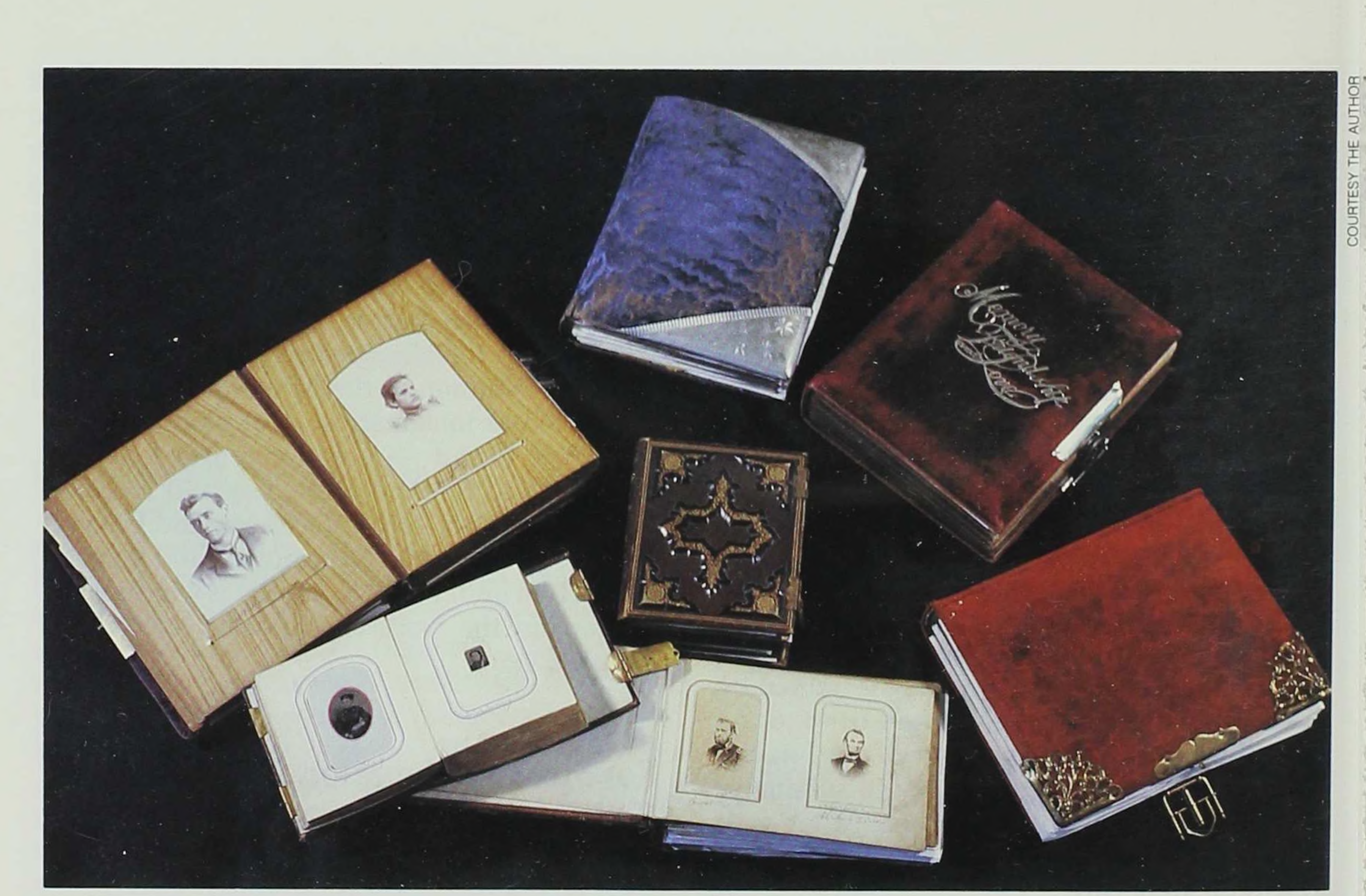
Plush portrait albums, with leather or velvet covers, were common in the Victorian parlor. Now they need proper care and storage to survive the effects of adhesives, acidic paper, and photographic chemicals. Note the following tips.