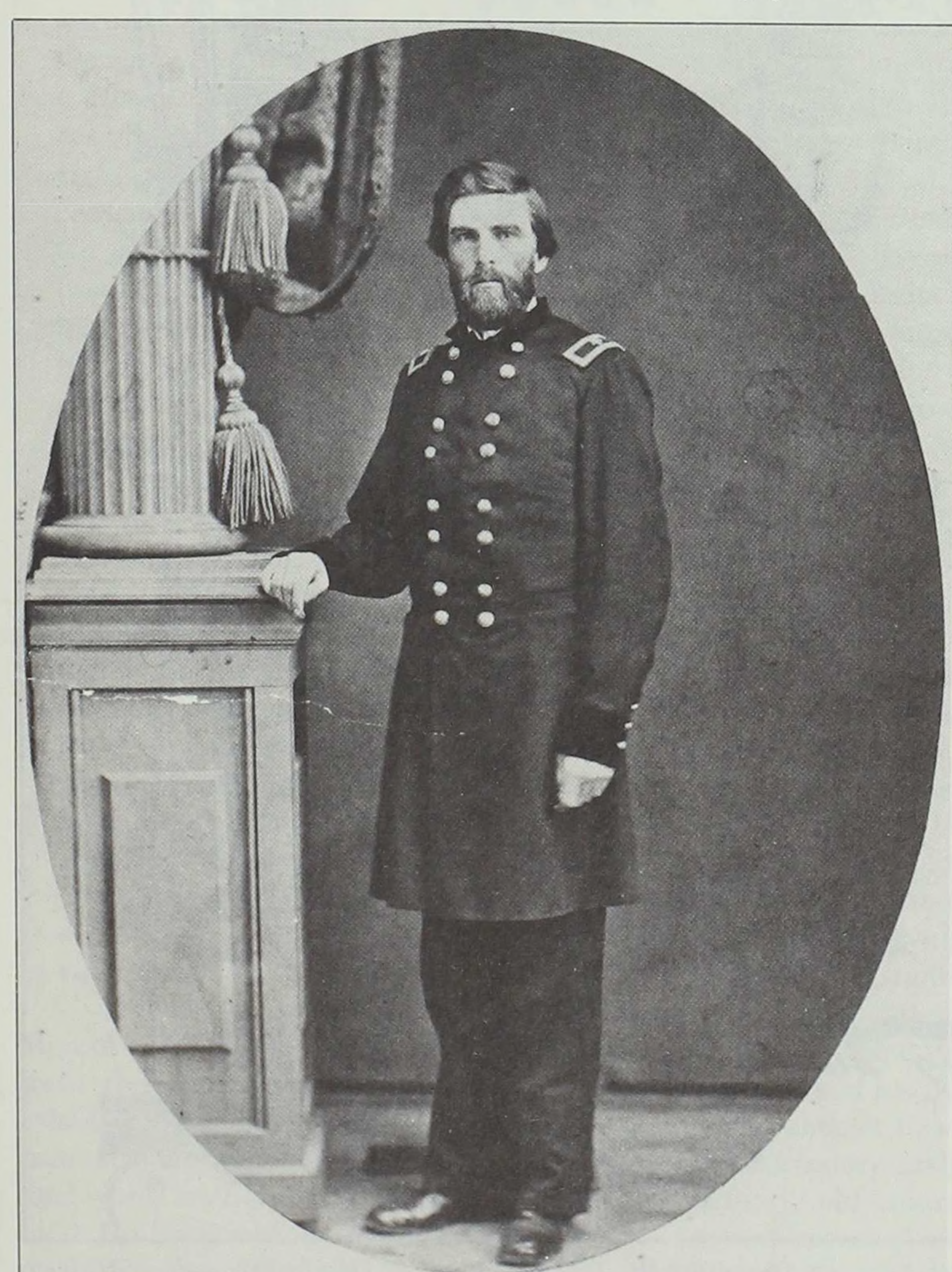
Grenville M. Dodge, Kinsman's friend and commanding officer for a time during the war, c. 1865.

The order came, and at a signal, like a cloud bursting from a clear sky, a solid line of brave boys in blue mounted the river bank without firing a gun, and flying as upon the wings of the wind across those cotton rows into the jaws of death—into the very rain of fire, of shot and shell, up against a solid line of brave men in gray, with a torrent of musketry thick as hail-stones tearing their ranks upon the left flank, with men falling like leaves in