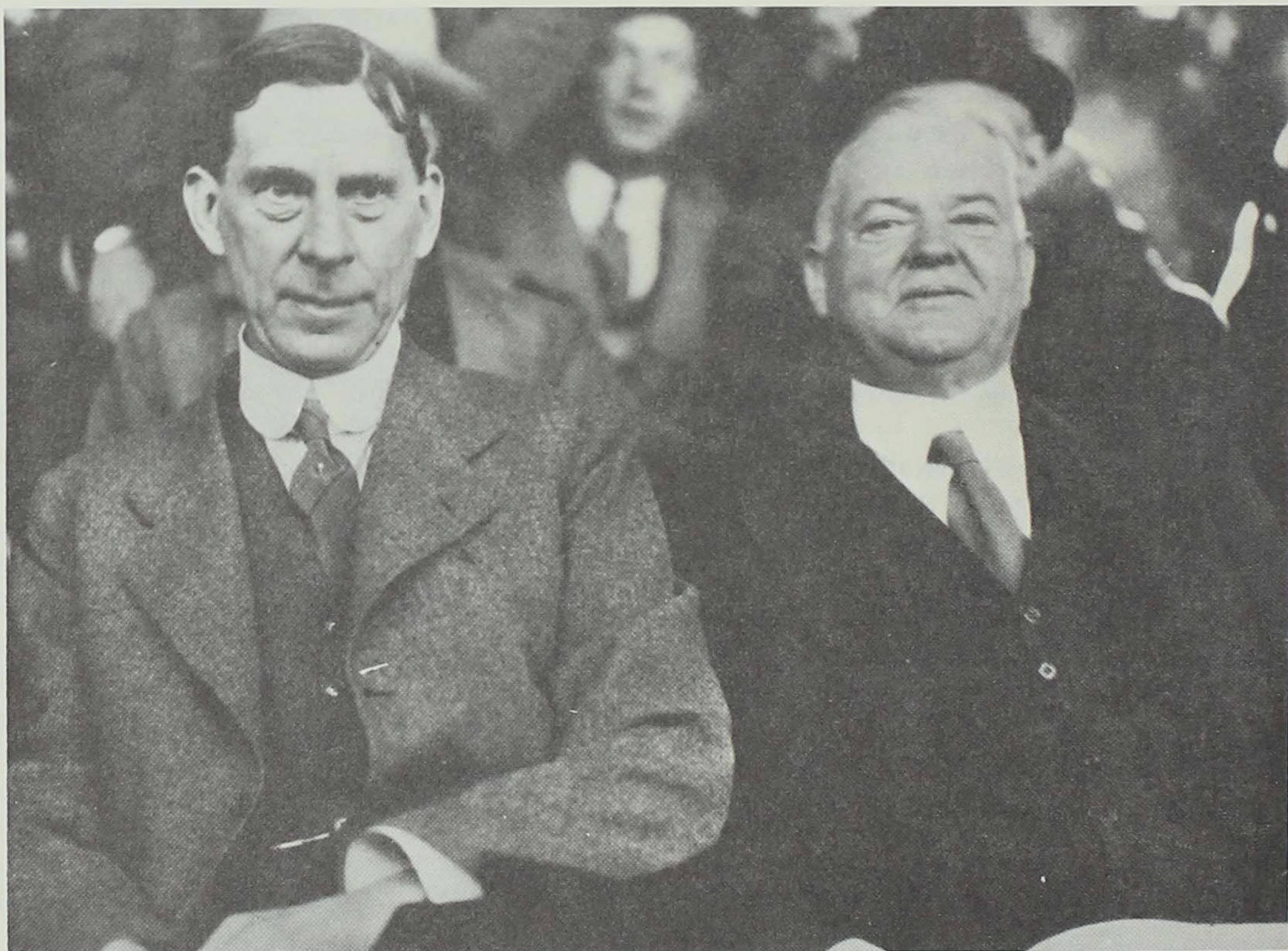
Ray Lyman Wilbur, president of Stanford University, and Herbert Hoover at a Yale-Penn game at Franklin Field on 12 October 1935.

was still lodged in the Interior Department where it had been located since its creation in 1869. He allowed it to continue the gathering and disseminating of information about the nation's schools, but he opposed all suggestions for a cabinet-level education department or, indeed, any expansion of the federal role in education.