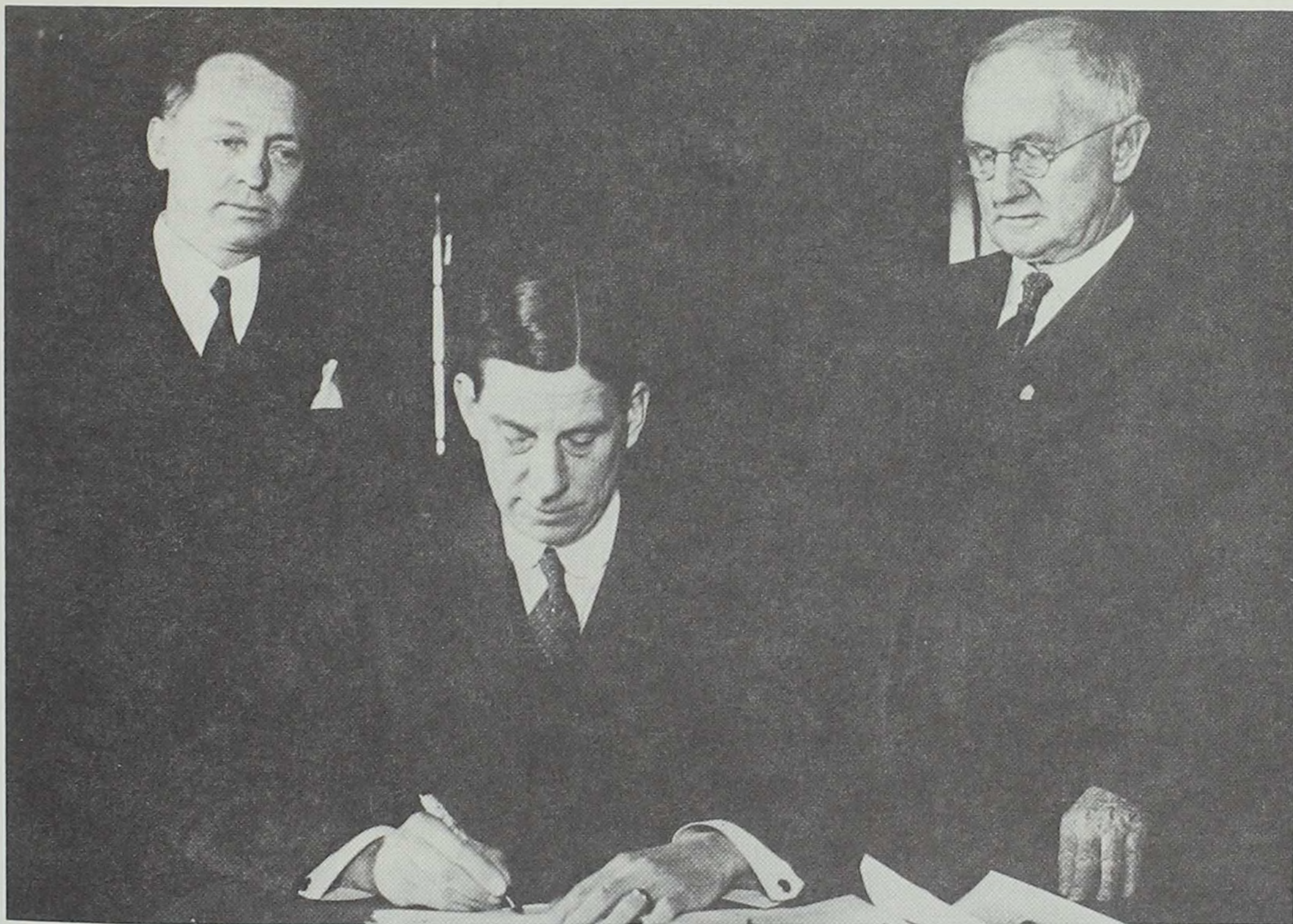
Congressman Philip D. Swing of California (left) and Commissioner of Reclamation Elwood Mead (right) watch as Secretary of the Interior Ray Lyman Wilbur signs the contract for the construction of Hoover Dam on 11 March 1931.

were deeply imbued with the value of hard work, family, and the civilizing influence of church and school. Each man worked his way through college. Both were Republicans who put their faith in self-reliance and the private sector. Each was a public servant who was happier at home than in Washington, D.C. Both excelled at reorganizing governmental departments, reducing paperwork, and expediting decision making. Each was suspicious of the federal government's possession of too much land and too much power.