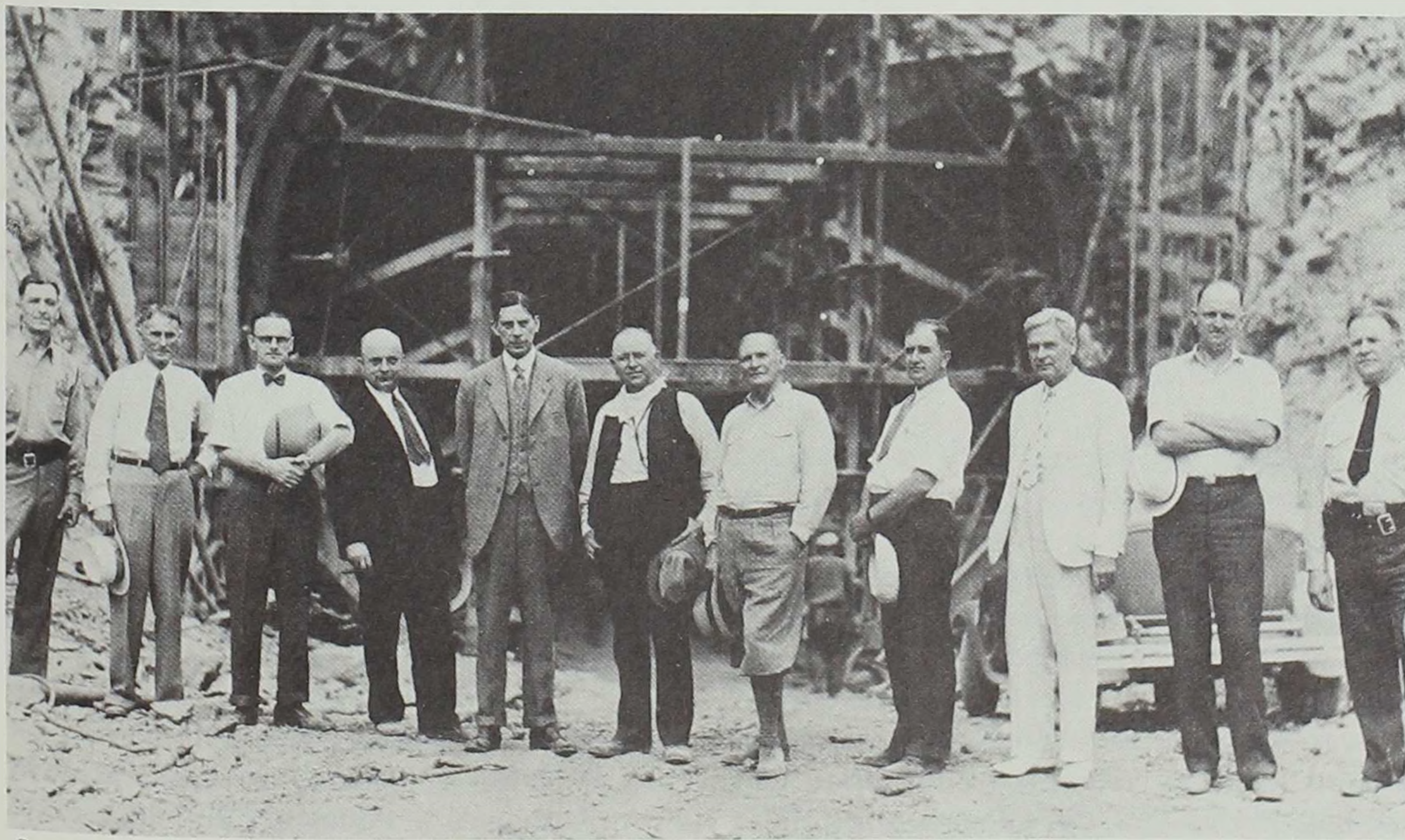
Secretary of the Interior Ray Lyman Wilbur with other Hoover Dam Project officials in front of a partially completed bypass tunnel on 22 September 1932.

But Wilbur was basically opposed to centralization as he made clear on a number of issues. In his day the Bureau of Education