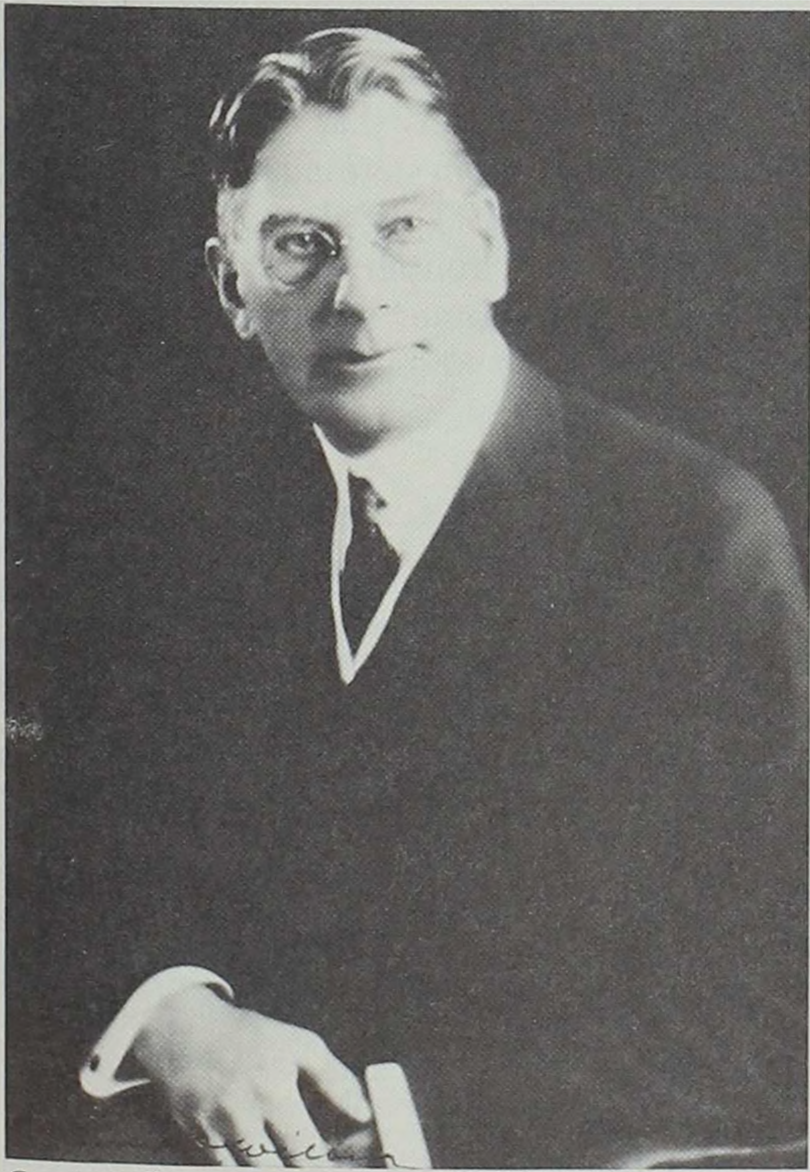
Curtis Wilbur.

As a student of environmental policy, I have naturally focused on Boonesboro's two secretaries of the interior. But the town produced a third cabinet member as well. Until 1947, the secretary of the navy was a cabinet-level post, and it was held from 1924 to 1929 by Ray Lyman Wilbur's brother, Curtis. Eldest of the six Wilbur children, Curtis was born in 1867, eight years before Ray, and was a high school student when the family left Boonesboro. He graduated from the United States Naval Academy in 1888 but did not enter the service. This was accepted practice at the time, since the number of academy graduates exceeded the number of available commissions. He then moved to Riverside,