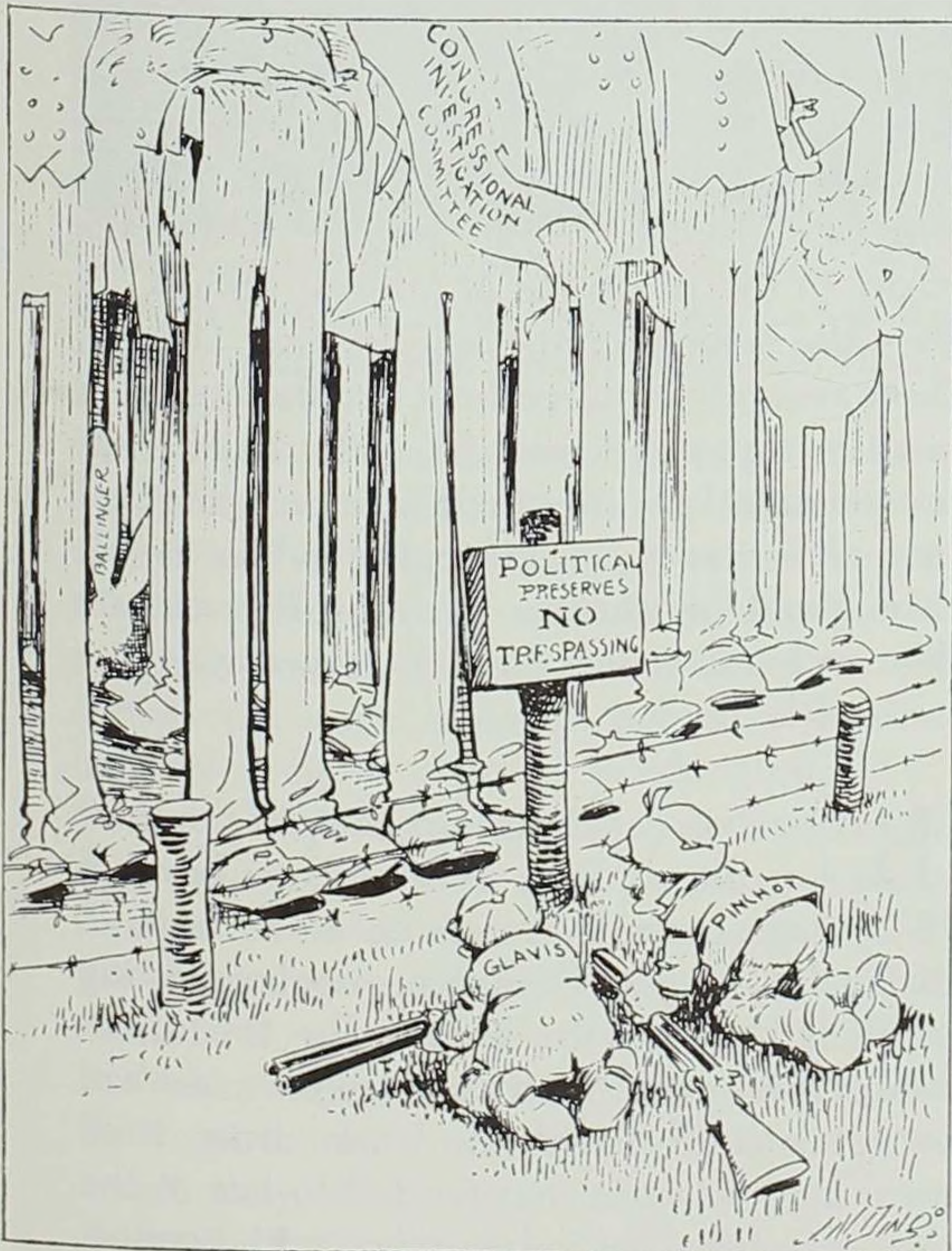
HUNTING UNDER DIFFICULTIES