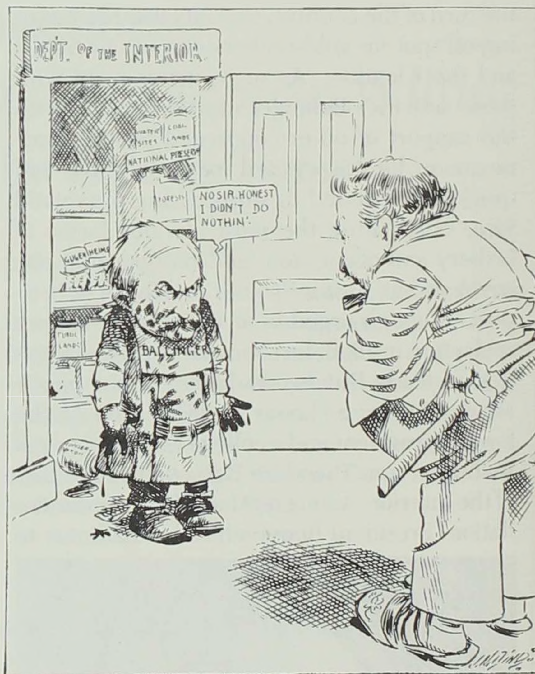
SPARE THE ROD AND SPOIL THE CONSERVATION POLICY