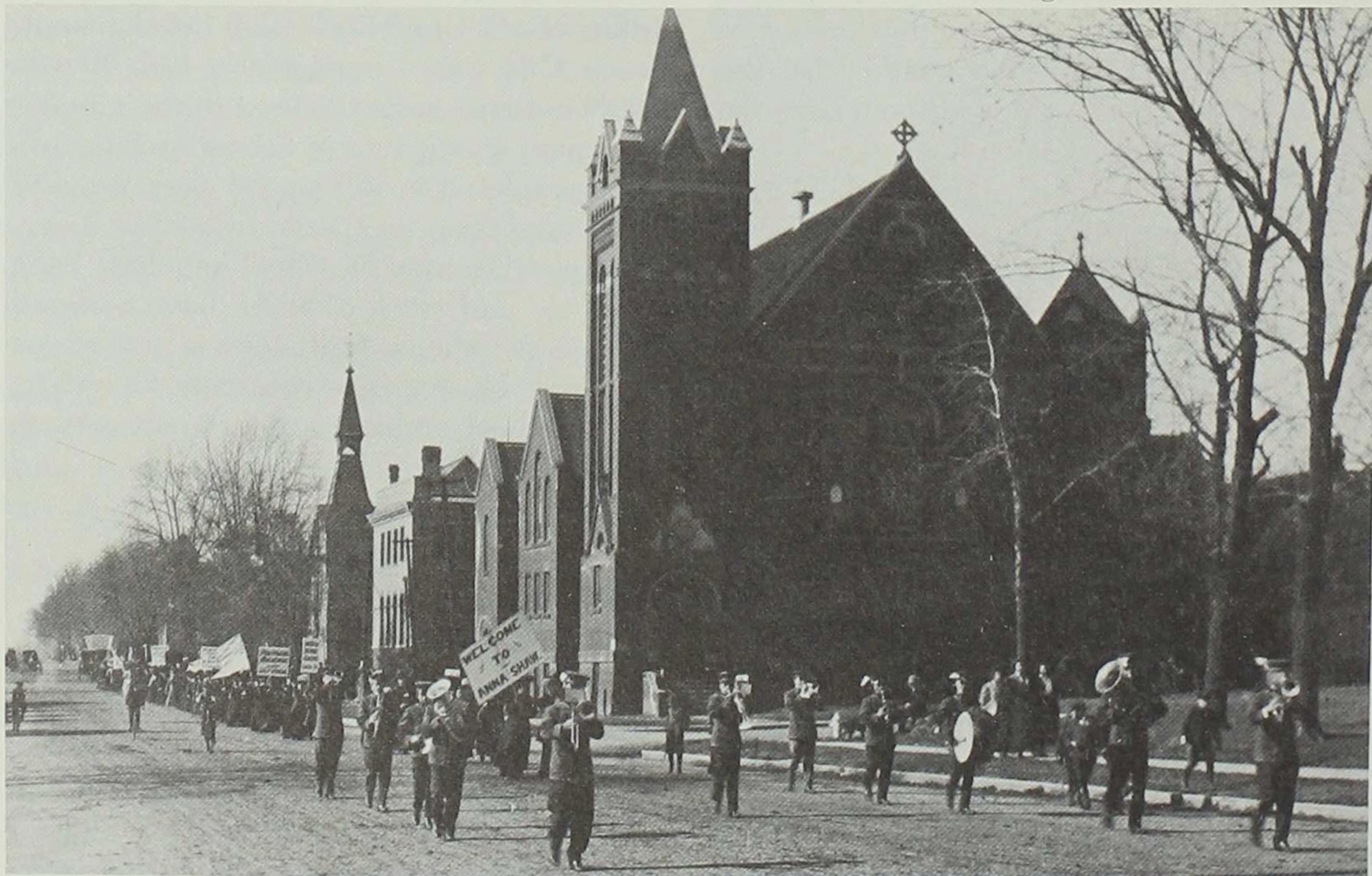
A 1908 parade in Boone, Iowa, in support of woman suffrage.

The social event of the season — a suffrage banquet in honor of Mrs. Carrie Chapman Catt, president of the National American Woman Suffrage Association [NAWSA] — had been the talk of Des Moines for weeks. The concern of the women attending the 1916 banquet and meeting was the status of the Iowa campaign for woman suffrage. Catt met with a group of eager and confident women during the visit. The long-awaited victory seemed close at hand. Since 1894 Iowa women had been allowed to vote on school, municipal, and bond issues, but the right of full franchise had