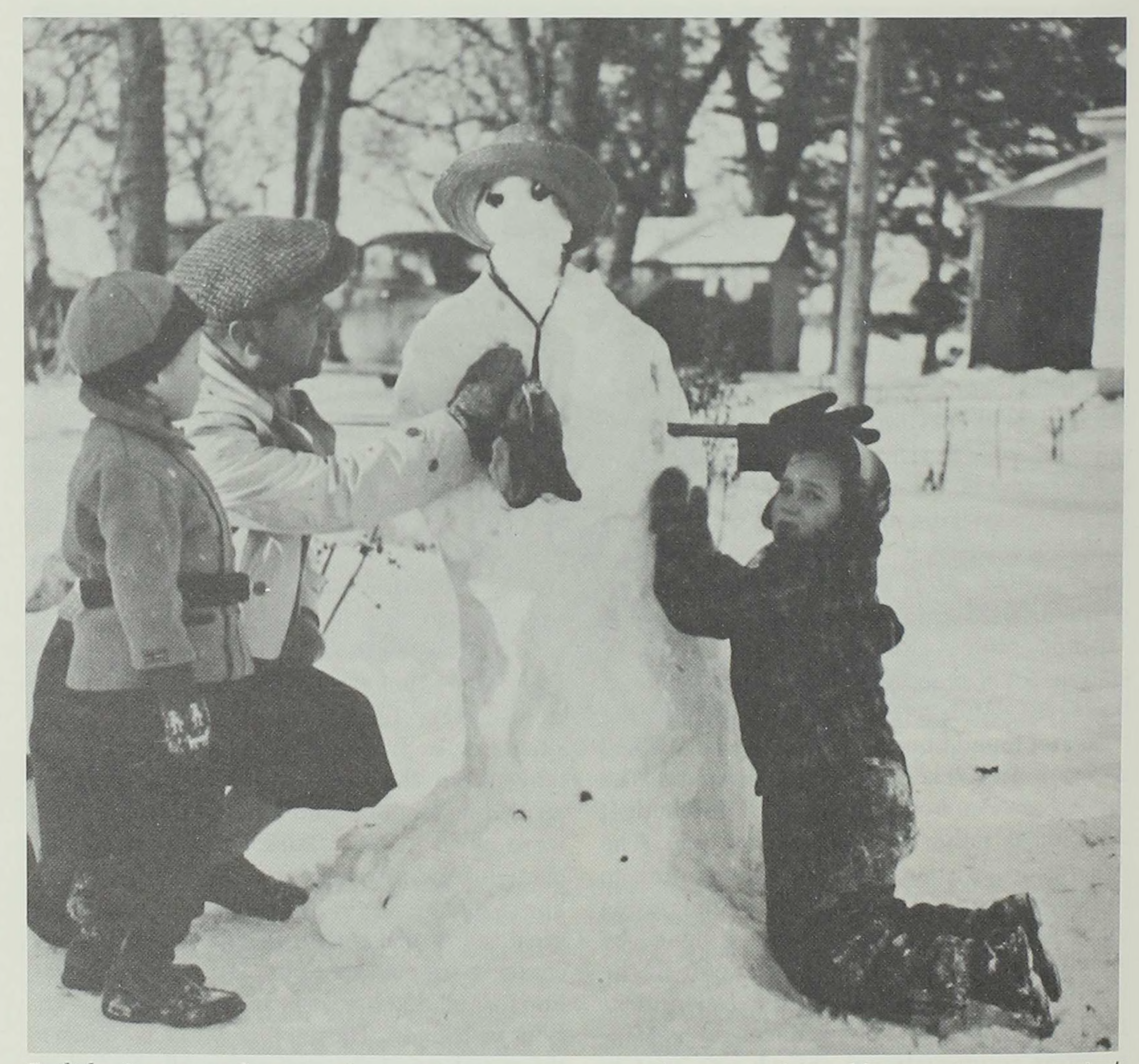
Built by Scattergood guests, this wartime snowman sported a gas mask in addition to its more typical snowman facial features.