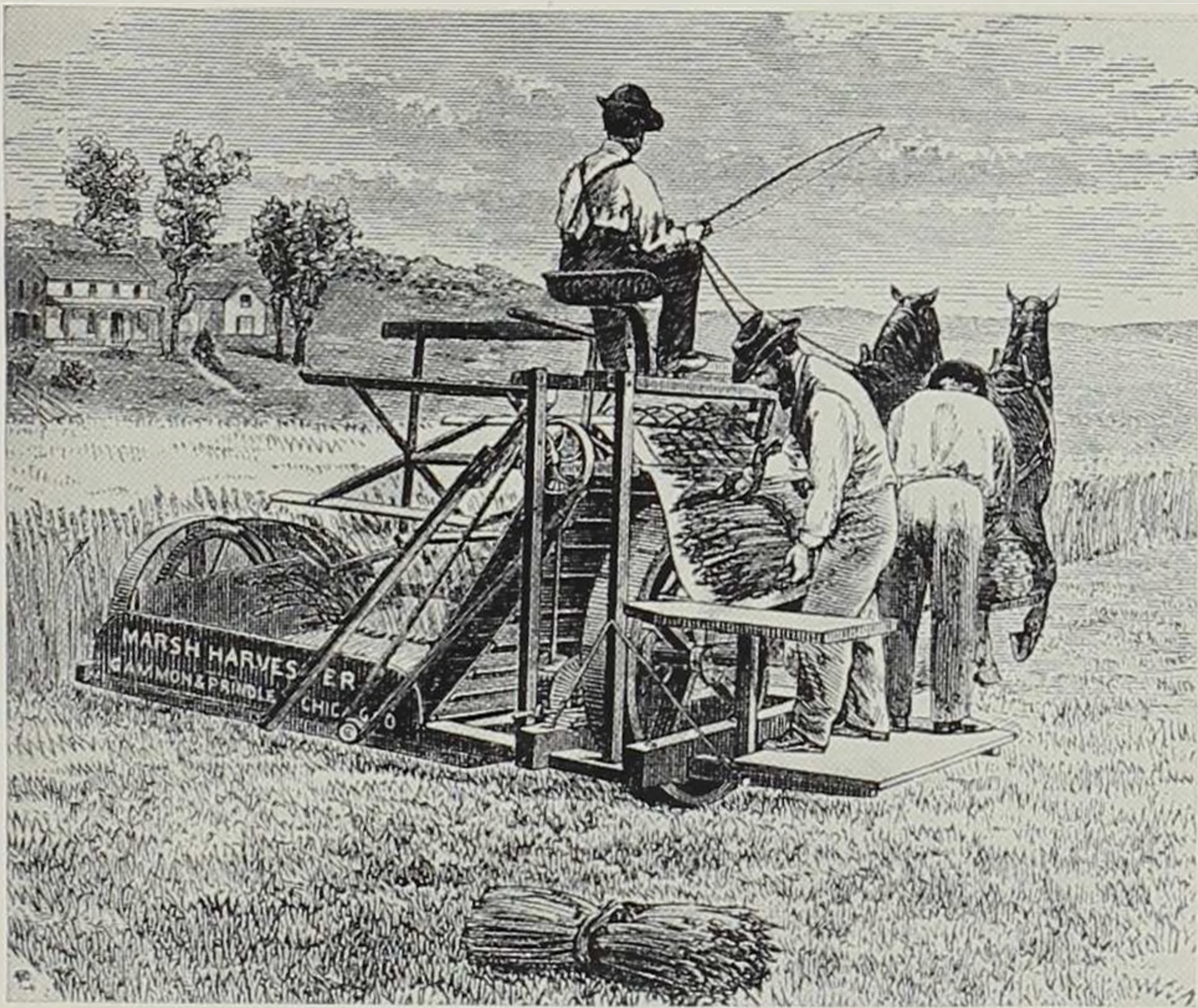
A Marsh Harvester Exhibited in 1867 Two Hundred Were Sold in Iowa That Year