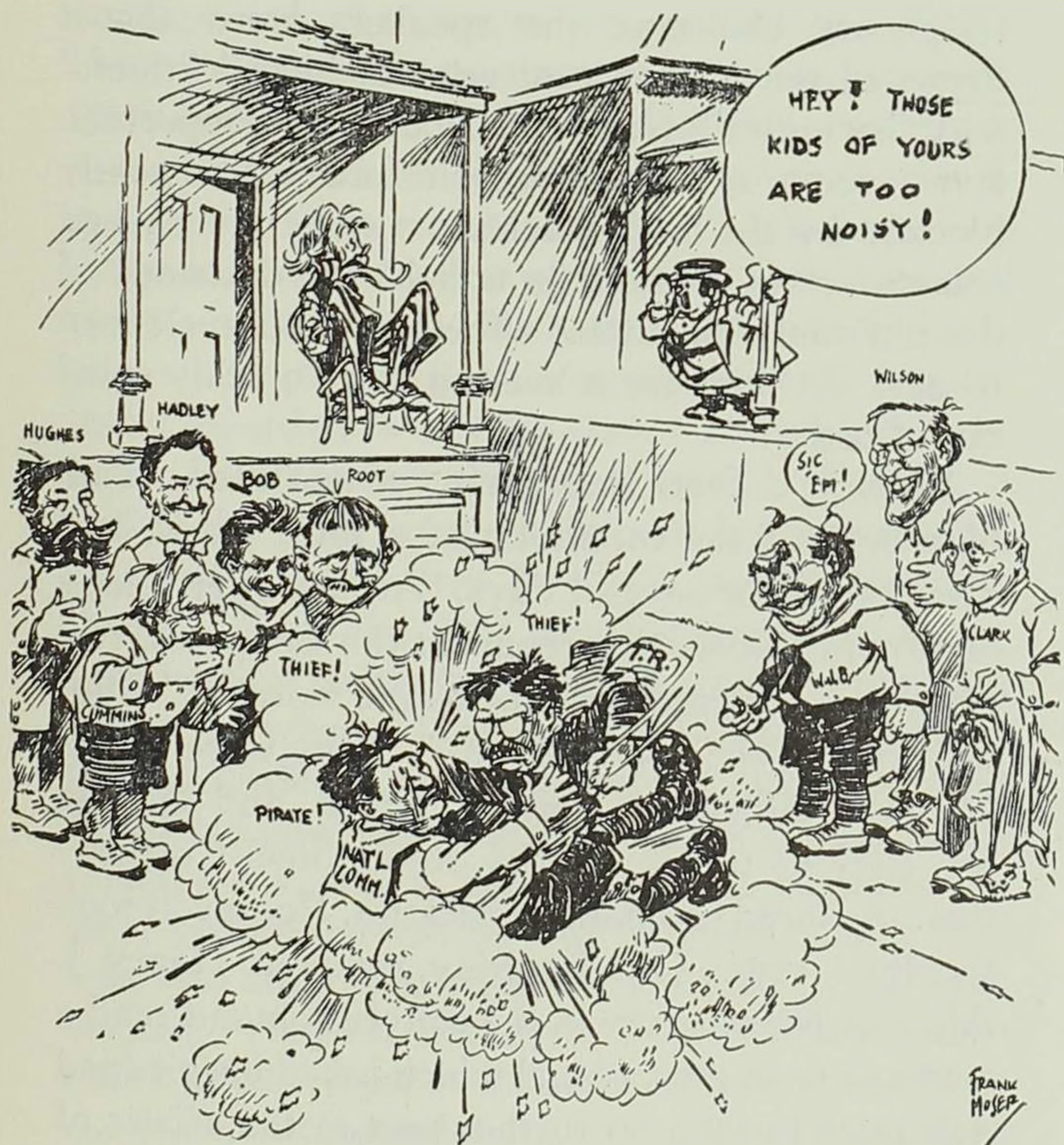
"Man Is Only a Grown-up Boy"

(From the Des Moines Register and Leader, June 21, 1912)