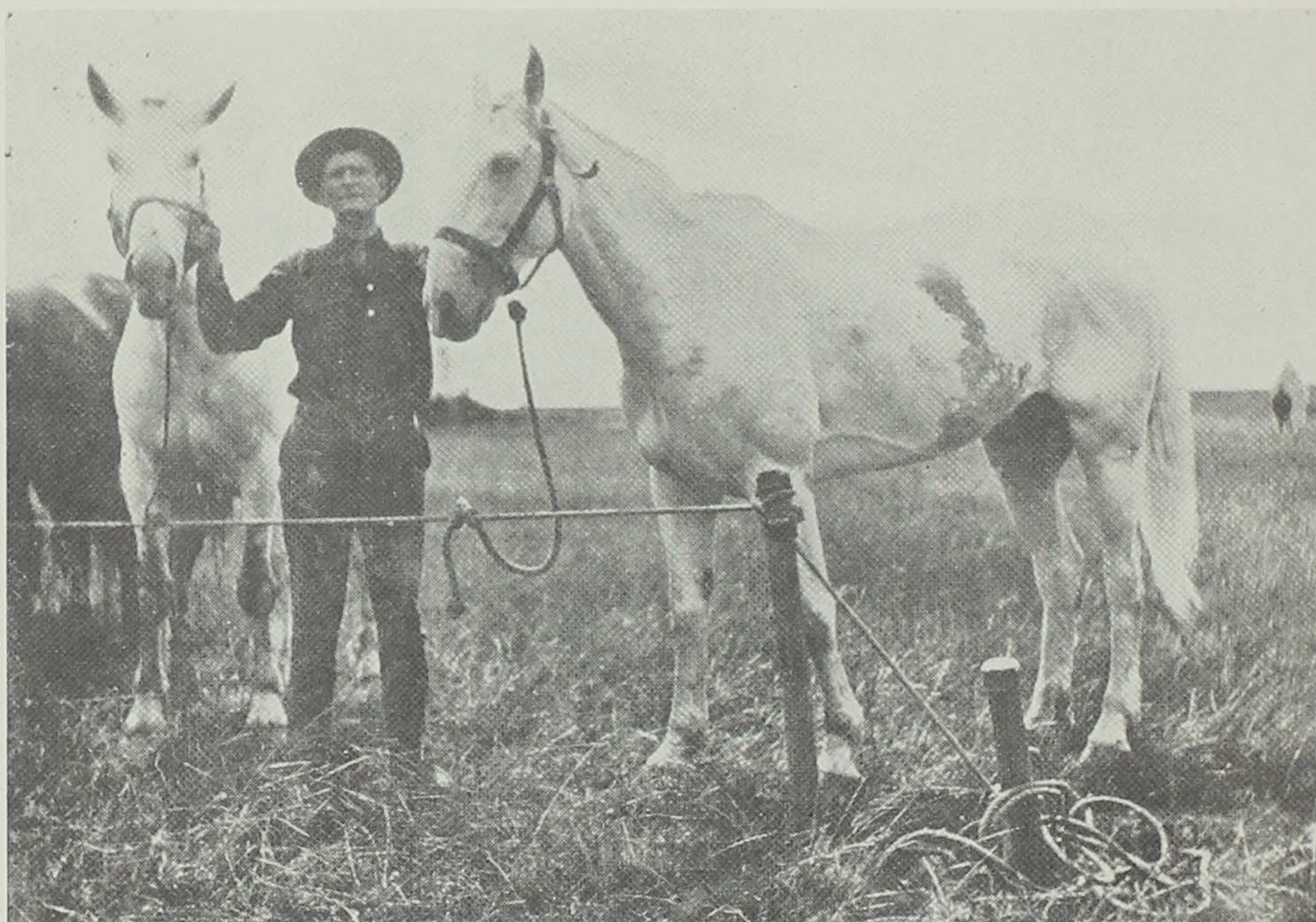
"A Sad Farewell," soon to be shot.