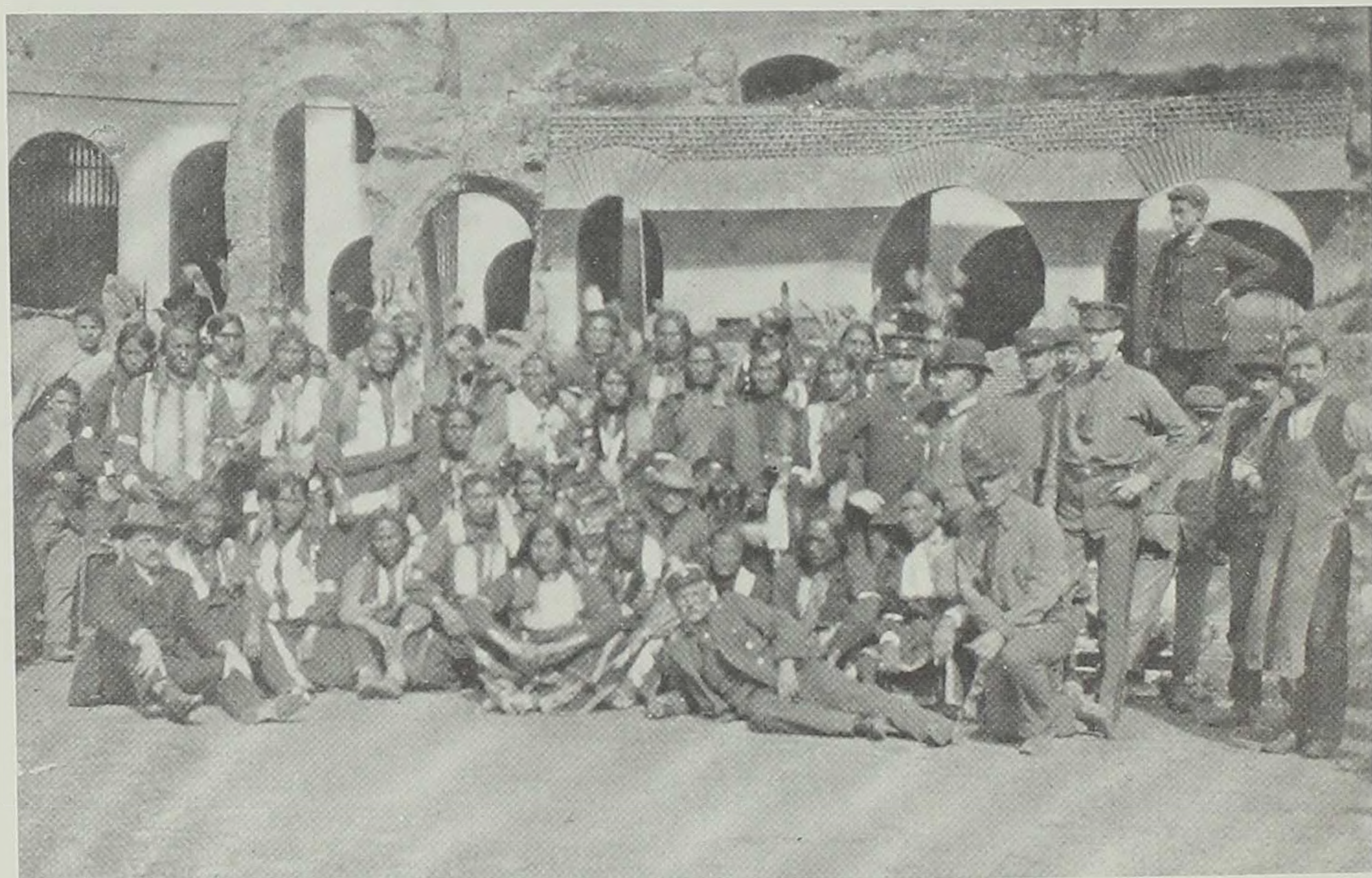
A "Bunch" (to use Griffin's description) of the Wild West in front of the Colosseum in Rome. A strange mixture of Italian workmen, American showmen, and Sioux, the latter decked out in uniform Wild West outfits.

since their inception. Frequently the Review was followed by the "Race of Races"—a spirited horseback contest between American cowboy, Indian, Mexican, Arabian, and Cossack riders which illustrated their differing styles of horsemanship. Next to occur were artillery drills, various military exercises, reenactments of pony express relay rides, attacks on wagon trains, buffalo hunts, and train hold-ups. As the show's program for 1907 noted, no performance was complete without the appearance of Colonel Cody: "The original Buffalo Bill, the last of the great scouts the first to conceive, originate and