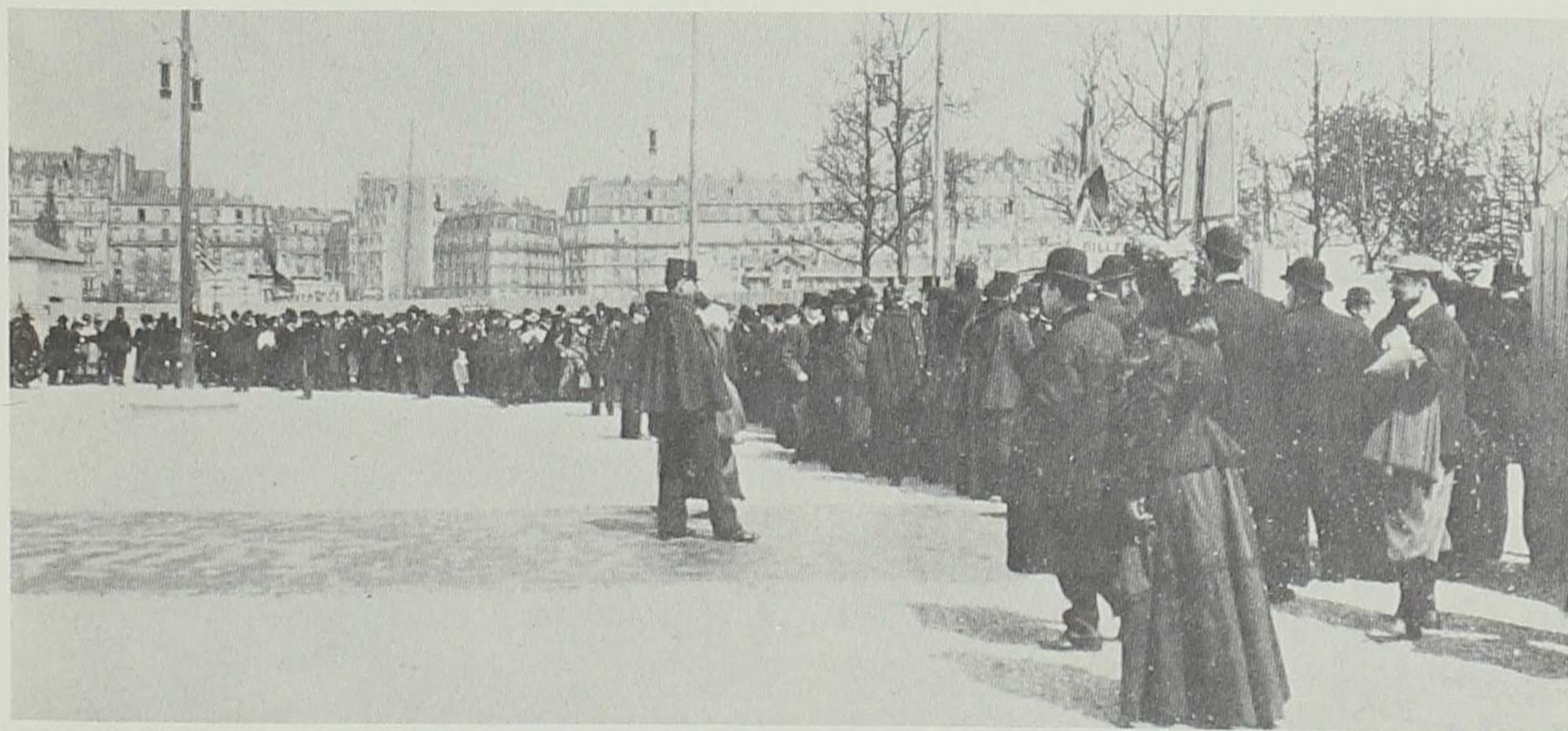
A long line of ticket buyers, waiting to get into the Wild West in Paris, 1905.