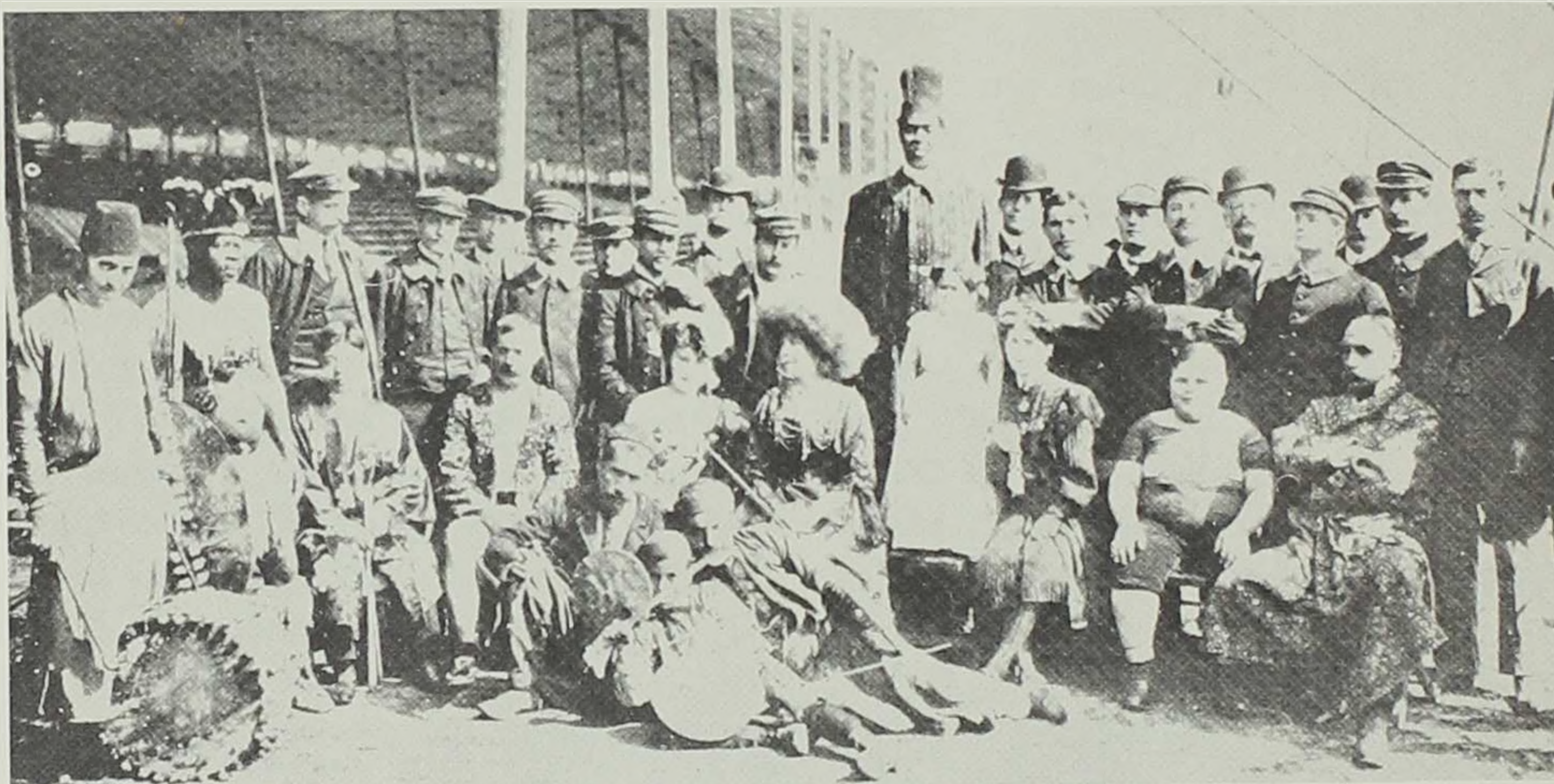
"Les Gallerie de les Phenomen" or the Side Show, Paris, 1906.