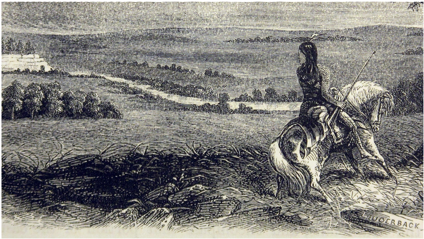
Detail from image above.