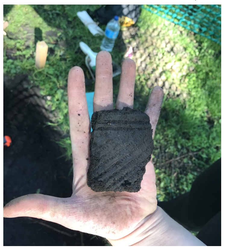
Figure 2. Lake Benton sherd recovered at 13DK143 in 2017.

Pottery sherds (Figure 2) were far more frequently encountered than flaking debris. In total 253 sherds ranging in weight from just .1 to over 70 g were recovered. These sherds were found in virtually all levels excavated in all of the test units, most frequently in Levels 3 and 4. Interestingly the largest sherds, those more than 20 g in weight, were mostly recovered in levels 5 and 6. This may reflect, as with the larger FCR, a tendency for more sizeable artifacts to drift downwards as soil development takes place through time with lighter objects tending to move up in the soil column as an original occupational surface becomes dilated by insects, roots, burring animals, and other bioturbation. Sherds typical of both Fox Lake and Lake Benton wares have been recovered at 13DK143, but the relationship of these materials culturally and chronologically is not fully