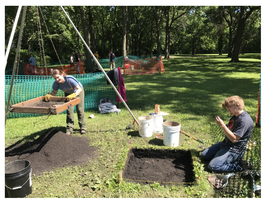
Figure 1. Initial 2017 excavations at 13DK143.

Mini-Wakan State Park is among Iowa's smallest state parks, encompassing just 17 acres. It is all but in Minnesota, in fact the north edge of the park aligns with County Road 2 which also serves as the Iowa-Minnesota boundary. Facilities include a recently renovated Civilian Conservation Corp-era lodge and a busy boat ramp; renovation work on the lodge and associated planning for improved access and additional parking resulted in the discovery (Kendall 2011) and evaluation (Kendall 2012) of 13DK143. These efforts established the site as eligible for listing on the National Register of Historic Places. No additional archaeo-