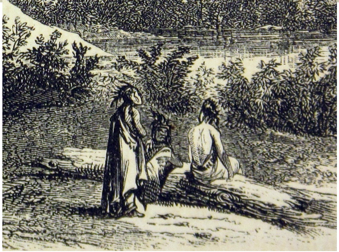
Detail from image above.