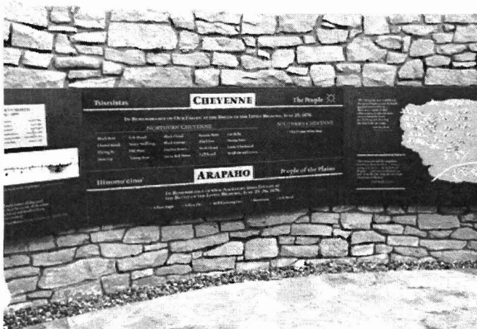
The Cheyenne and Arapaho portion of the new Native American memorial at the Little Big Horn Battlefield, located between the visitor's center and Last Stand Hill.