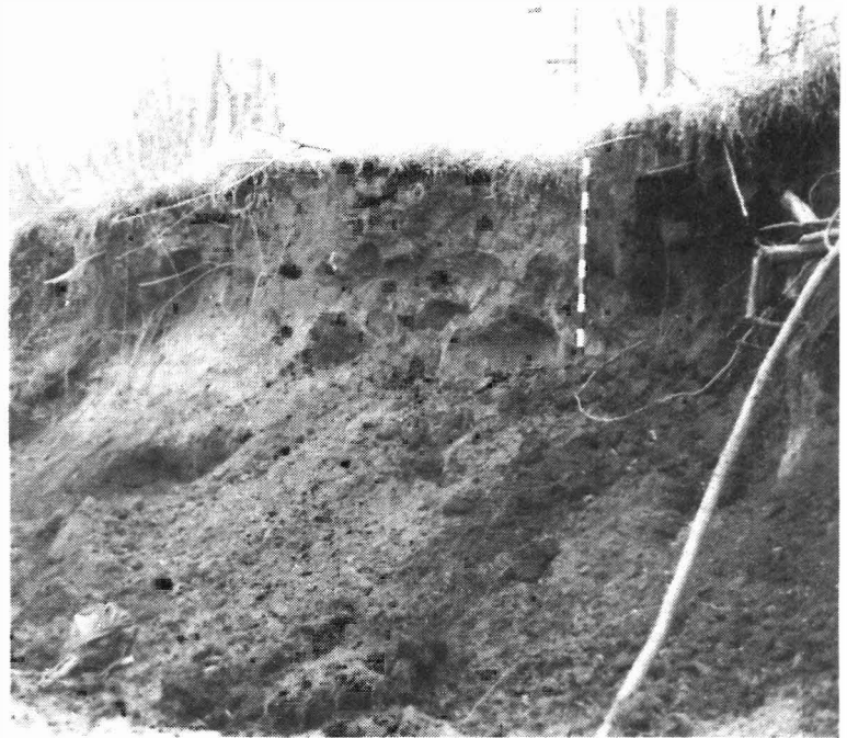
Eroding cutbank.

The next day and a half were spent in the field stabilizing a 100-foot-long cutbank at the Iron Nation site along the Missouri River. All of the above mentioned revegetation techniques were applied to this cutbank in order to give everyone experience with each technique. While some of the methods are fairly labor intensive, the project proceeded smoothly without any glitches.