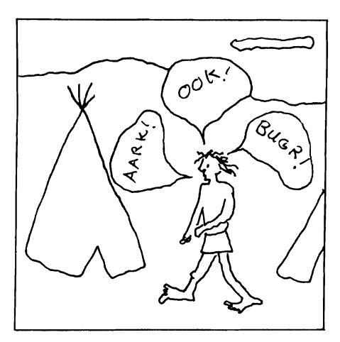
Traveling wordsmiths were vital to the early spread of language.t