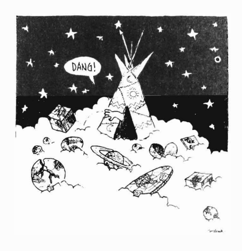
EARTHMAKER'S LODGE (from AnthroNotes)

This resource book is slanted toward grades 4 through 9 readers.