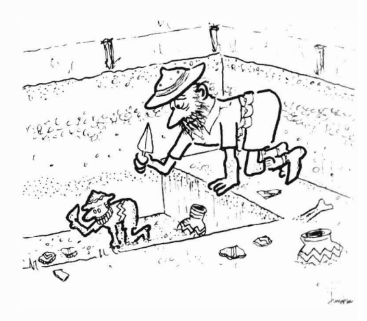
DISCOVERING ARCHAEOLOGY (from AnthroNotes)

This volume is geared toward the middle school grades.