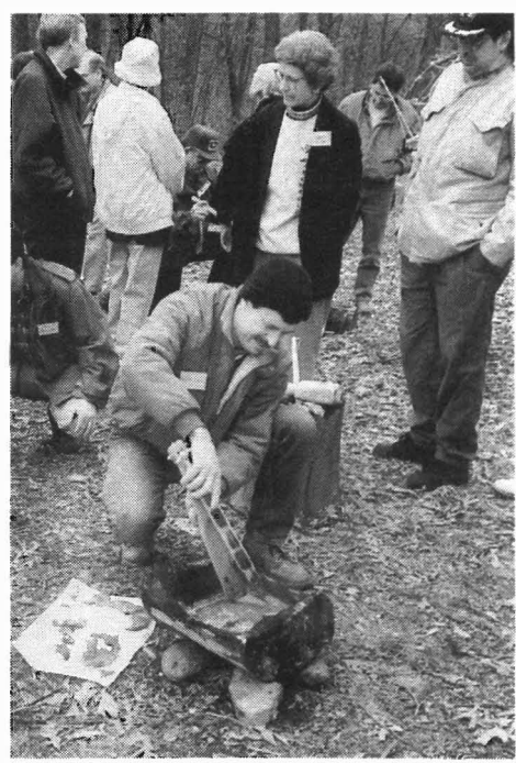
Stone boiling in a hollowed out log.