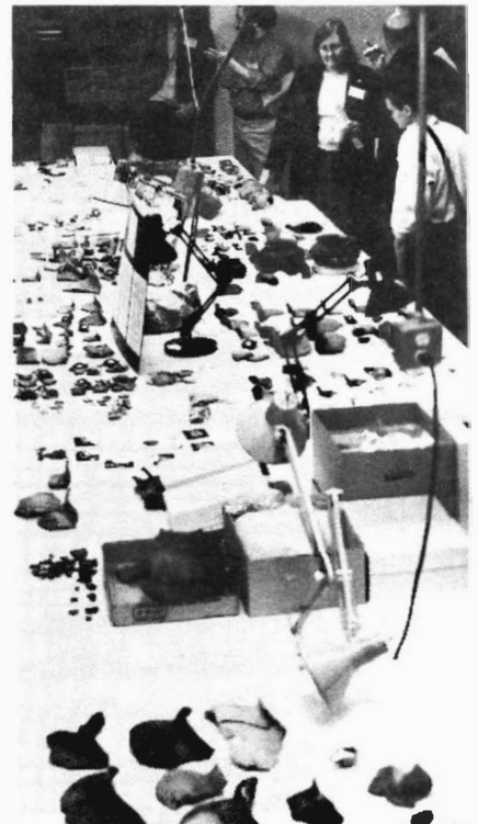
Oneota conference participants examine specimens on display in the OSA lab.

Follow-ups to the conference will include publication of the lectures and a formal symposium at the 1994 Midwest Archaeological Conference in Lexington, Kentucky.