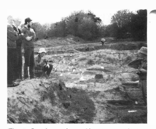
Fig. 5. Southeast Iowa Chapter members observe excavation at Wever.

The first issue of the Southeast Iowa Chapter Newsletter reported that a field meeting in June recorded a site for the State Archaeologist's Office.