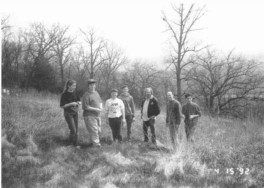
Pekin Middle School tour group at Malchow Mounds state preserve.