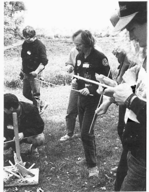
Workshop participants try making arrow shafts.