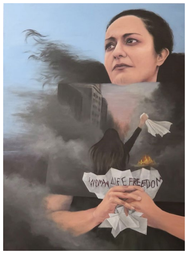
Figure 2. Maryam is a 36'x48' acrylic painting by Elham Hajesmaeili, 2023. An AR video recording is linked here at Maryam .

(Kim-Puri, 2005). Hence, modernist ontologies that rely on dualism (Falcón, 2016) would not help understand complex, changing, and simultaneously intersecting identities of transnational spaces; instead, a relational ontology that rejects dualism is required in doing research transnationally. Therefore, I utilize transnational intersectionality (Purkayastha, 2010) as a theoretical framework in AR portraiture methodology to study changing axes of power and domination shaping Iranians' lives in transnational spaces and examine their complicated experiences from different angles. The combination of these elements allowed for a unique and multifaceted approach to conducting research, offering a range of perspectives and insights into the experiences of the participants.