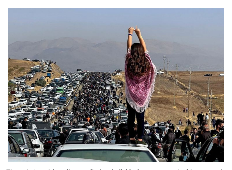
Figure 3. A social media post displays individuals en route to Aychi cemetery in Saqqez, as captured in the photo by UGC/AFP.

suppressed the Iranian people for over forty years. Mahsa's funeral, and many other funerals held during the crackdown on protesters, is a potent reminder of the human cost of the Islamic Republic regime's brutality and repression. Every mother's scream over the grave of her youth (who make up the majority of victims) is recorded, shared, and reshared—and her pain is felt and validated by every Iranian. Iranians outside of Iran who felt powerless to help have taken it upon themselves to magnify these voices through social media and protests in front of the Iranian embassies, universities, and other public sites all around the globe.