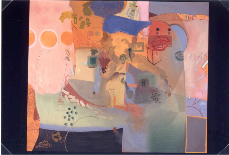
Fig. 5: Doodle Abstraction Series #3