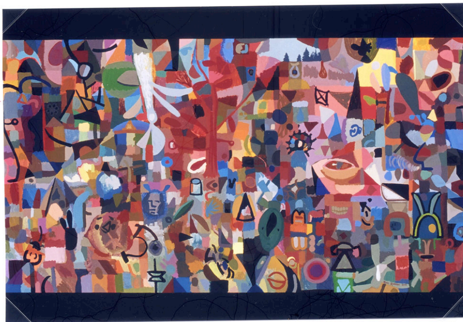
Fig. 8: sally #2