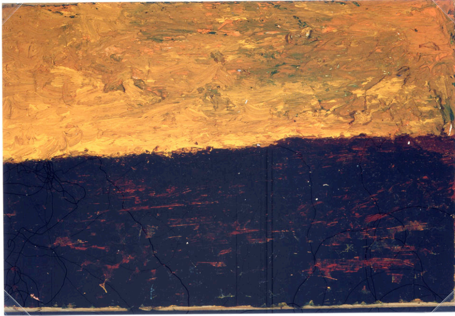
Fig. 1: The Gravity Series