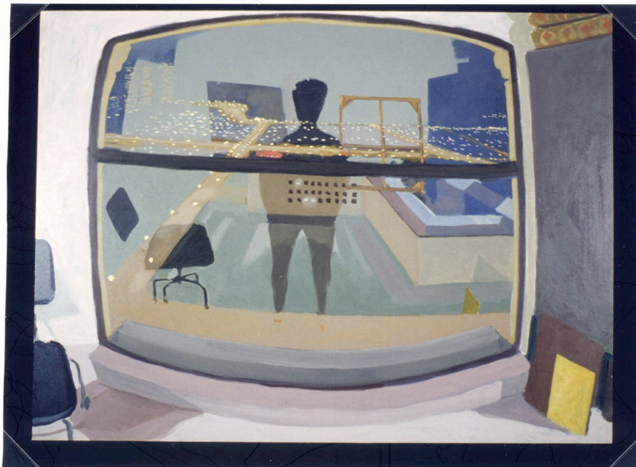
Fig. 4: Night Studio