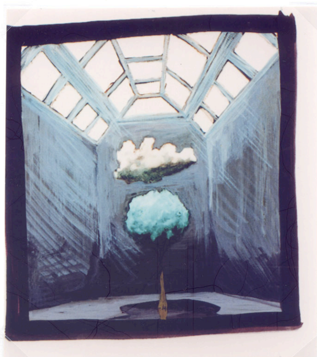
Fig. 2: Interior Tree