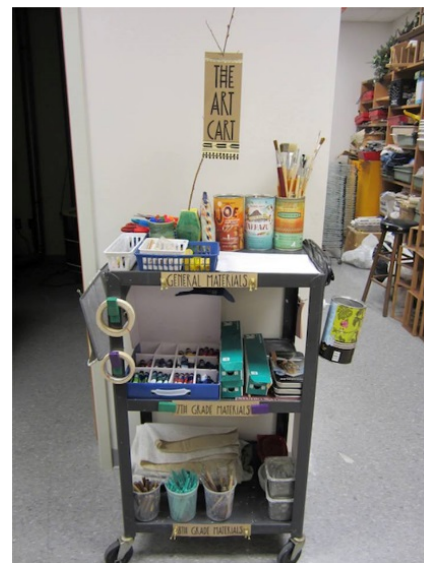
FIGURE 2B: AFTER

Such accommodations make the cart functional as a mobile interface with each of the classrooms Karen teaches in making it more conducive to her teaching tasks. Karen also had to learn to strategically interact with the art rooms between classes...how to move the cart from room to room—how fast, which route, where to position the cart (See FIGURE 3).