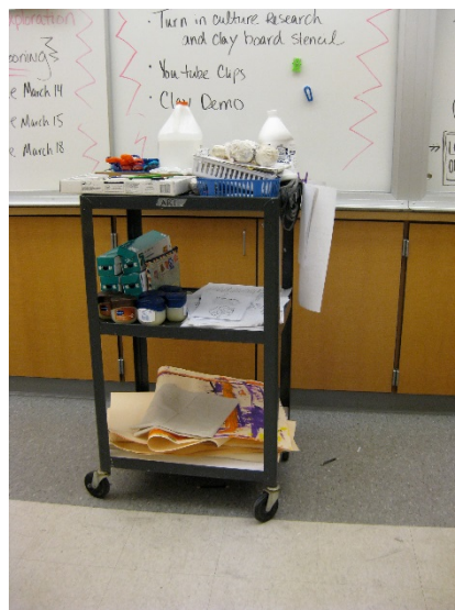
FIGURE 2A. A: BEFORE

Karen works from a repurposed overhead projector cart with three shelves. It is top-heavy, and often too small to accommodate the supplies she needs for multiple classes with upwards of 30 students. She says of her cart: "It's very hard to organize things on it...because there aren't any compartments or anything on it. Or not even a ledge on the edge to keep things from falling off" (Karen, February 18). To make the cart functional Karen chose to augment the cart with magnetic hooks, zip-tied mail slots, and bins and labels (see Figures 2a and 2b).