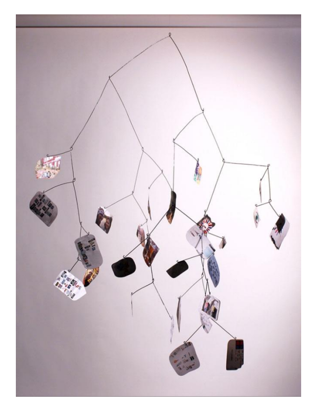
FIGURE 5. COMPASSION FATIGUE MOBILE BY THE TEACHER AND AUDREY REEVES, MARCH 2019, WIRE HANGERS, PAPER, AND FISHING LINE, 48 x 60 in.

Overall the sculpture shows the balancing act of student trauma and teacher self-care, or work life with a personal life, where lack of balance leads to teacher burnout and dropout. The weight of the shapes represents students' trauma emotionally weighing on teachers. Bending wire, which is laborious yet fragile work, ties into the theme of compassion fatigue as demanding and delicate work. The wire never becoming quite straight, and the sculpture never quite balanced shows the impossibility of perfection. There is no perfect way to handle a students' trauma and each unique case will be drastically different. The removable/interchangeable shapes represent the possibility of encountering new trauma with new students each year, yet some trauma may stay constant. Some of the sculpture's meaning came from dialogue with the teacher after the artmaking.