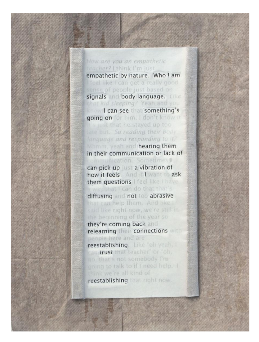
FIGURE 1. PARTICIPANT-VOICED POETRY