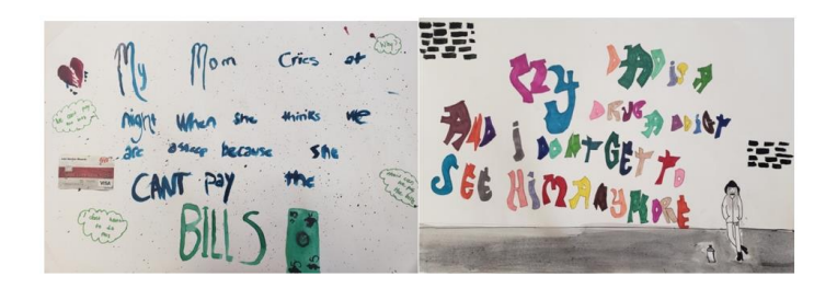
FIGURE 3. STUDENT ARTWORKS

The particular lesson displayed had a goal of building empathy. Students anonymously shared a "secret" based on a challenge in their life. Secrets were typed up, then students chose a random secret from a basket and interpreted them visually. Some secrets were more 'normal' issues, for example insecurity and fitting in, while others shared trauma, such as "my dad is a drug addict and I don't see him anymore." The other side of the sculpture consists of photographs of the teacher and I participating in a self-care challenge, showing how teachers cope with trauma, for example doing yoga or talking to colleagues.