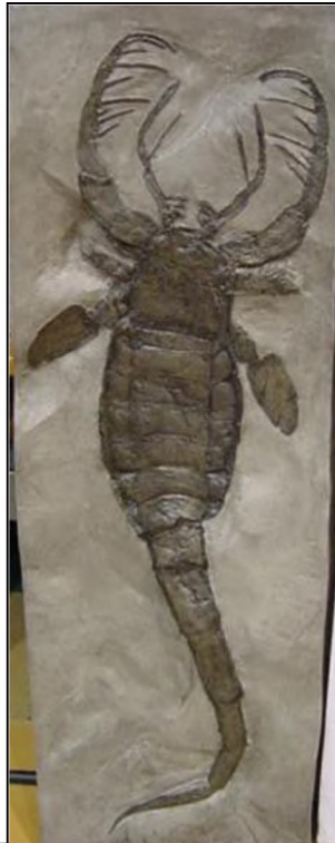
This large eurypterid was at Expo. The editor does not know if it was real, cast or composite.