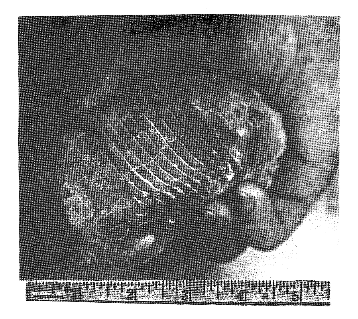
The picture is actual size and was photocopies on a Kodak copier.

The Bumastus is 5 inches long, 3^{1}/4 inches wide and 1^{1}/2 inches in height. It is beautifully 3 dimensional and about 90% complete. Missing is a small lip-like mouth or chin under the head, 1/3 of its tail and about 1/4 inch of the lower thorax sections on both sides.