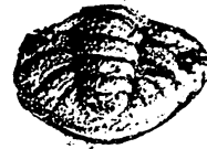
Bumpy-nosed trilobite: Hystericurus sp. from the Lowermost Ordovician Gasconade Fm. of the MO Ozarks.