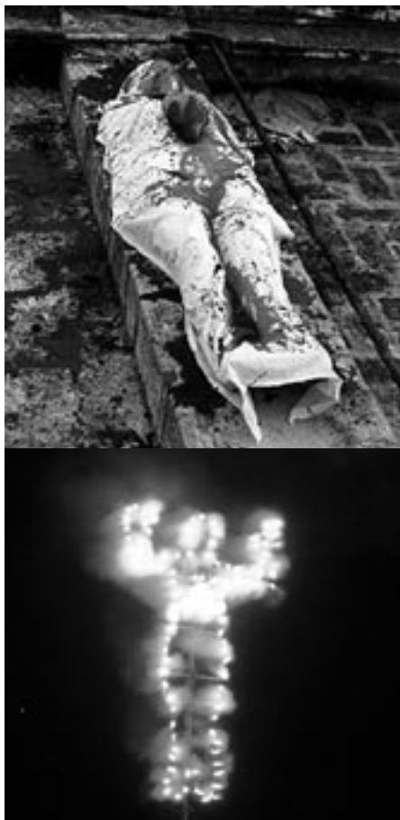
(top) Untitled (Hotel Principal Oaxaca, MX); Soul, Silhouette of Fireworks (detail)

Another silueta project, which produced possibly her most famous image, is called