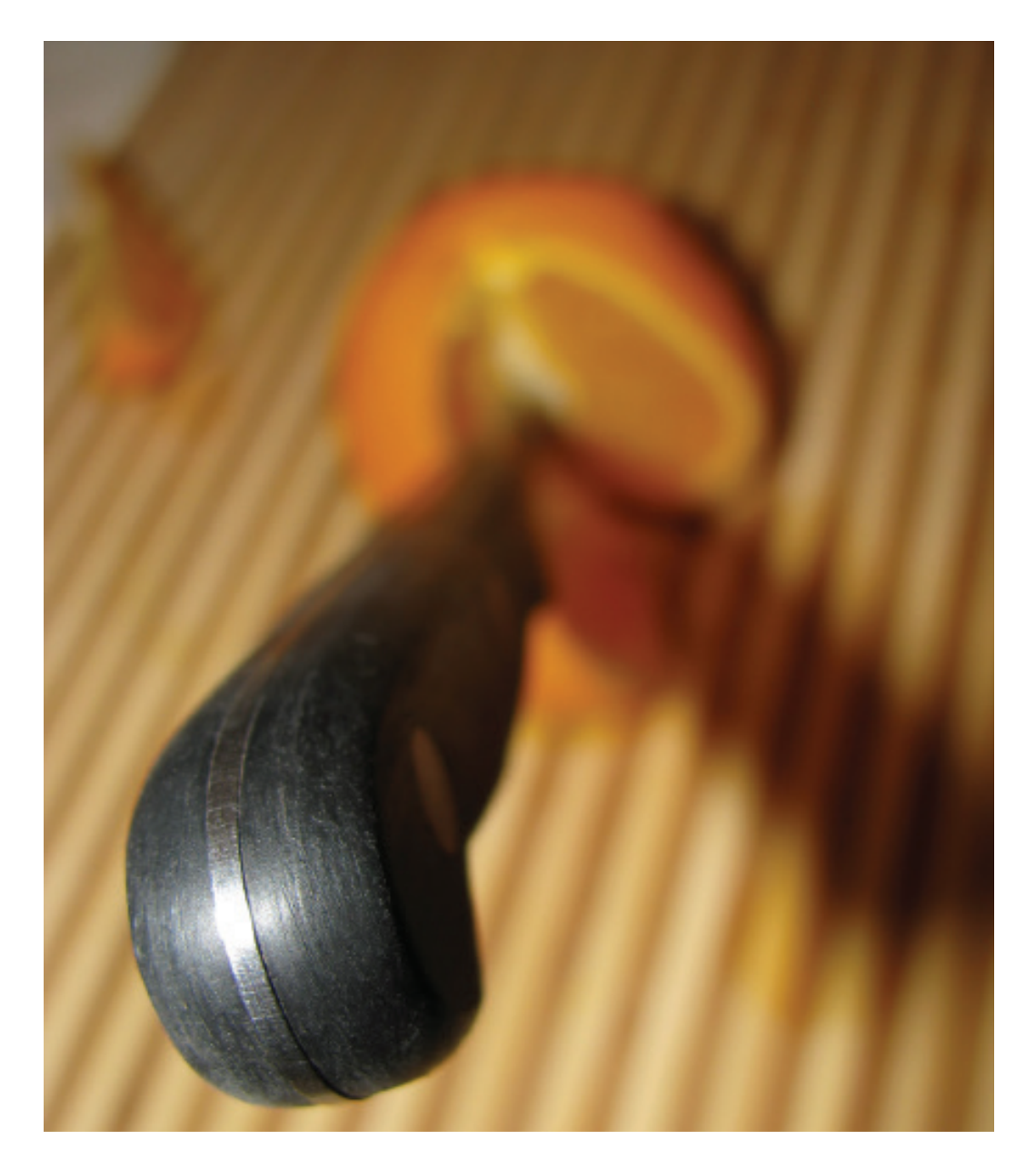
"Orange Slice"