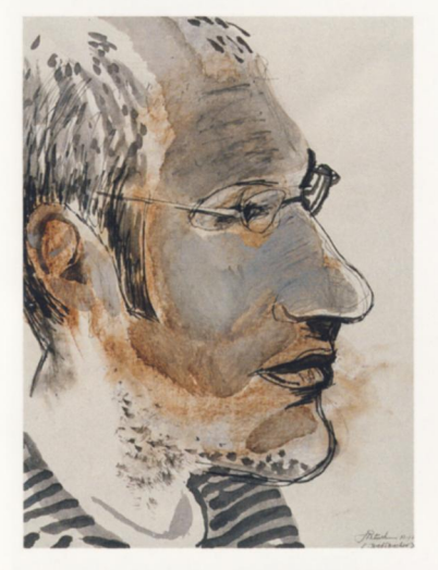
VOLUME THIRTY-FOUR NUMBER ONE