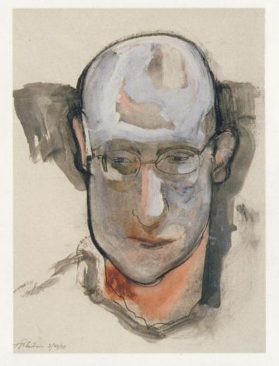
VOLUME THIRTY-FOUR NUMBER TWO