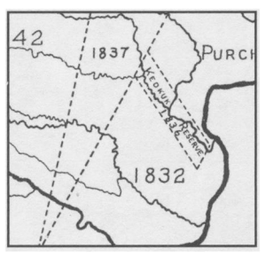
Fig. 2. Enlargement: the Iowa River with Keokuk's Reserve.

join Black Hawk's War. The Reserve stretched along both sides of the Iowa River, encompassing some 400 square