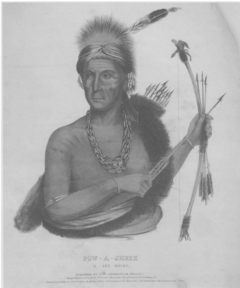
Fig. 4. George Cook painted this portrait in 1837 during Poweshiek's visit to Washington, D.C. with the large Sauk and Meskwaki delegation.

Gilbert's gamble on the land along the Iowa River was paying off. Now his post was servicing new settlers as well as supporting trade with the Meskwaki. With the help of local men in need of work, he built his second, larger trading post closer to Poweshiek's village and broke off his association with the American Fur