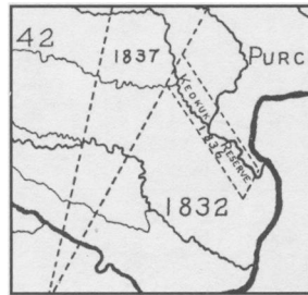
Fig. 2. Enlargement: the Iowa River with Keokuk's Reserve.

join Black Hawk's War. The Reserve stretched along both sides of the Iowa River, encompassing some 400 square miles (fig. 2). Preferring negotiation to open resistance, Keokuk and his followers had avoided the war's catastrophic conclusion. In August 1832, the U.S. Army, assisted by the steamboat Warrior , massacred some 500 Sauk and Meskwaki men, women, and children on the east bank of the Mississippi at the mouth of the Bad Ax River. The Battle of Bad Ax, as it came to be known, marked the end of the Sauk and Meskwaki struggle to maintain control of Saukenuk, the Sauk's primary village on the lower Rock River (present-day Rock Island). In the treaty negotiations that followed the Battle of Bad Ax, the United States was able to appropriate millions of acres of land on the west side of the Mississippi through the First and Second Black Hawk Purchases and the cession of Keokuk's Reserve. Johnson County was at the geopolitical center of these land transfers. One or more borders of each of the three treaty cessions lay