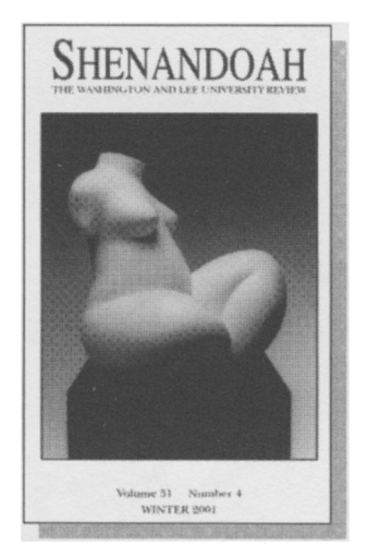
"... a showcase for exceptional writing." --- The Washington Post Book World